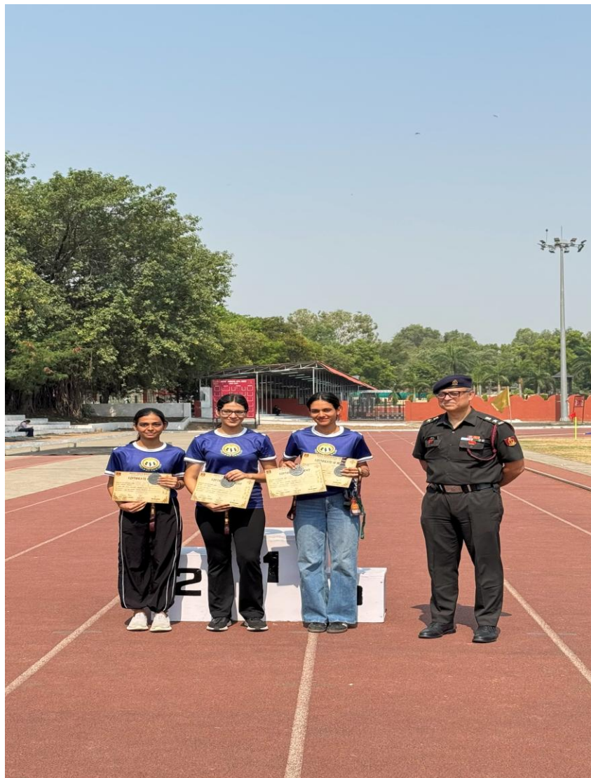
4x100 Meters Relay (Girls) – 2nd Place

SHRI B. M. PATIL MEDICAL COLLEGE, HOSPITAL & RESEARCH CENTRE, VIJAYAPURA