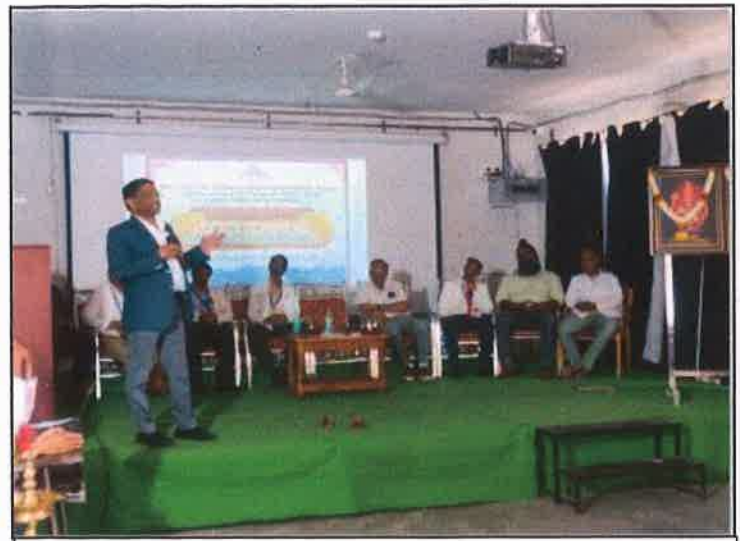
Delivered Inaugural address at PG Induction Program