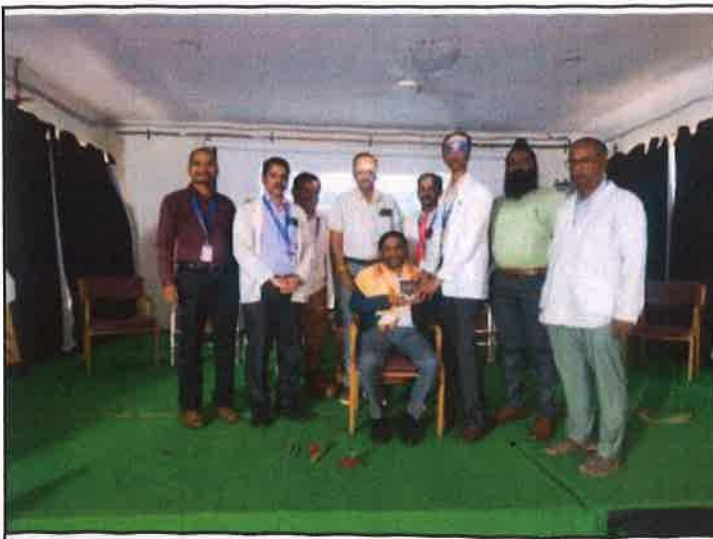
Felicitated by Host Institute