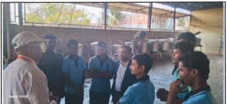
Visited hostel which accommodates 3000 students with free hostel facilities including mess