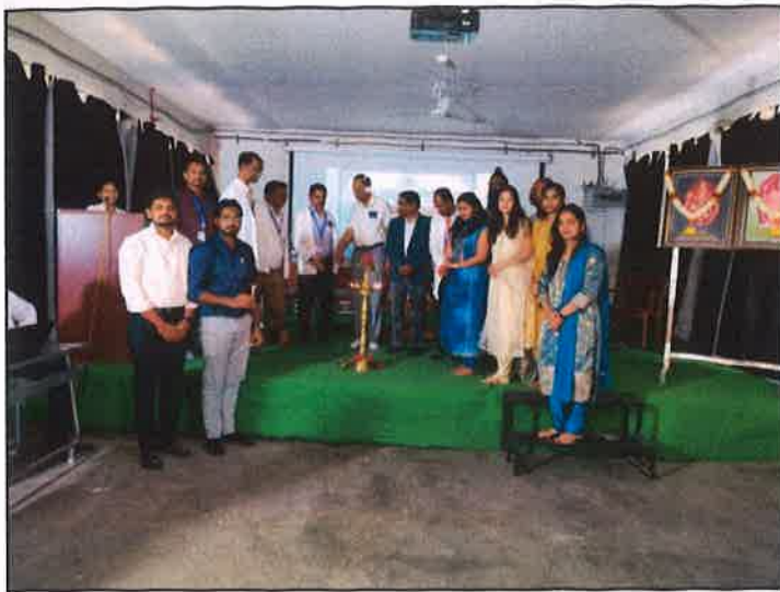
Inaugurating PG Induction Program (Samskar)