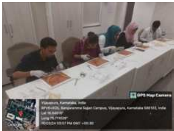
PG's of Al Ameen Medical College, Vijayapura