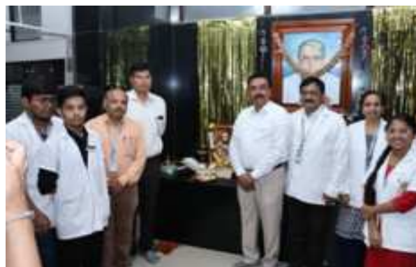
Chatrapati Shivaji Maharaj Jayanti observed on February 19, 2024