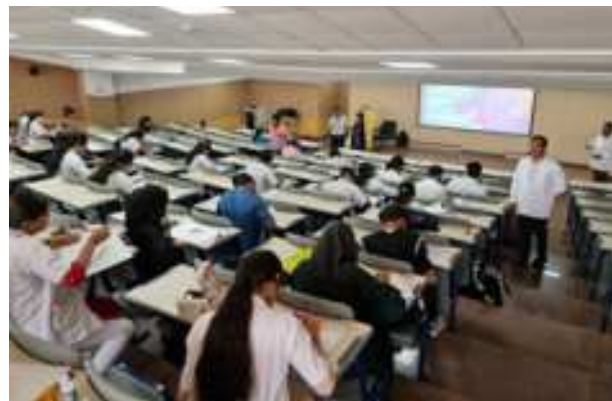
Students performing the painting Competition