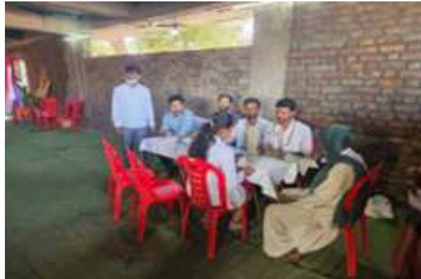
Free Health Checkup Camp was conducted by the Department of Cardiology, Urology & Neurology at Horti on February 24, 2024.