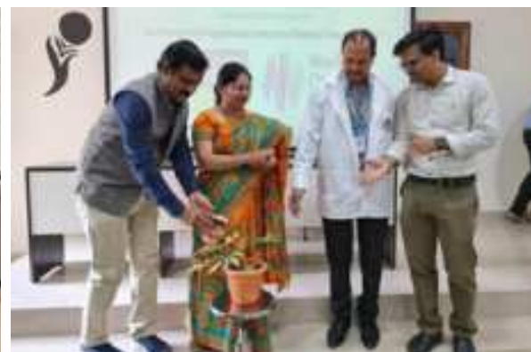
World Obesity Day was observed on March 14, 2024