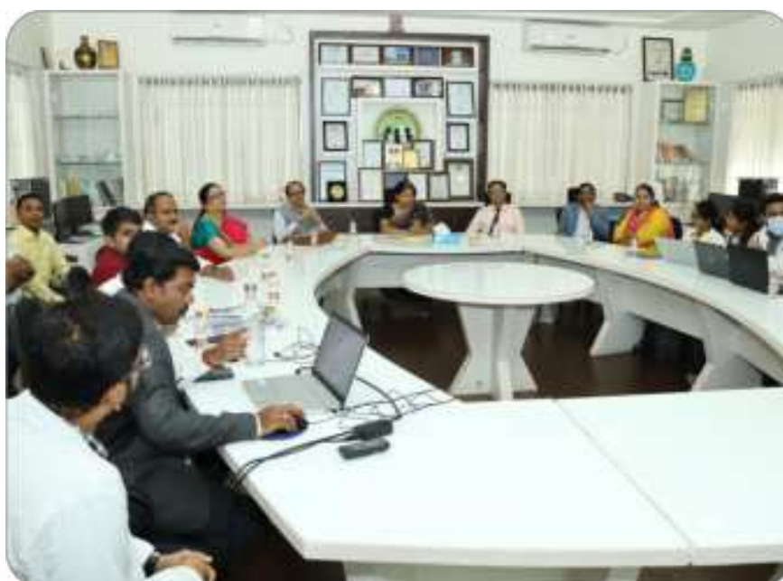
Dignitaries at Workshop