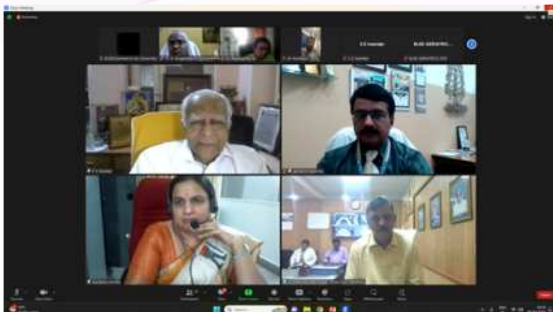
Dignitaries at Zoom Webinar