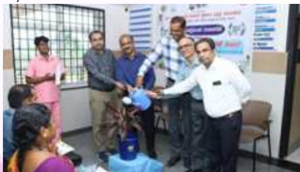
World Kidney Day was observed on March 14, 2024