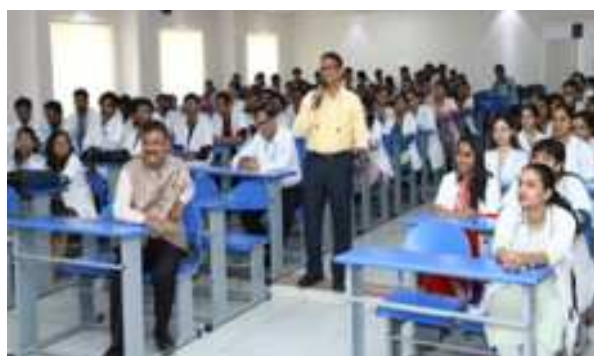
Virtual Interaction session with a Resource Person