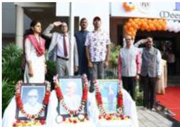
Republic Day was celebrated on January 26, 2024