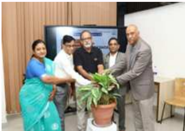
Dignitaries inaugurating the workshop