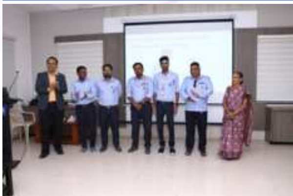
Mr. Siddaling Talikoti conducting the Activities