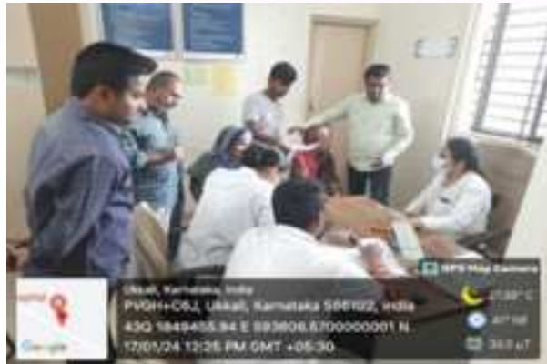
Eye Camp was conducted by the Department of Community Medicine in collaboration with Department of Ophthalmology at RHTC Ukkali on January 17, 2024.