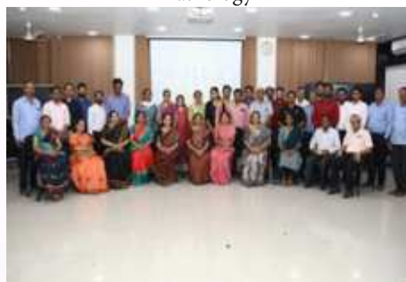
Resource Faculty & Participants