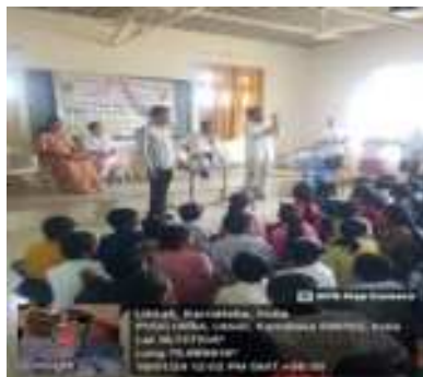
BLDE Primary School, Ukkali on January 19, 2024

The Department of Community Medicine organized the Health Education Program on “ Demonstration of Hand Washing Technique ” at Various School in Ukkali.