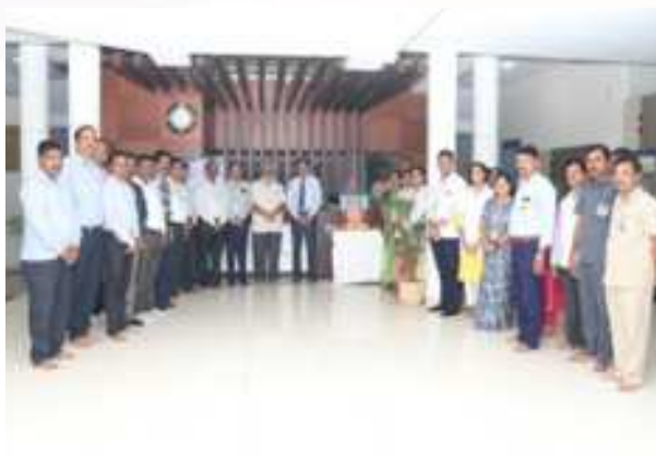
Swami Vivekananda Jayanti was observed on January 12, 2024 in the University