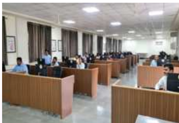
Participants at Training Session