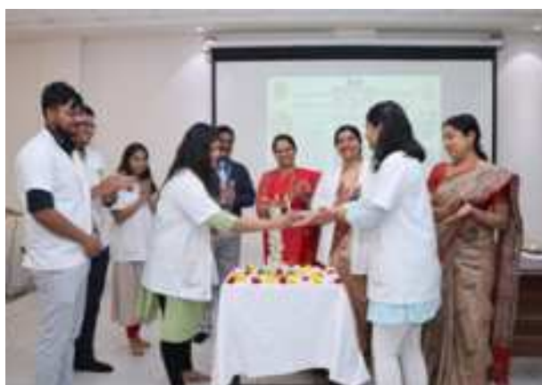
Dignitaries & Students inaugurated the event