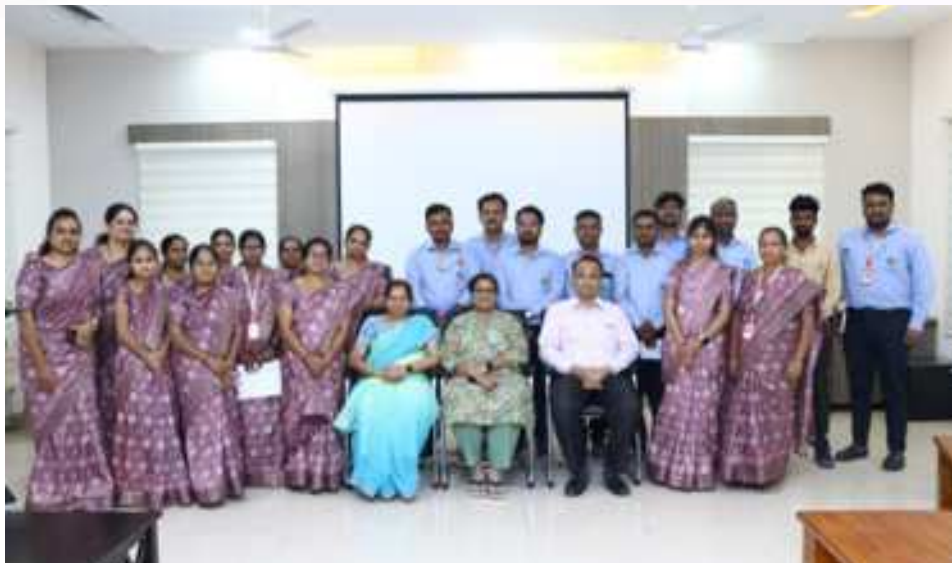
Organizing team & SDA's at PDP on Telephonic Etiquettes