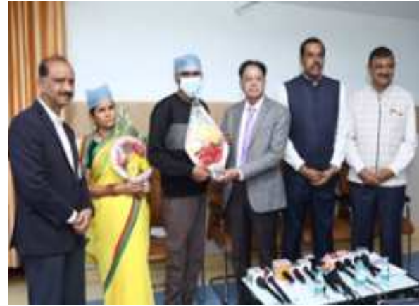
Hon'ble Vice-Chancellor wishing the Patient