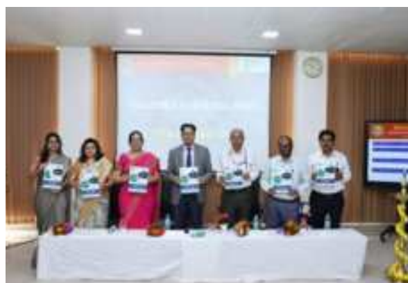
Dignitaries releasing the information Booklet