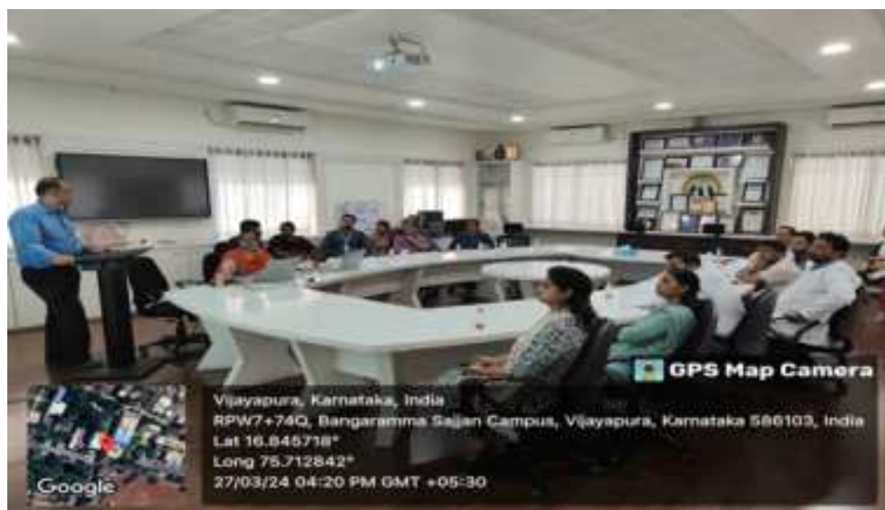
Faculty members of School of AHS, School of Physiotherapy and School of Applied Science & Technology at FDP