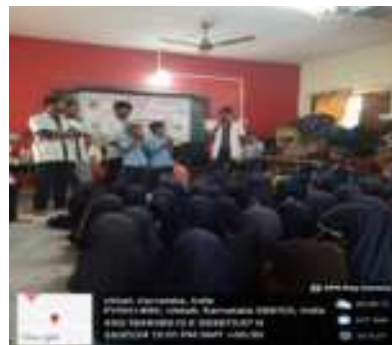
Govt. Urdu Primary School, Ukkali on January 24, 2024