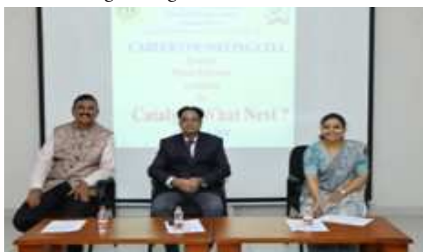
Dignitaries at Dias