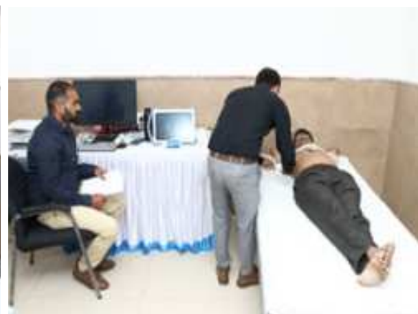
Free Fibro Scan Camp was conducted by Shri B. M. Patil Medical College Hospital & Research Centre, Vijayapura at New Trauma Center Building on January 29, 2024.