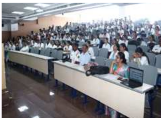
Students, Faculty Members & Non Teaching Staff at program