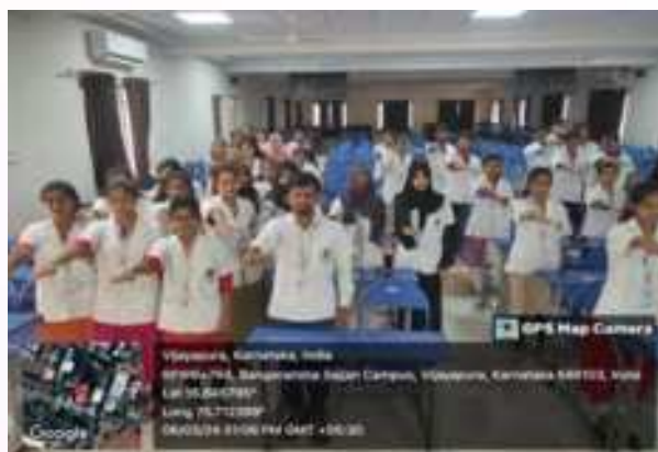
Pledge Oath taking by Students at Sensitization Program