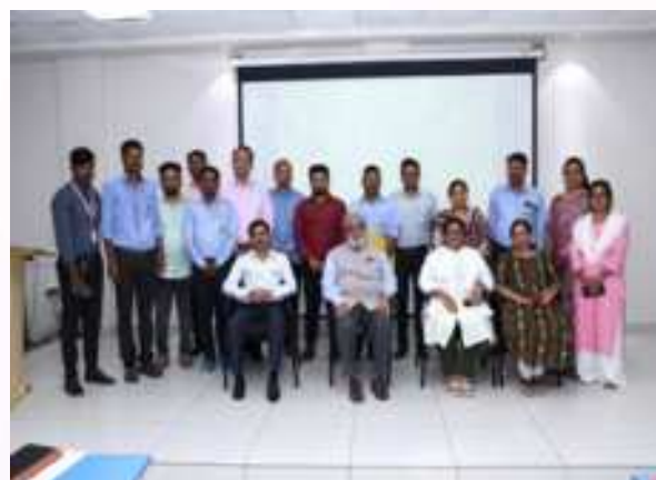
Dignitaries & Organizing team at Training Session