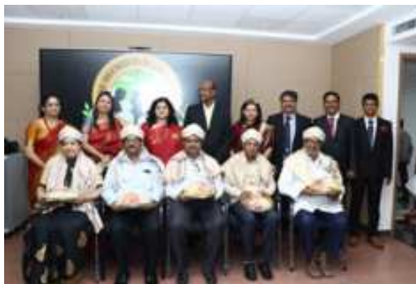
Felicitation to Faculty Members