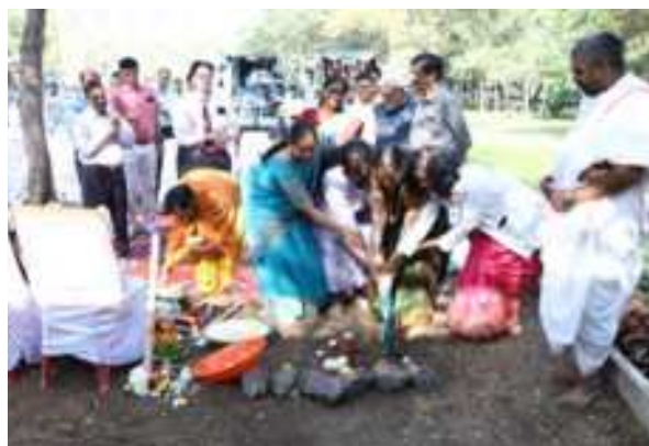
HoD's & Faculty Members