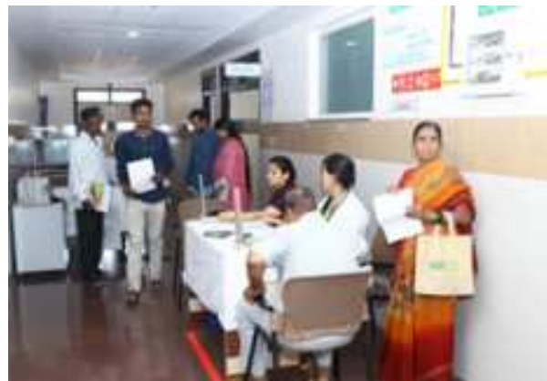
On the occasion of World Kidney Day Free Health Urology Camp was conducted by the Department of Urology at Shri B. M. Patil Super speciality Hospital on March 14, 2024.