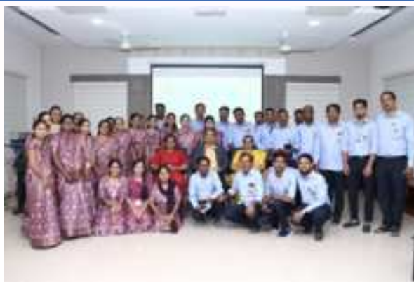
Organizing team & SDA's at SDP on Soft Skills