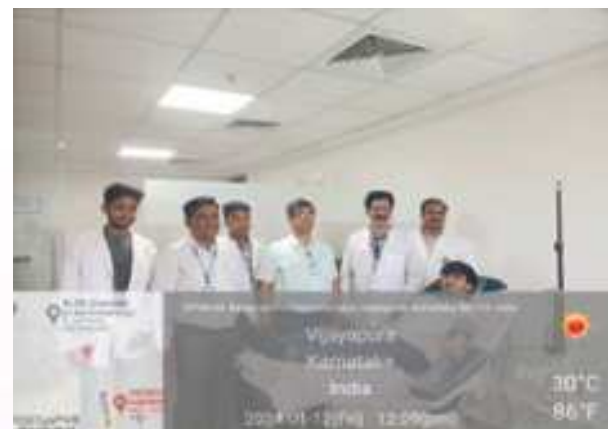
Blood Donation Camp was conducted by Department of Pharmacology in collaboration with the Department of Pathology, on “National Youth Day” at Shri B. M. Patil Medical College Hospital & Research Centre, Vijayapura on January 12, 2024.