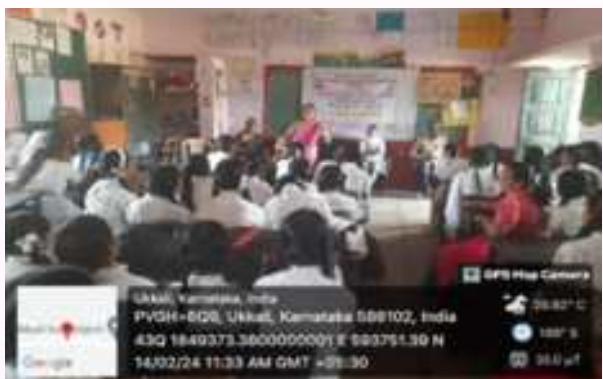
Govt. Kannada Girls Primary School, Ukkali February 14, 2024