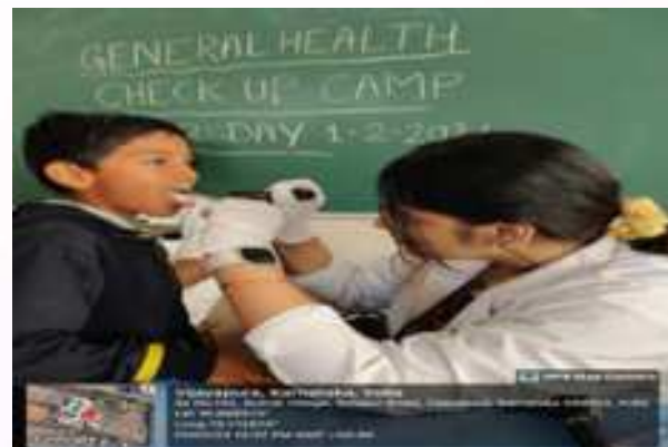
Free Health Checkup Camp was conducted by the Department of ENT at Vijayapura on January 30, 2024 & February 01, 2024.