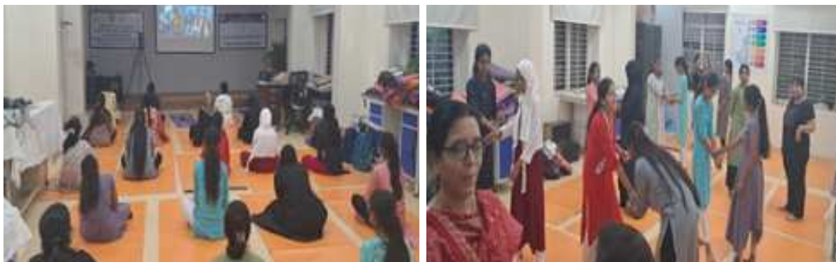
Faculty Members and Students participated at Online Introductory Taekwondo Based Self- defense learning session