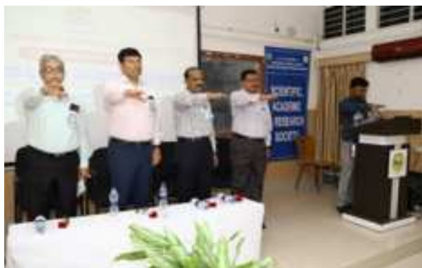
53 rd National Safety Day was observed on March 04, 2024