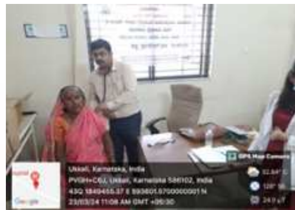
Respiratory Camp was conducted by the Department of Community Medicine in collaboration with Department of TB & CHEST at RHTC Ukkali on March 23, 2024.