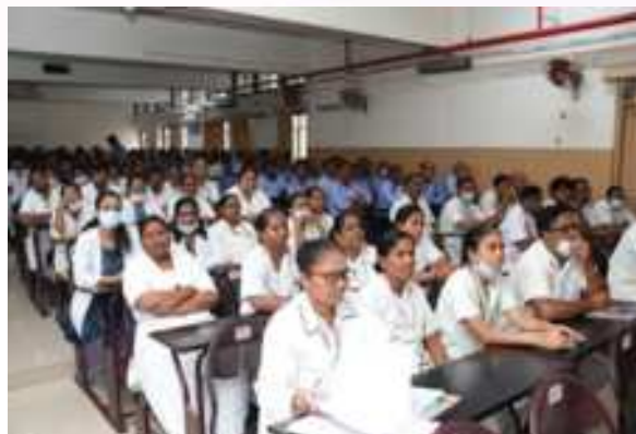
Non-Teaching Staff at Training Session