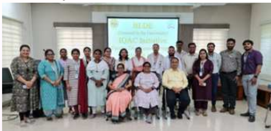
Organizing team & Faculty Members at FDP