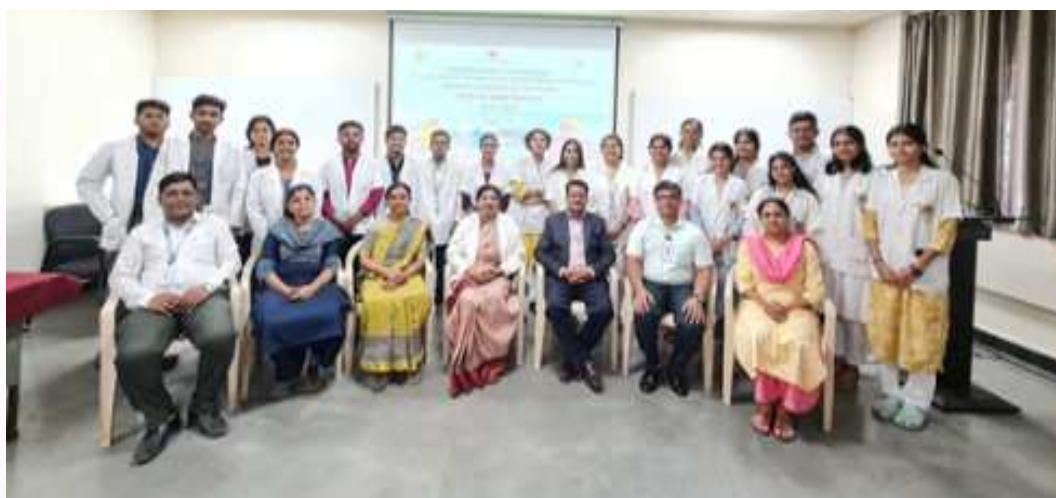
Participants & Faculty Members at Speech Competition