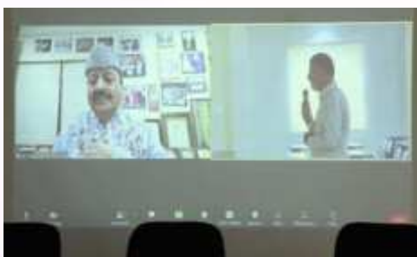
Virtual Interaction session with a Resource Persons by Interns & Faculty Members