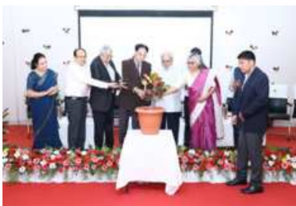
Dignitaries inaugurating the CME