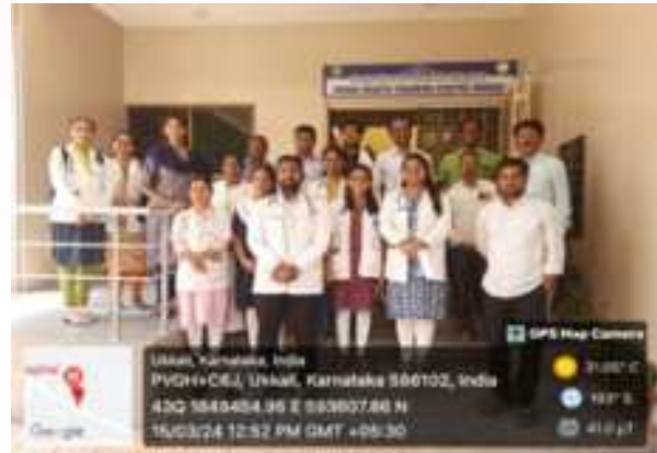
Tubectomy Camp was conducted by the Department of Community Medicine in collaboration with Department of OBG & Dept. of Anesthesiology at RHTC Ukkali on March 15, 2024.