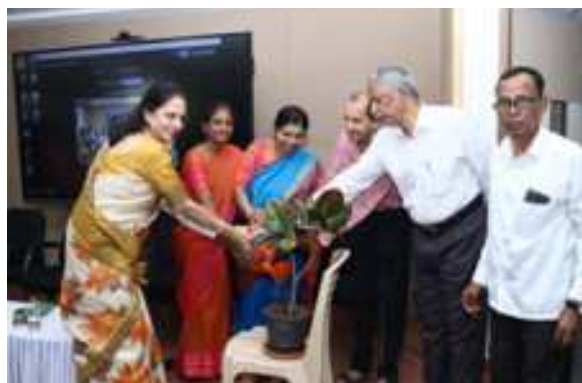
Dignitaries inaugurating the CME