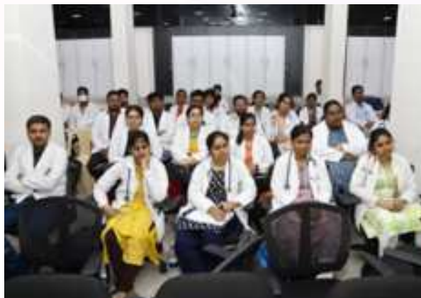
PG's Students at workshop