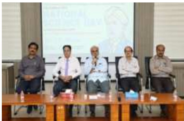
National Science Day was observed on February 28, 2024