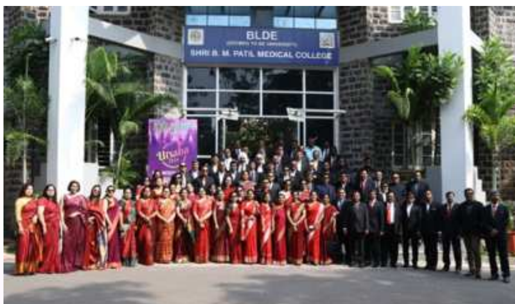
Alumni, 92 MBBS Batch group snap