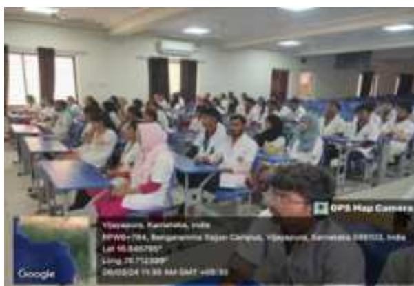
Students at Sensitization Program