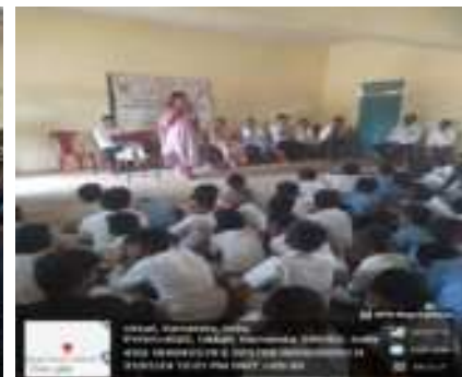
Govt. Kannada Boys Primary School, Ukkali on January 31, 2024