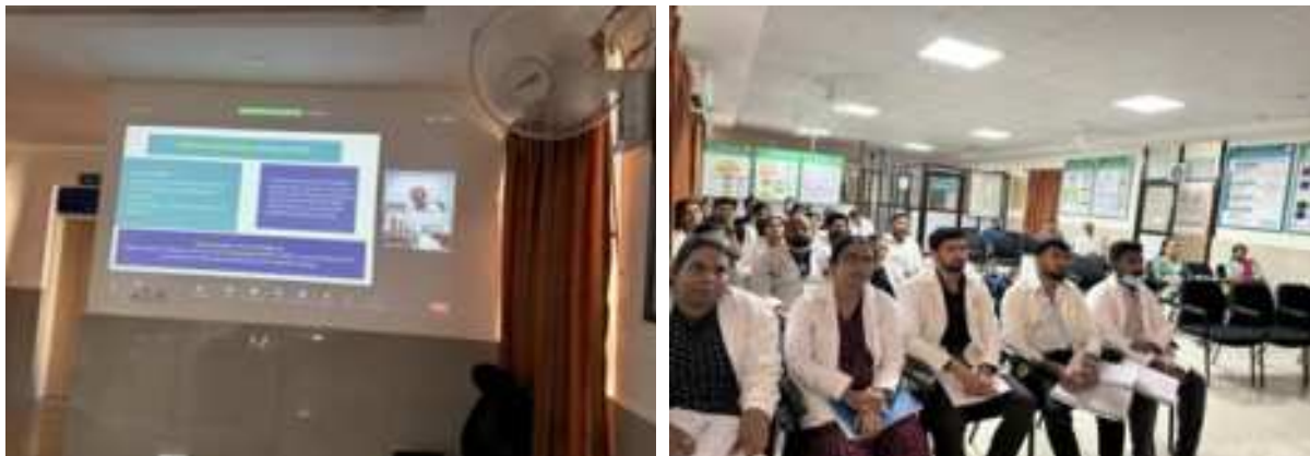
Faculty Members and PG Students at Webinar