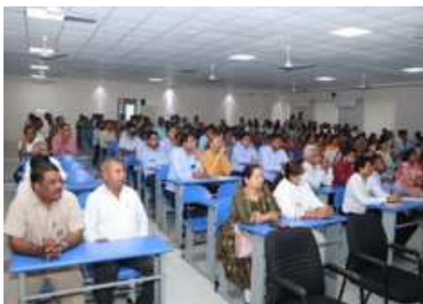
Non-Teaching Staff at Training Session