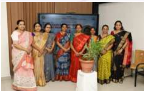
Dignitaries inaugurating the workshop