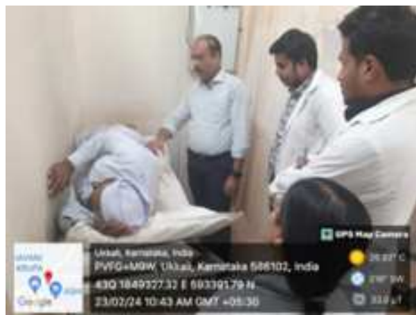
Spine Camp was conducted by the Department of Community Medicine in collaboration with Department of Orthopedics at RHTC Ukkali on February 23, 2024.