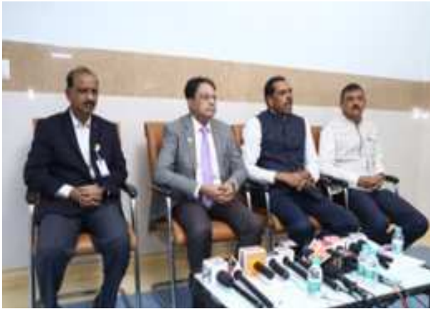
Dignitaries at Press Meet