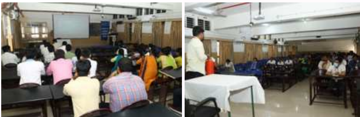
Teaching & Non Teaching Staff at Orientation Programme