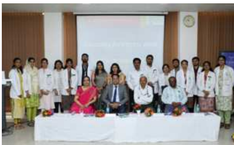
Dignitaries, Faculty Members & PG Students