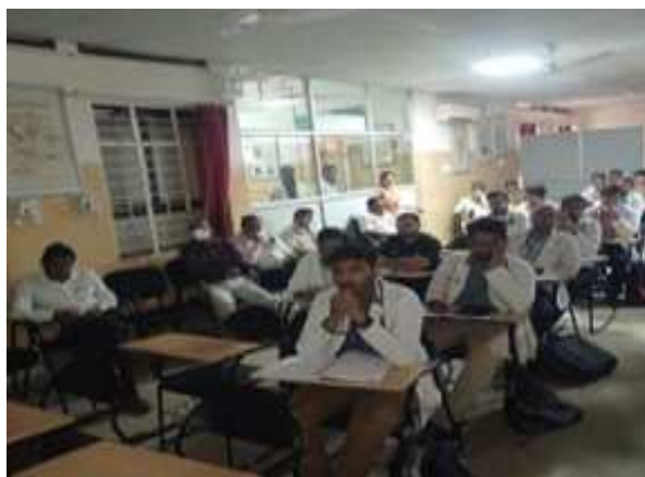
Faculty Members and PG's Students at Symposium