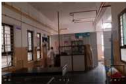
1 st observer informed to the co-staff to announce code red