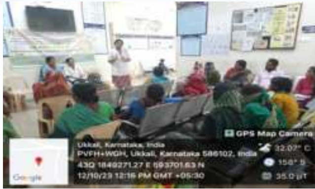
World Mental Health Day observed on October 12, 2023