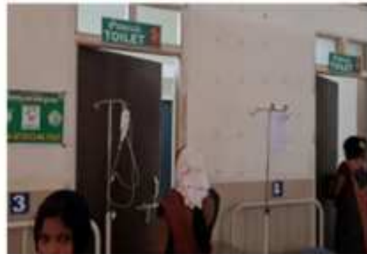
Baby Mother going to bathroom