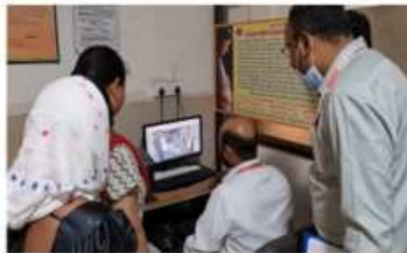
Kidnaper Found in main entrance and security staff finding baby