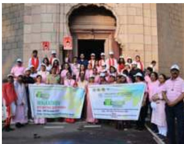
Walkathon on Theme of ' Beti Bachao Beti Padhao ' by Faculties members and Students