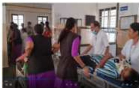
Patient evacuation started