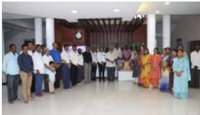
Maharshi Valmiki Jayanthi observed on October 28, 2023 in the University