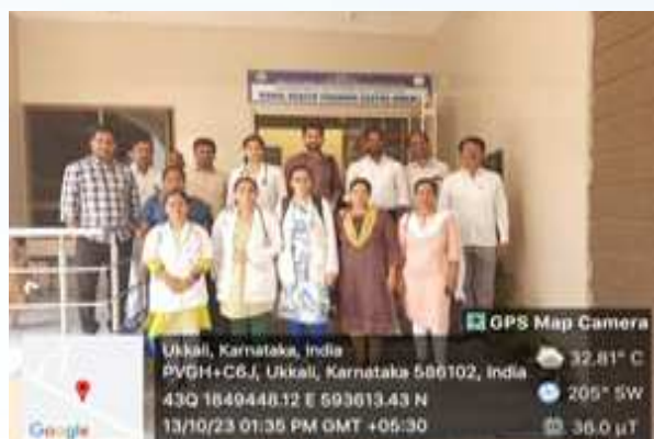
Tubectomy Camp was conducted by the Department of Community Medicine in collaboration with Dept. of OBG & Dept. of Anesthesiology at Rural Ukkali on October 13, 2023.