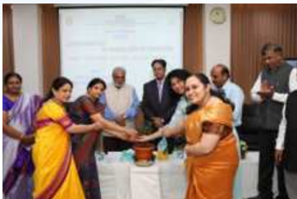
Dignitaries inaugurating the event