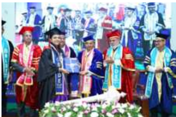
Recipient of the Honoray Doctorate(Honoris Quasa)