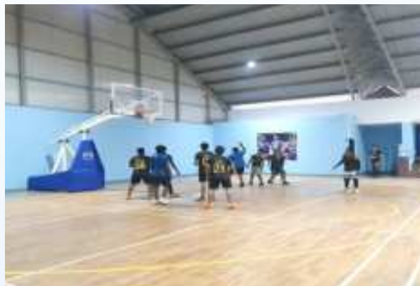
Basket Ball Match