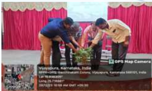
World Disabled Day observed on December 29, 2023