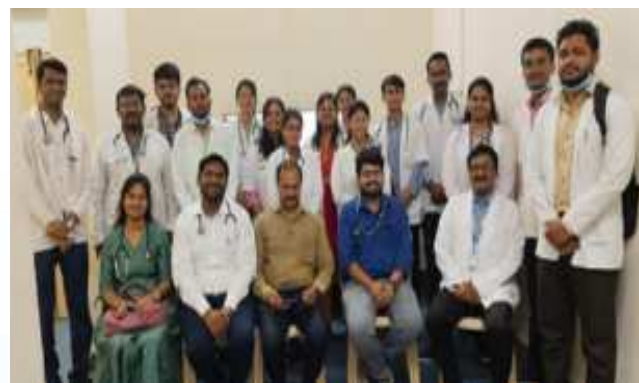
World COPD Day observed on November 23, 2023