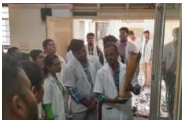
Students at the DDRC and ALC Unit