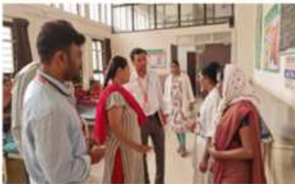
Administration team at labour ward to collecting missing baby details