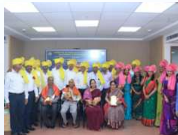
Felicitation to Faculty Members