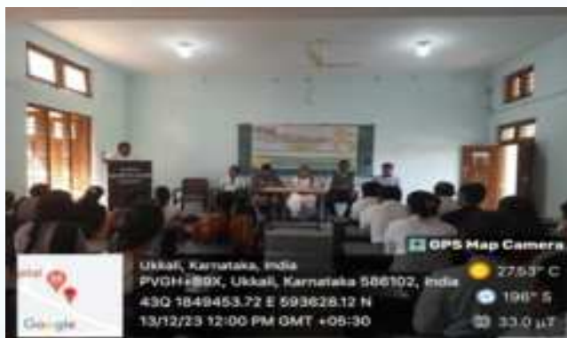
World Aids Day observed on December 13, 2023