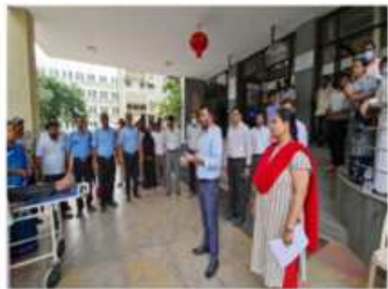
Code Red is Cleared