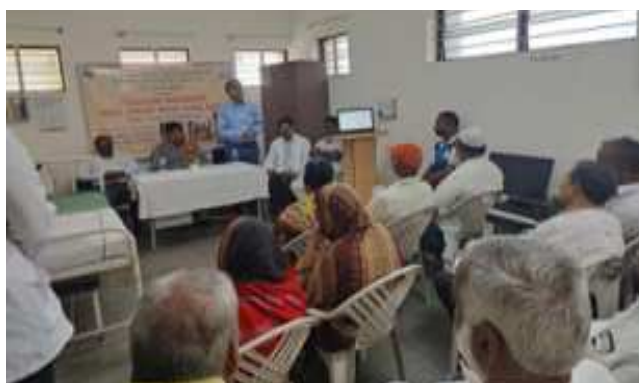
World Diabetes Day observed from November 13-18, 2023