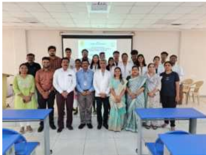
Organizing team, Faculties & Students