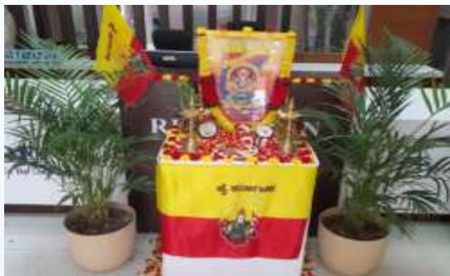
Karnataka Rajyotsava observed on November 01,2023 in the University