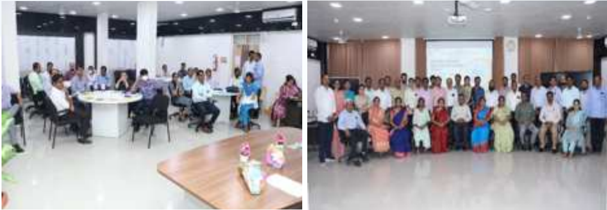
Organizing Team and Participants