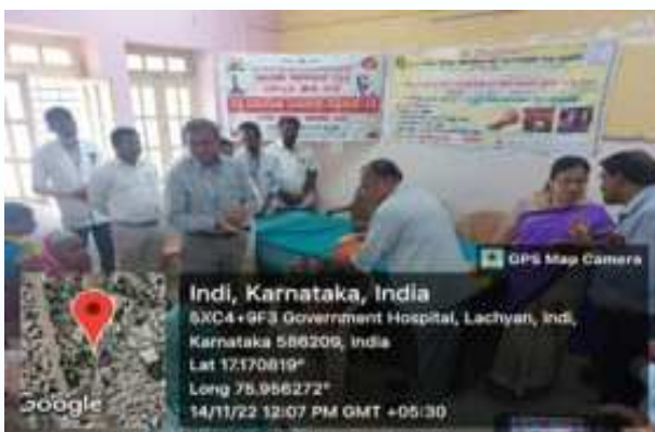
Free Diabetic Foot Campaign Camp was conducted by the Department of Surgery at Taluka Government Hospital, Indi on November 14, 2023.