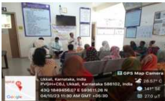
World Rabies Day observed on October 04, 2023