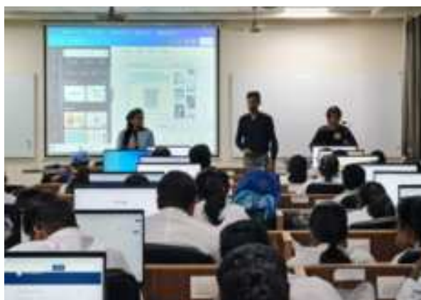
Resource Persons delivering the training programme