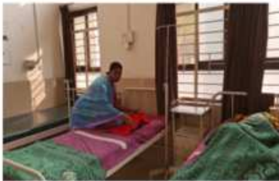
Kidnaper stealing baby from ward