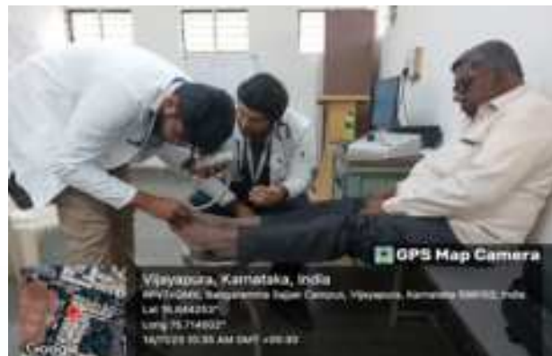
Free Diabetic Foot Campaign Camp was conducted by the Department of Surgery at Hospital on November 14, 2023.