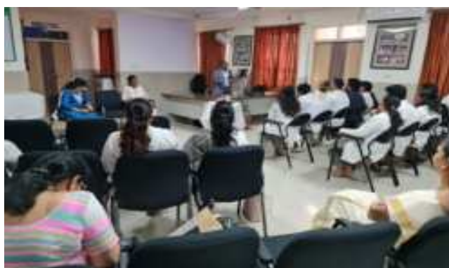
World Anaesthesia Day (Ether Day) observed on October 16, 2023