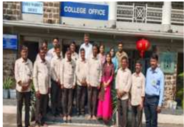
Deepavali observed on November 13, 2023 in the University and College Office