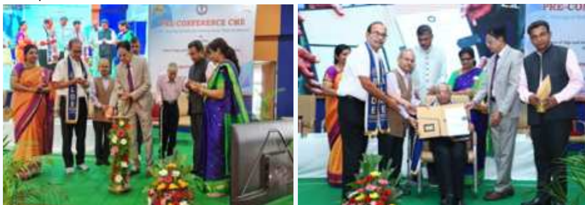
Dignitaries inaugurating the Conference