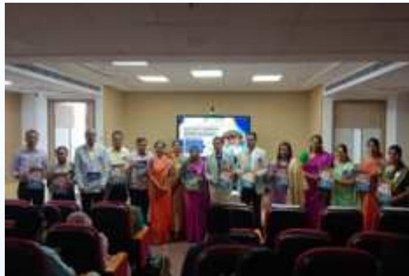
Dignitaries & Faculty Members