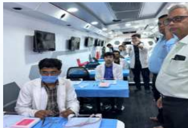
PG's doing Suturing