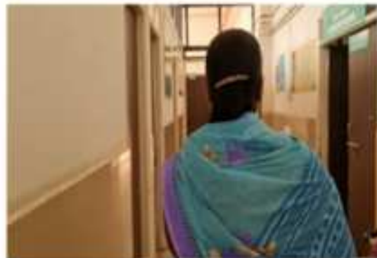
Kidnaper escaping from ward