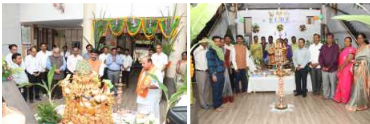
Dignitaries, Faculty Members, Non-teaching Staff and Students in Saraswathi Pooja Programme