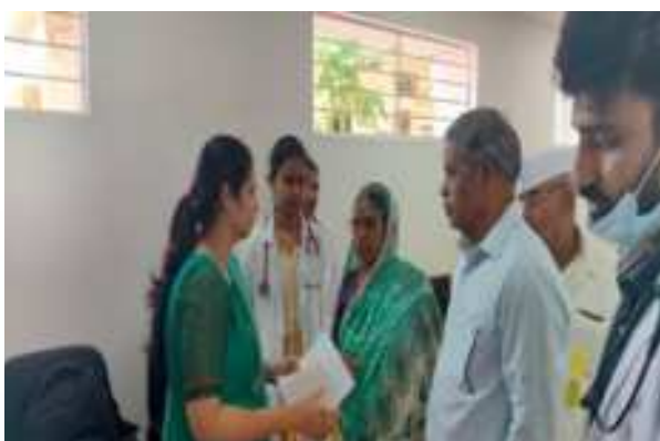
Diabetes Camp was conducted by the Department of General Medicine at General Medicine OPD No 05, Diabetic Clinic on November 22, 2023.