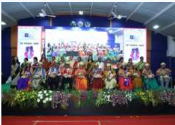
Felicitation to Dignitaries