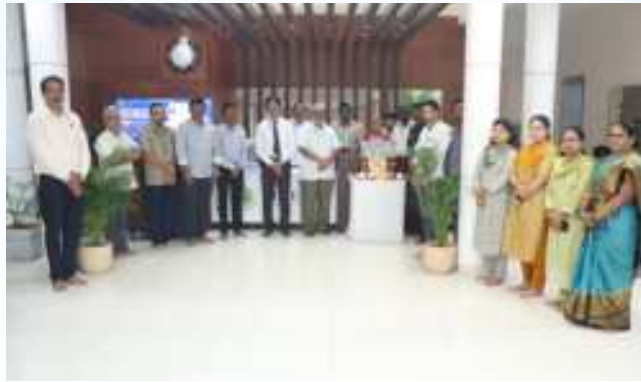
Kanakadasa Jayanthi observed on November 30, 2023 in the University