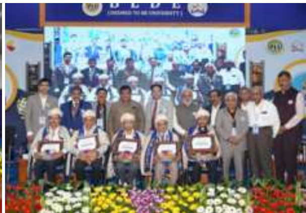
Felicitation to Dignitaries