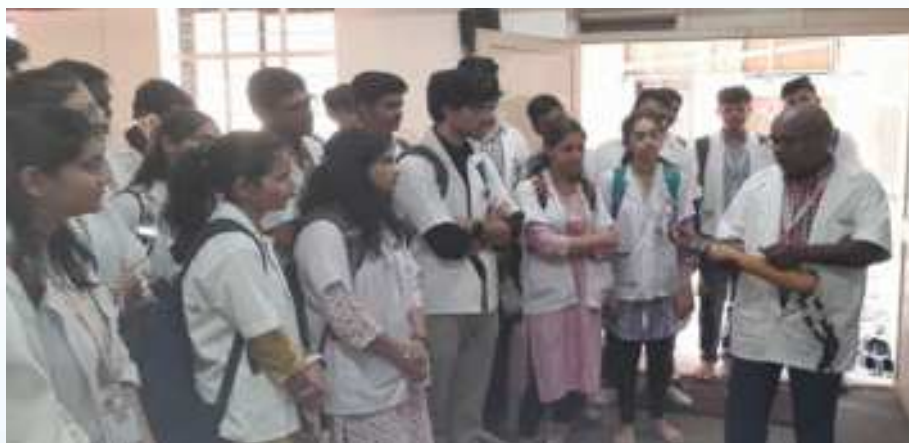
Students at the DDRC and ALC Unit