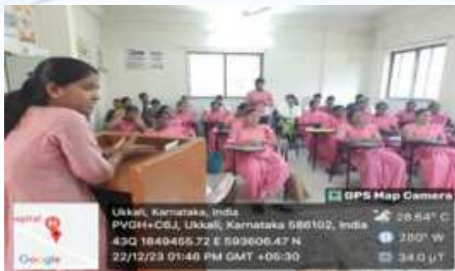
International Year of Millets 2023 was observed on December 22, 2023