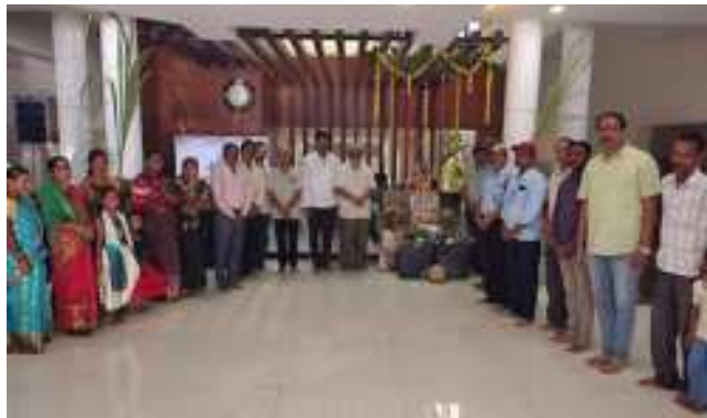
Ayudha pooja observed on October 23, 2023 in the University