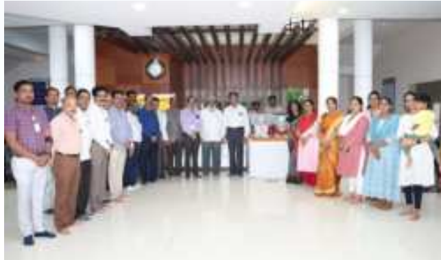
Mahatma Gandhi & Lal Bahadur Shastriji Jayanthi observed on October 02, 2023 in the University