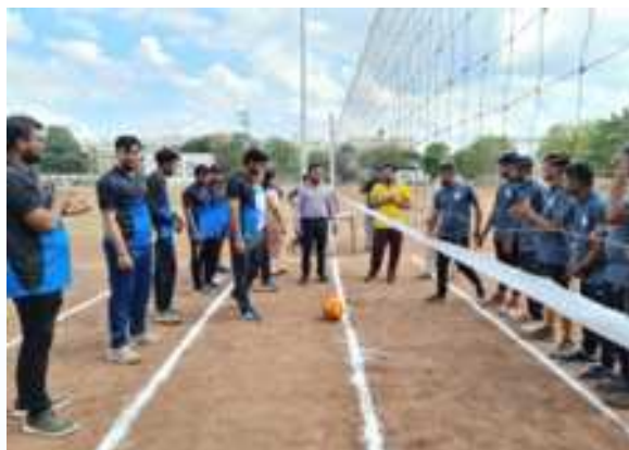
Inter Phase Throw Ball Match