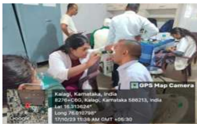
Free Health Checkup Camp was conducted by the Department of ENT at Kalagi on October 17, 2023.