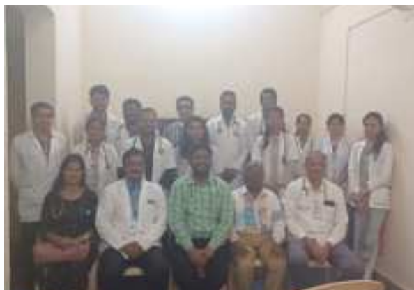
PG's & Faculty Members