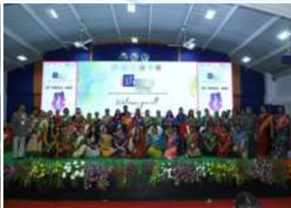
Organizing team, Faculties, and Students at the Conference