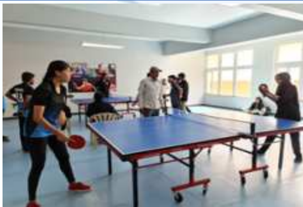
Table Tennis Match