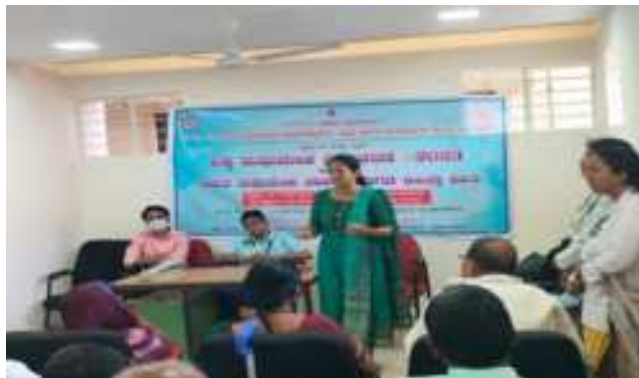
World Diabetes Day observed on November 22, 2023