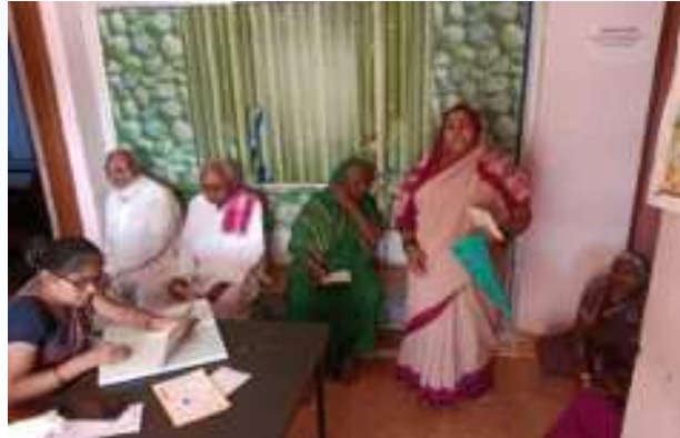
Health Check up Camp was conducted by the Department of Geriatrics Medicine at Arjunagi on December 24, 2023.