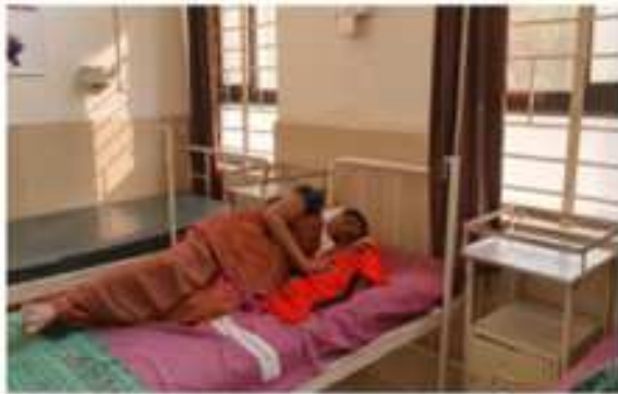
Baby and mother sleeping on bed