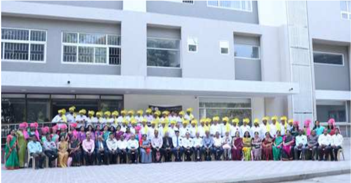
Alumni, 93 MBBS Batch along with Dignitaries in Guruvandana Programme