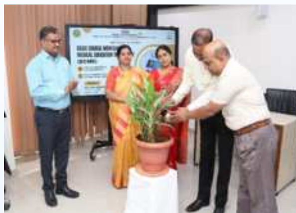
Faculties Inaugurated the workshop