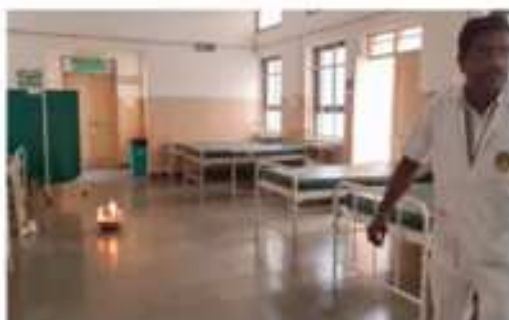
Staff observed the fire