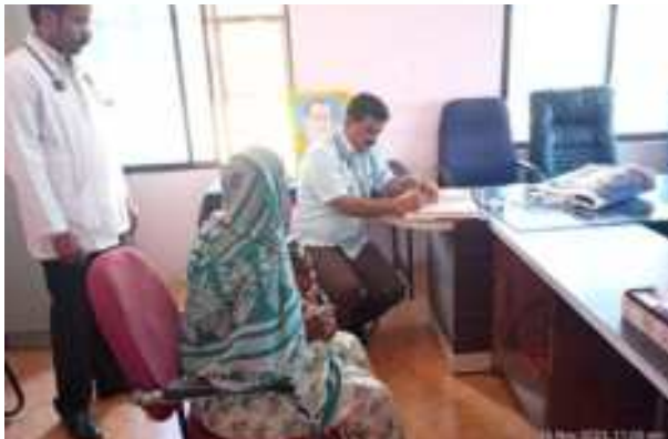
Health Check up Camp was conducted by the Department of Geriatrics Medicine at Arjunagi on November 26, 2023.