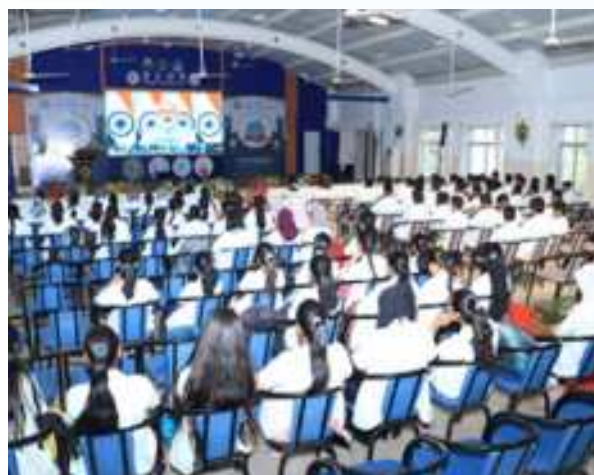
Students and Faculty Members at the live telecast