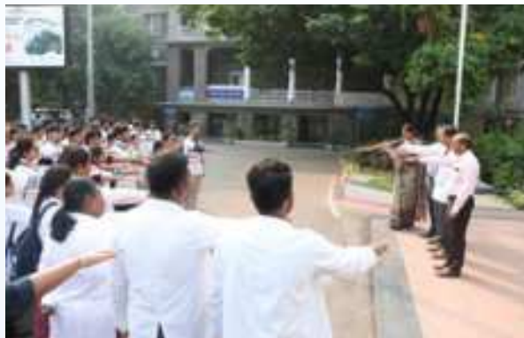
Solemn oath taking by Students