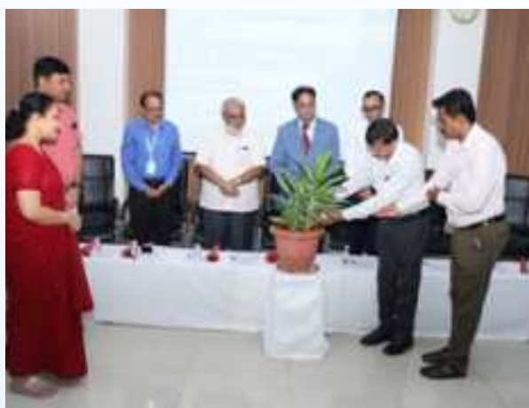
Dignitaries inaugurating the CME