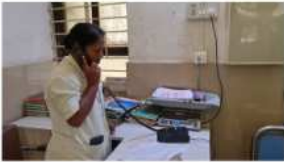
Ward nursing staff announced Code Pink