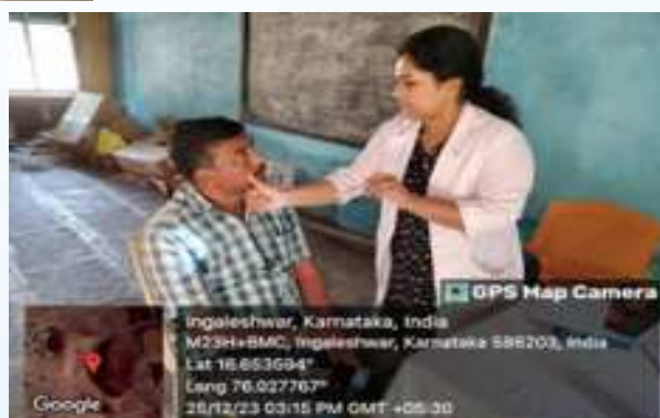
Free Health Checkup Camp was conducted by the Department of ENT at Ingaleshwar on December 25, 2023.