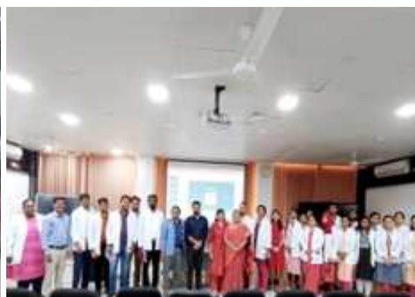
Organizing Team and Participants