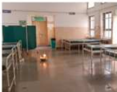
Fire occurred at female surgery ward