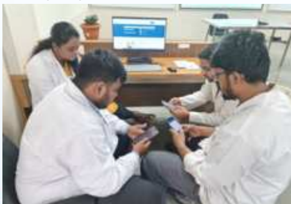
Students & Faculty Members at Training Programme