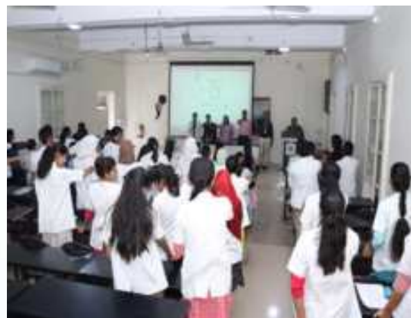
Students and Faculties were participated