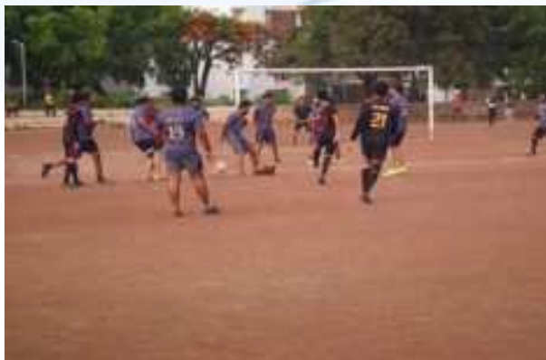
Foot Ball Match