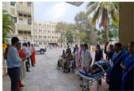
Head count matched & Safety officer explained about the incident and corrective actions