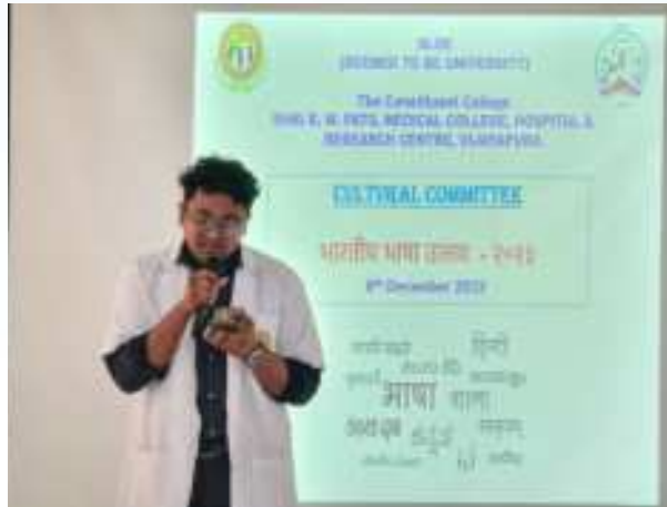
Students performing at event