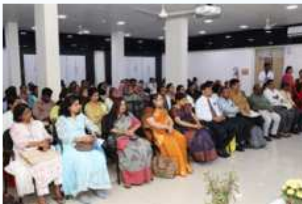
Faculties and PG Students at CME