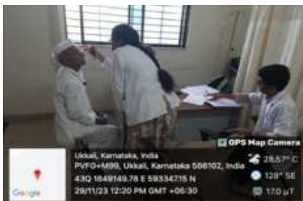
Eye Camp was conducted by the Department of Community Medicine in collaboration with Department of Ophthalmology at RHTC Ukkali on November 29, 2023.