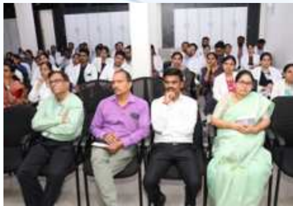
Organizing Team and Participants