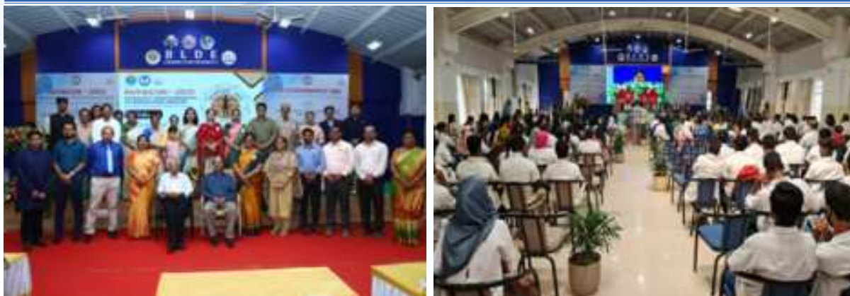
Faculties and PG Students at Conference