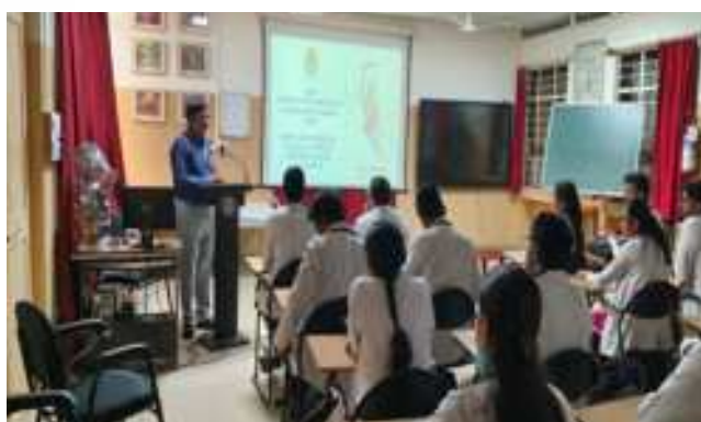
Bhagwan Birsa Munda Birth Anniversary observed on November 15, 2023