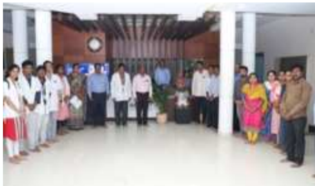
Rashtriya Ekta Diwas observed on October 31, 2023 in the University