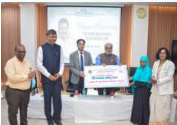
Dignitaries inaugurating the program and distributing the card