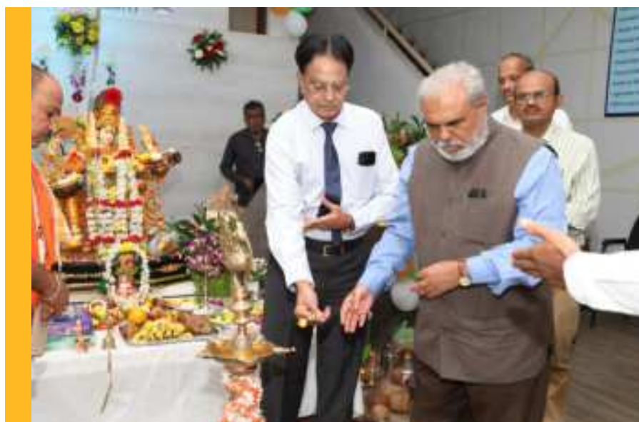
Saraswati Pooja observed on October 21, 2023 in the Central Library