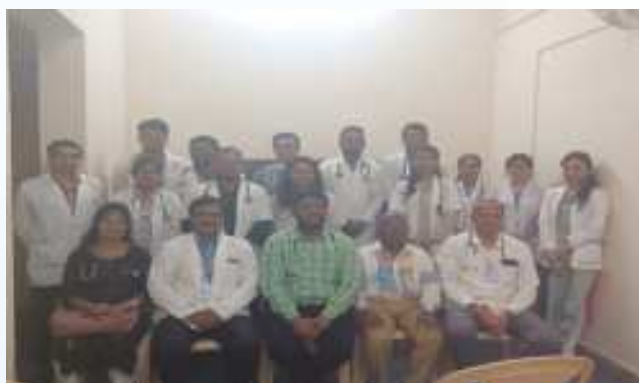
World Pneumonia Day observed on November 11, 2023