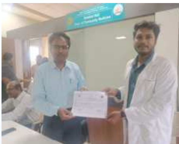
Students receiving Certificates