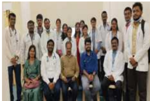
PG's & Faculty Members