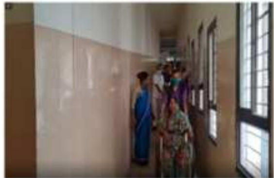
All are assembled in emergency assembly point