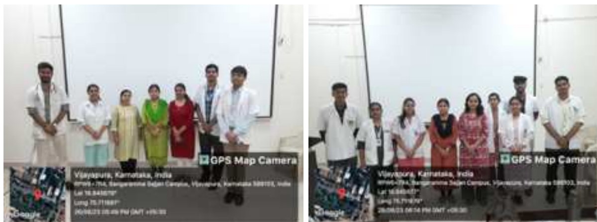
Faculties and Students at literary events