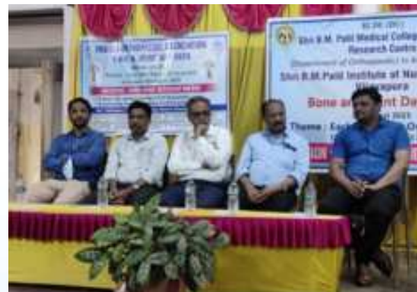
Bone & Joint Day observed from August 1 to 6, 2023