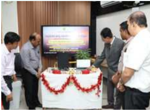
International Deafness Day was observed on September 19, 2023