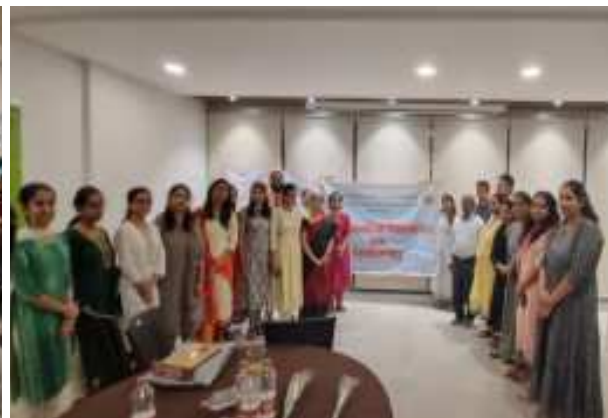
Dignitaries, Faculty Members and Students at CME