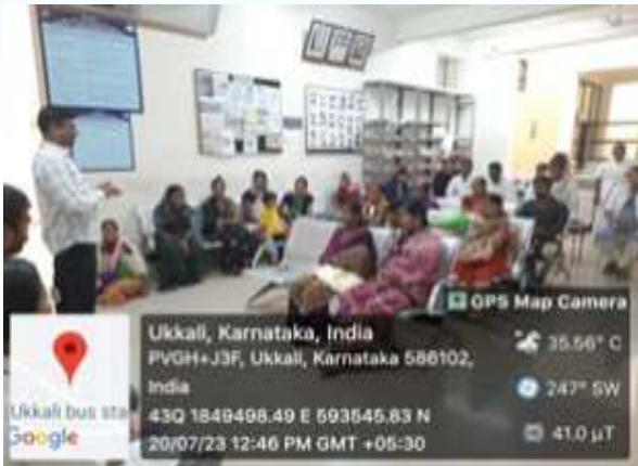
World Population Day observed on July 20, 2023