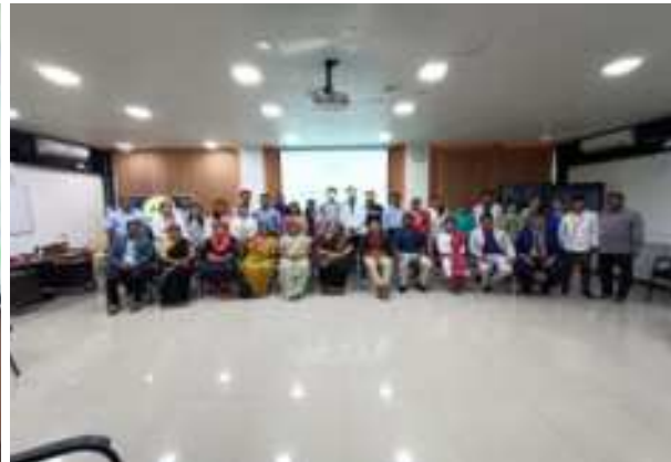
Faculties, Dignitaries and Students