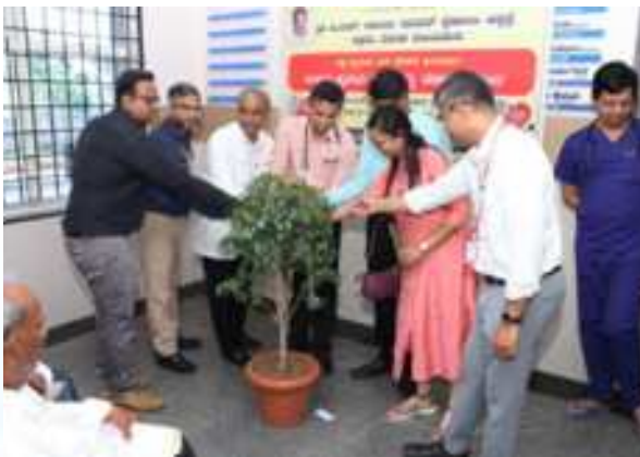
World Heart Day observed on September 29, 2023