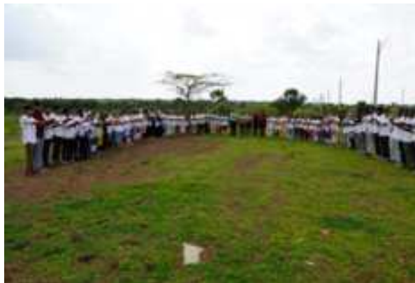
Students and faculty Members pledging with soil