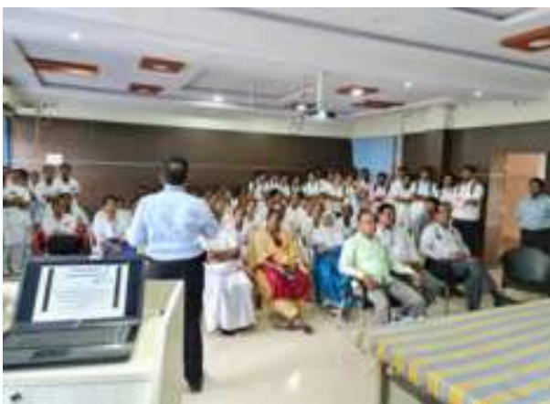
Sensitization of Health Care professional at District Hospital, Vijayapura