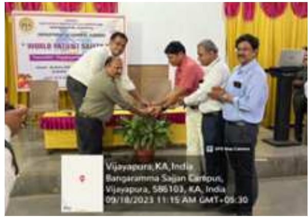
World Patient Safety Day Observed on September 18, 2023