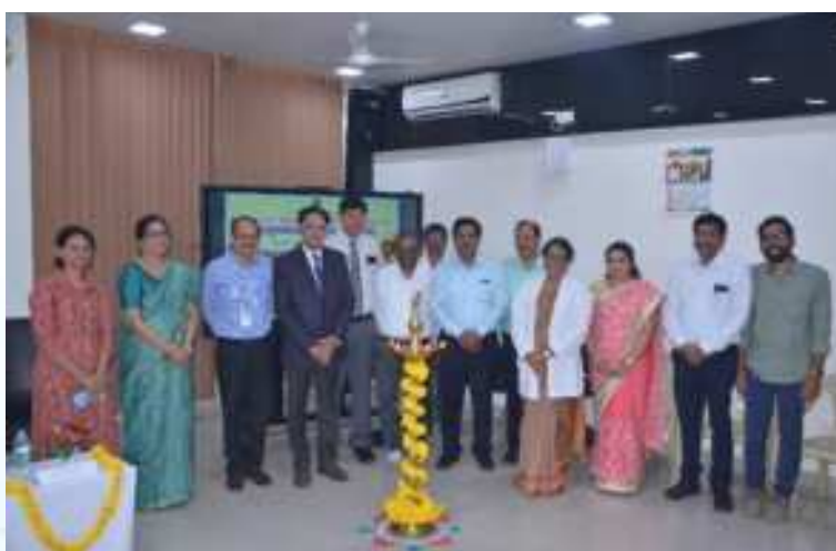
Inauguration by Dignitaries & Faculty Members