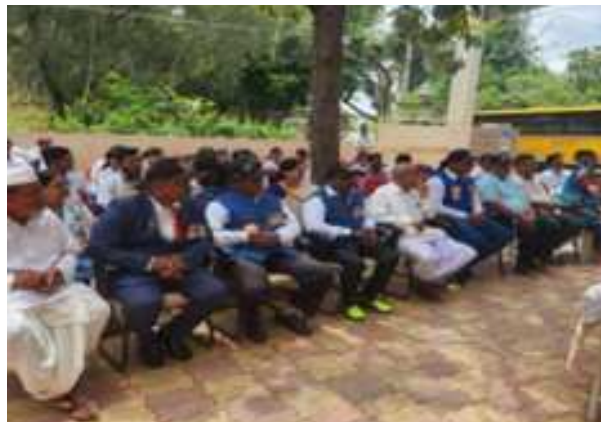
Inauguration by the Dignitaries, Ex-Servicemen