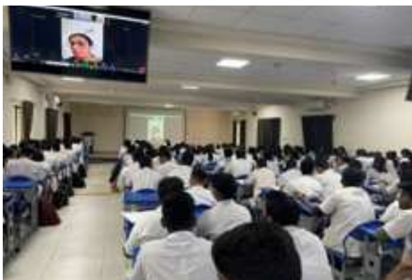
Students and faculty Members at the live telecast of Akhil Bharatiya Shiksha Sangam