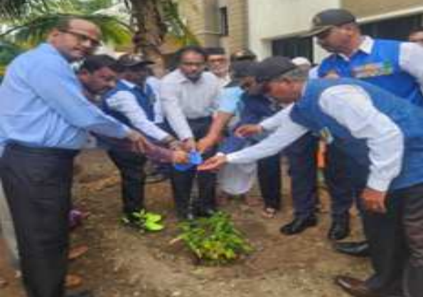
Plantation of Saplings by Dignitaries & Ex-Servicemen