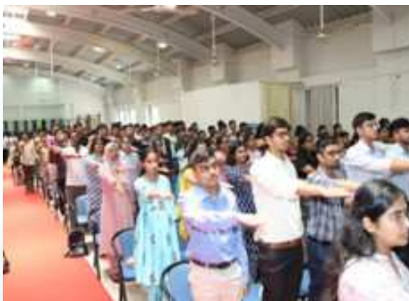
Charaka Samhita Oath taking by Students