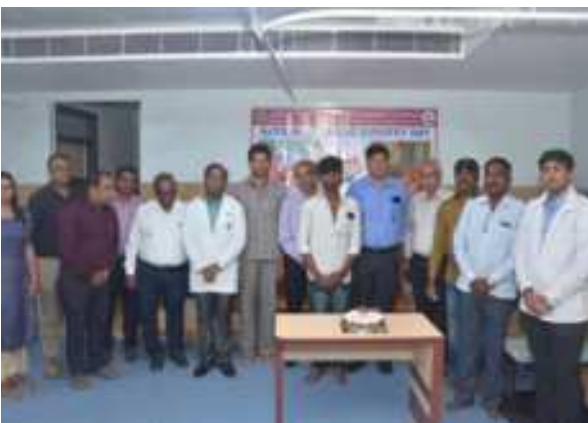
National Plastic Surgery Day observed on July 15, 2023