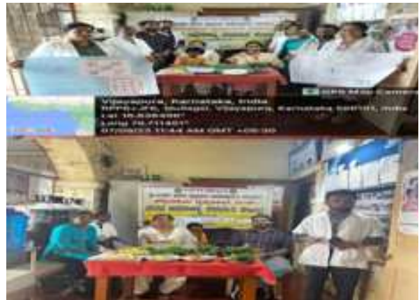
National Nutritional Week observed on September 07, 2023