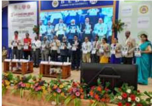
Dignitaries inaugurating the event