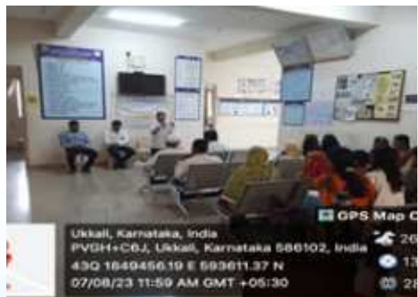
World Hepatitis Day observed on August 07, 2023