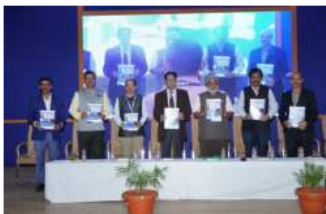
Dignitaries Release the Library Newsletter LIB-INSIGHT