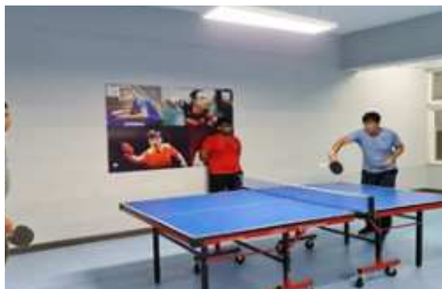
Teaching Staff at Table Tennis.