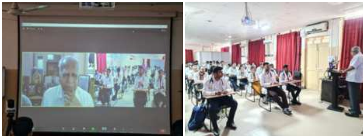
Faculty Members and PG Students at Webinar