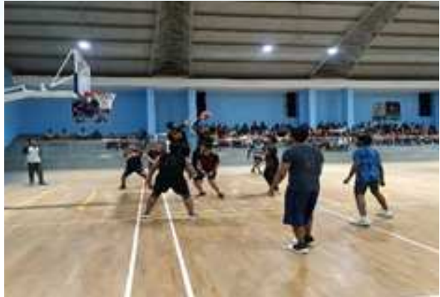
UG & PG Students Inter Phase, kho kho and Basket ball