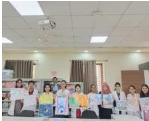
Faculties and Students at Competition