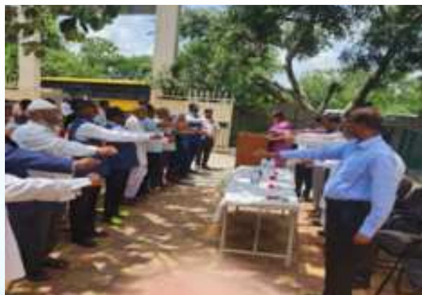
Panch Pran Pledge by the dignitaries, Ex-servicemen & Participates