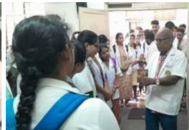
Students at the DDRC Unit

The Students of the Department of Community Medicine Visited at DDRC, Shri B. M. Patil Medical College, Hospital & Research Centre, Vijayapura on September 21, 2023.