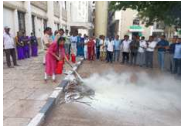
One day Basic Fire Fighting Training program Conducted by Karnataka State Fire & Emergency Services, Department of Govt of Karnataka on August 11, 2023.