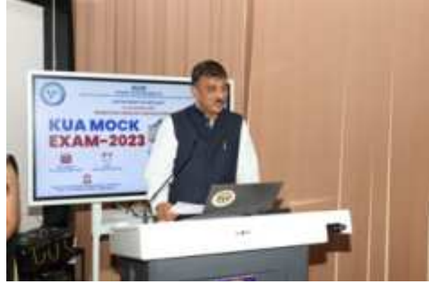
Inauguration by Dignitaries