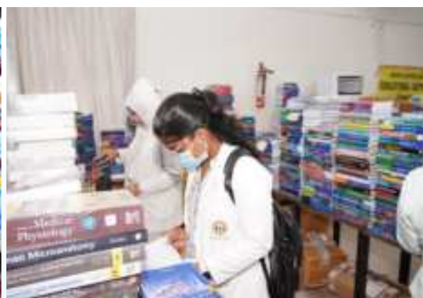
Students at Books Exhibition