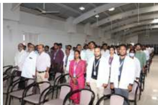
National Anthem honored by Dignitaries and Students