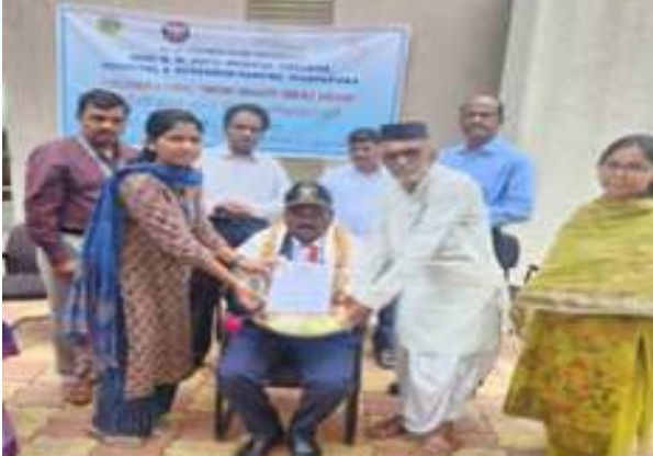
Felicitation to Ex-Servicemen