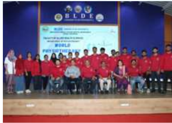
World Physiotherapy Day was observed on September 08, 2023