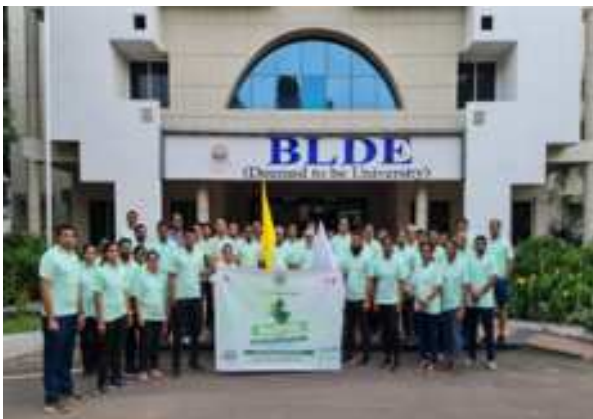
Dignitaries, Faculties & Students at Walkathon