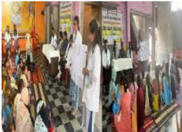
World Breastfeeding Week observed on August 07, 2023