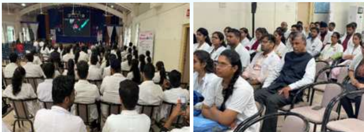
Students at Live Streaming at Library Auditorium