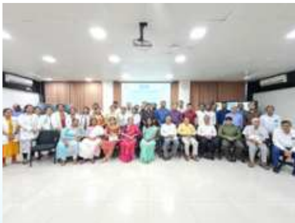
Dignitaries inaugurating the event