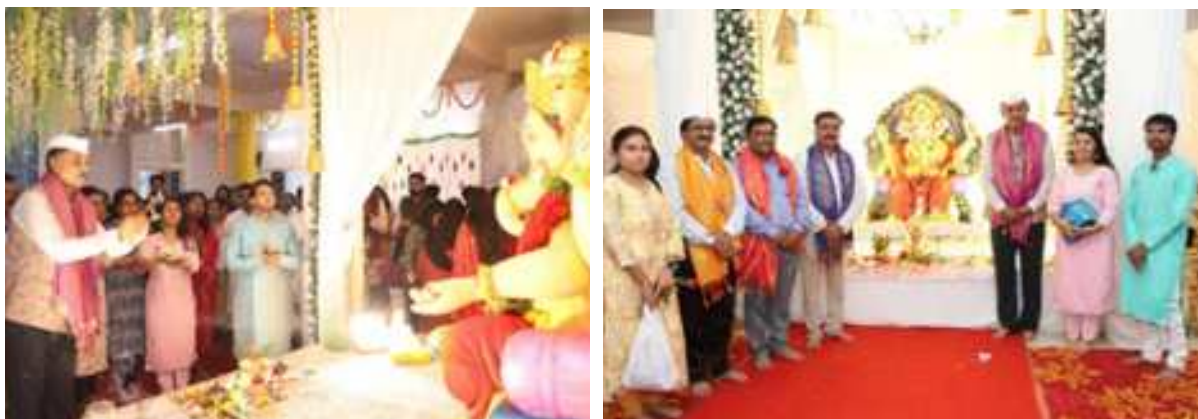
Dignitaries, Faculty Members and Students offering the pooja to Lord Ganesh