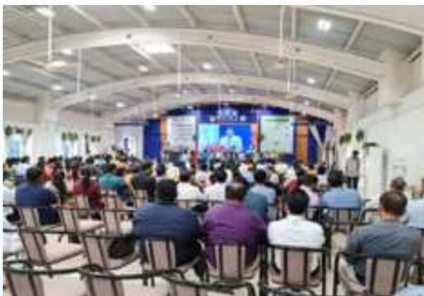
Faculties and Students at Conference