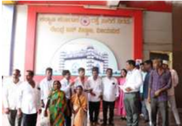
Sensitization of general public in Central Bus Station, Vijayapura