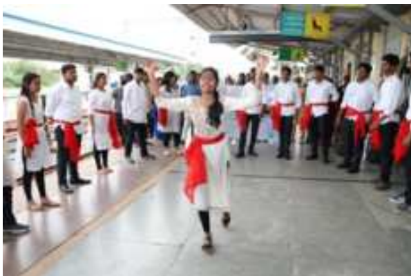
Street Play in Vijayapura Railway Station by Students