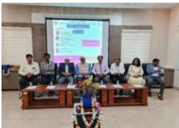
Dignitaries at the event

The workshop aimed to provide participants with insights into the cutting-edge field of stem cell research, its applications, and the associated intellectual property rights (IPR) landscape