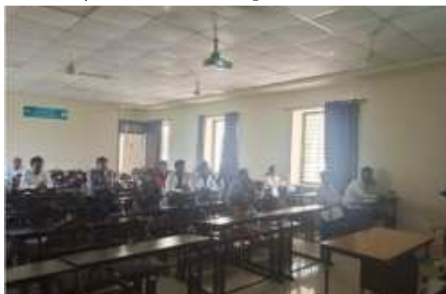
Faculty Members and PG Students at Semiar