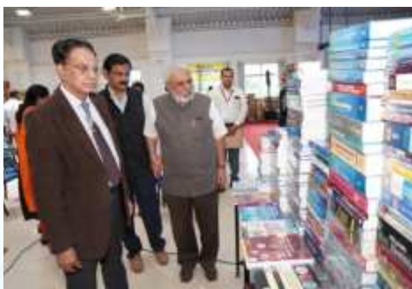
Dignitaries at Books Exhibition