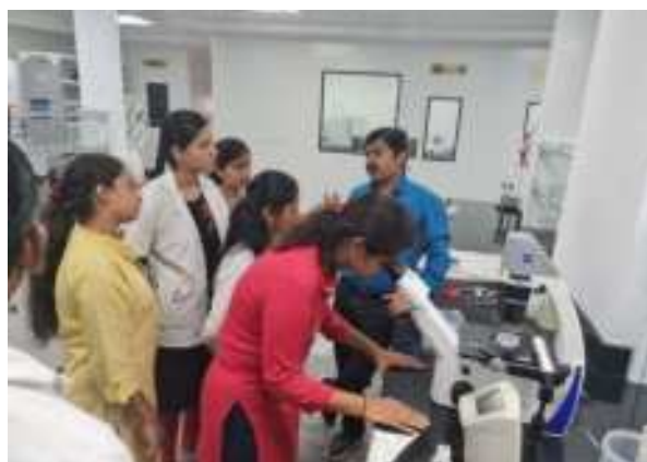
Hand's on training session