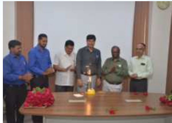
Doctors Day observed on July 01, 2023