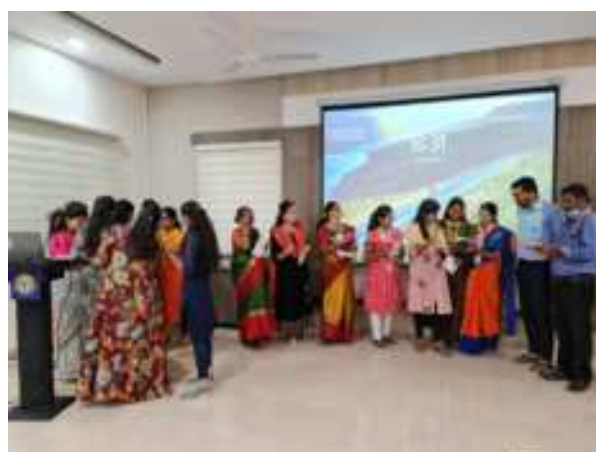
Non Teaching staff participating in the Activities