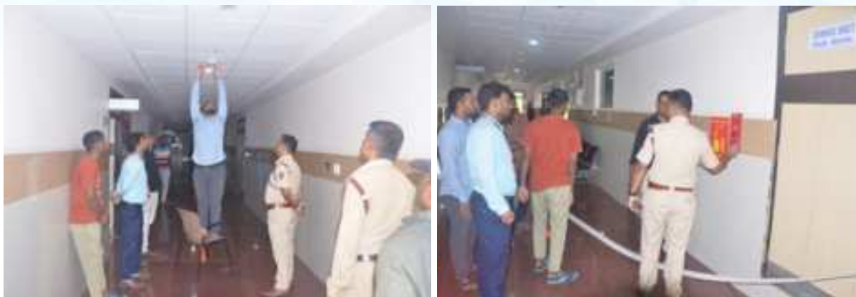
One day Basic Fire Fighting Training program Conducted by Karnataka State Fire & Emergency Services, Department of Govt of Karnataka on July 22, 2023 at Shri. B. M. Patil Super Speciality Hospital.