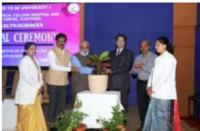
Inauguration by Dignitaries