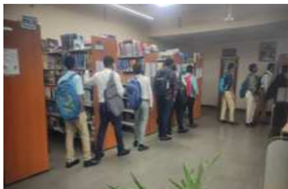
Students at Central Library