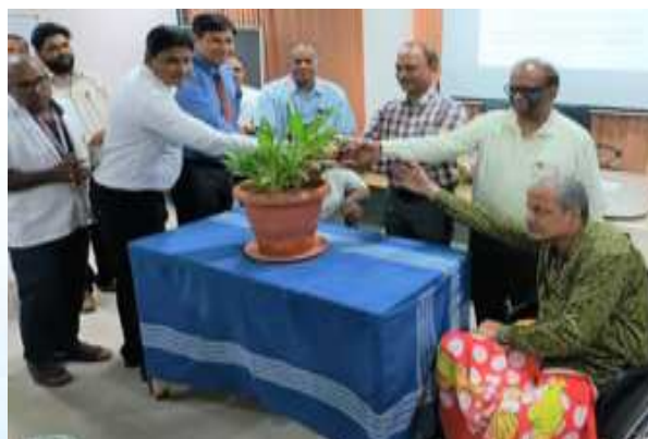
Dignitaries inaugurating the camp