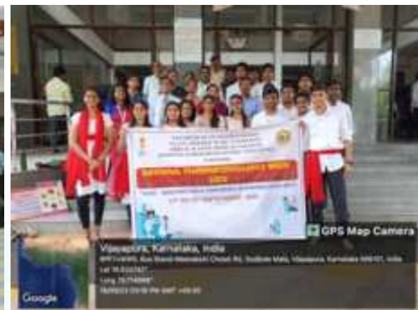
Street Play in BLDE Hospital Vijayapura by Students