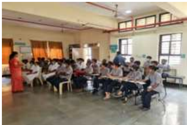
Sensitization of BLDE Nursing Staff