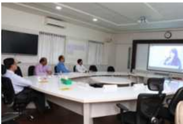
Vice Chancellor and Registrar at the live telecast