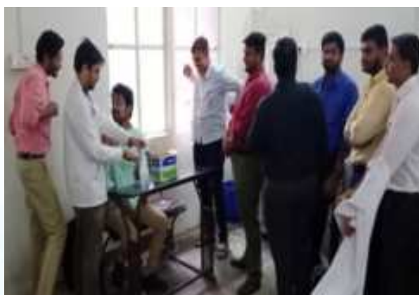
Students getting Hepatitis B Vaccination