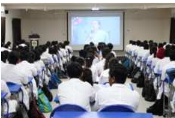
Students and faculty Members at the live telecast