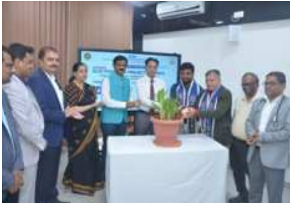
Dignitaries inaugurating the event