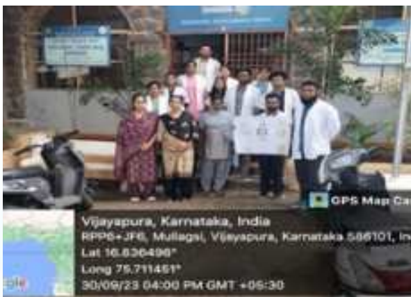
World Rabies Day observed on September 30, 2023