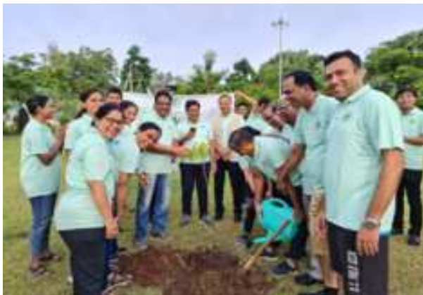
Dignitaries, Faculties & Students at Plantation