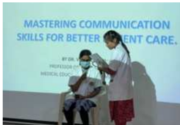
Students at Activities