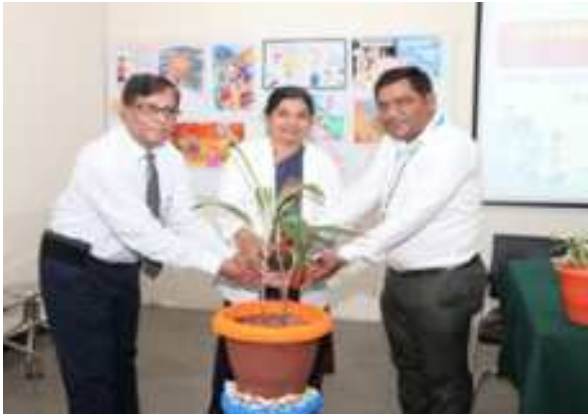
Inauguration of Event

Adverse Drug Monitoring Centre(AMC) and Department of Pharmacology of BLDE(Deemed to be University)'s Shri B. M. Patil Medical College Hospital & Research Centre, Vijayapura celebrated National Pharmacovigilance week from September 17 to 23, 2023. A series of activities were organized on the theme “ Boosting the public Confidence in Pharmacovigilance”