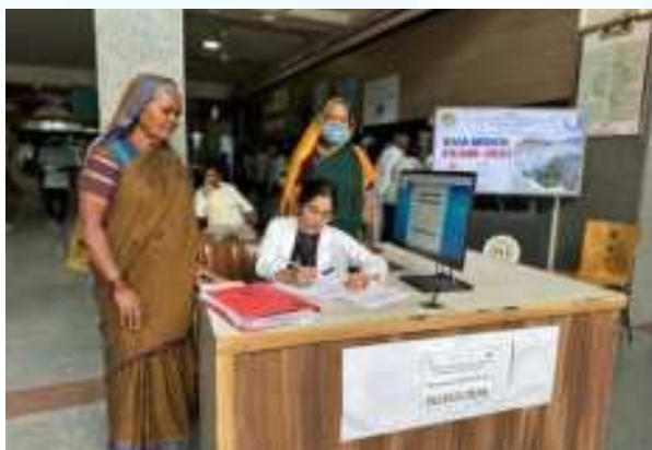
A Pledge Desk arranged at Hospital lobby