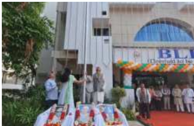
The 77 th Independence Day was celebrated on August 15, 2023