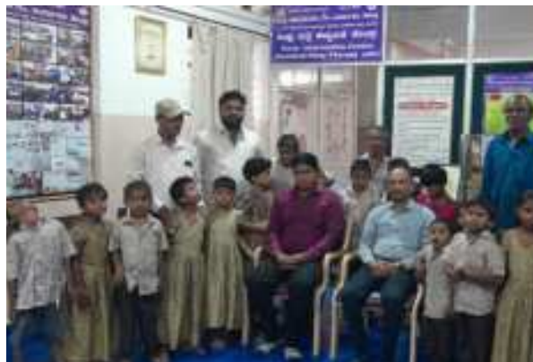
DDRC Technical Staff and Supporting Staff conducting the camp