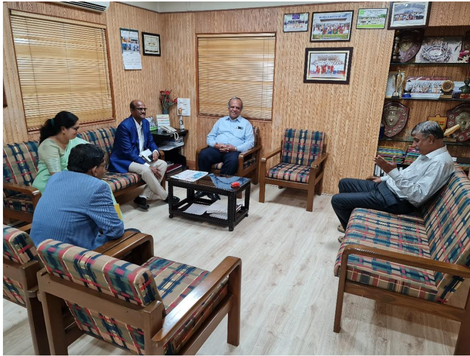
Interaction with Dean Faculty of Medicine & Principal