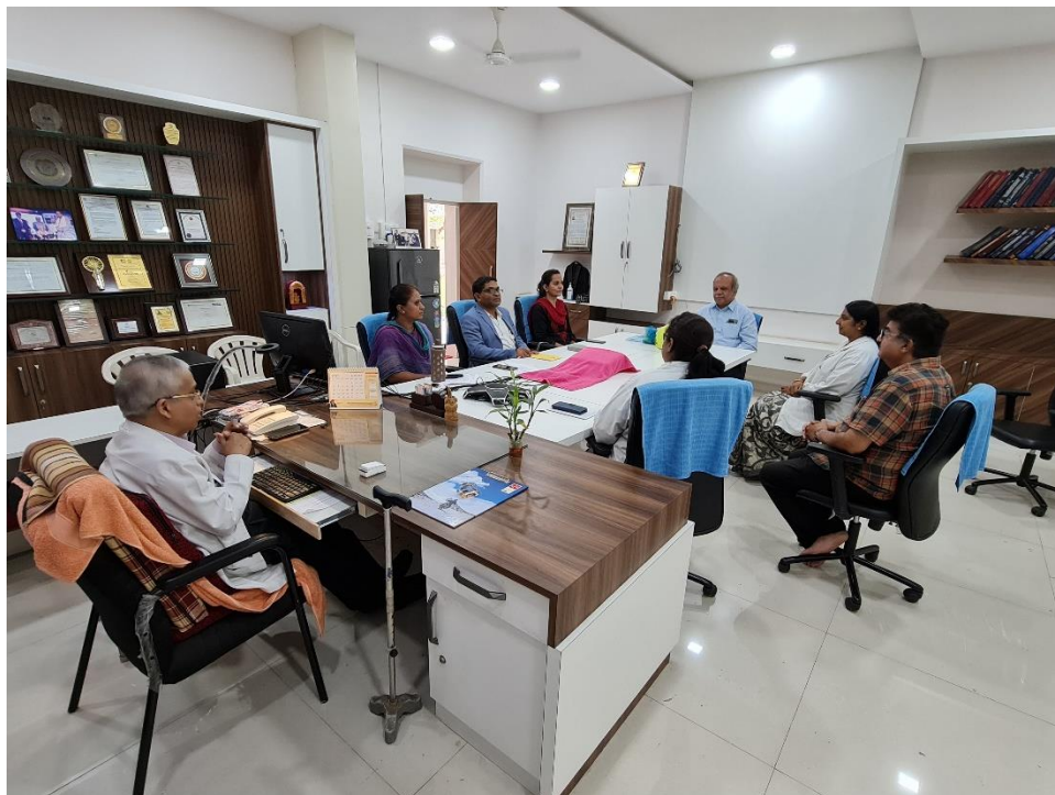
Interaction with Physiology Department