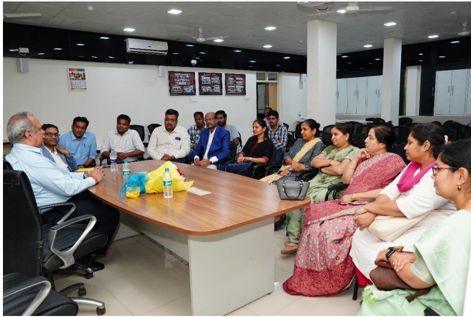
Interaction with Research Unit Team