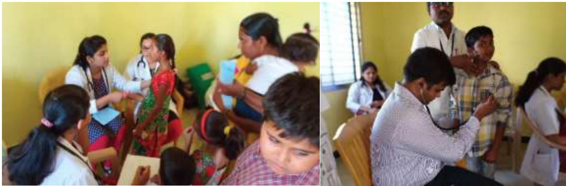
General Health Checkup Camp was conducted by the Department of Pediatrics at Sevalal LT, Vijayapura on September 23, 2018.