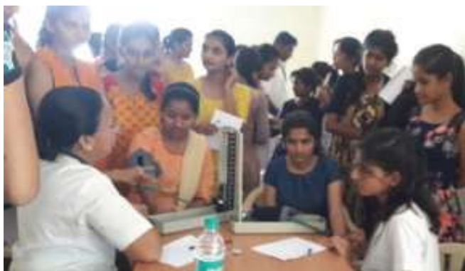
General Health Checkup Camp was conducted by the Department of Medicine at Dr. PG Halakatti College of Engineering & Technology, Vijayapura on August 30, 2018.