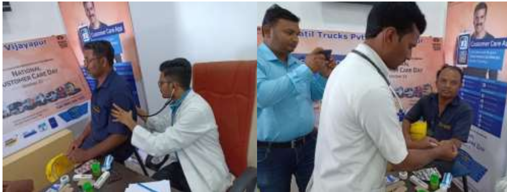
Tata Motors Patil Trucks employees Health Check Up, at Vijayapura 23 October 2018

Non-Communicable Disease (NCD) screening camp and Dental check-up camp was conducted by the Department of Community Medicine in coordination with Gram Panchayat at Yembhtnal Village on October 05, and November 24, 2018.