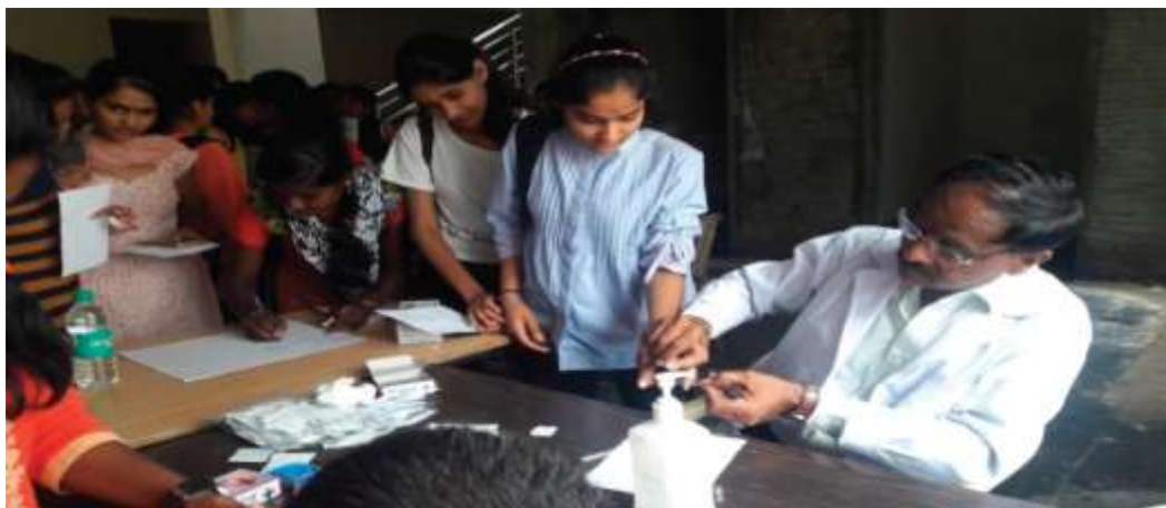
General Health Checkup Camp was conducted by the Pre-Clinical Departments at Dr. PG Halakatti College of Engineering & Technology, Vijayapura on August 30, 2018.