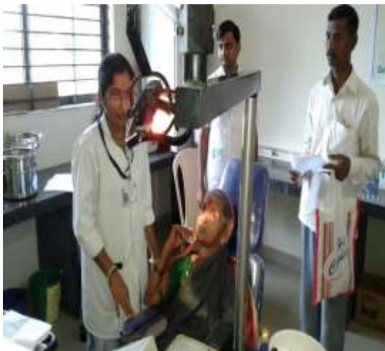
Dental health Check Up Camp was organized at Dept Of Dentistry on 1st August 2018 followed by awareness talk on Orla health by the faculty