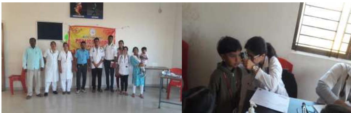
Students Health Checkup Camp at BLDEA's, Public School, Jamkhandi, On 9/2/2019