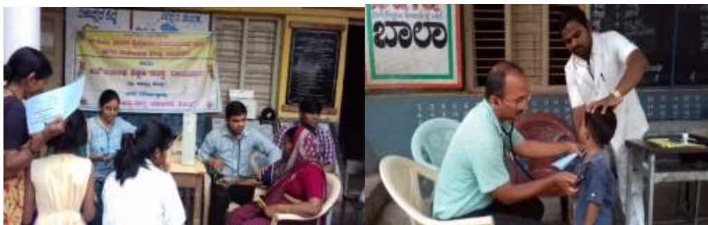
General Health Check Up Camp At Rambapur on 18 th August 2018