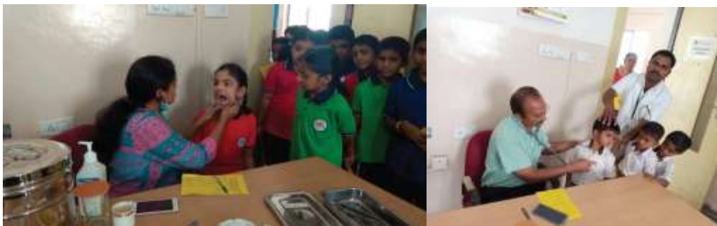
Dental Health Checkup Camp was conducted by the Department of Dentistry at Shri B. M. Patil Public School, Vijayapura from August 29 to 31, 2018.