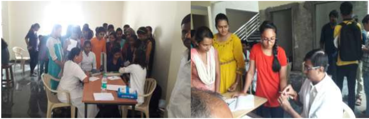
Health Checkup Camp was conducted by the Department of Ophthalmology, at Barkothadi Tanda, on September 23, 2018.