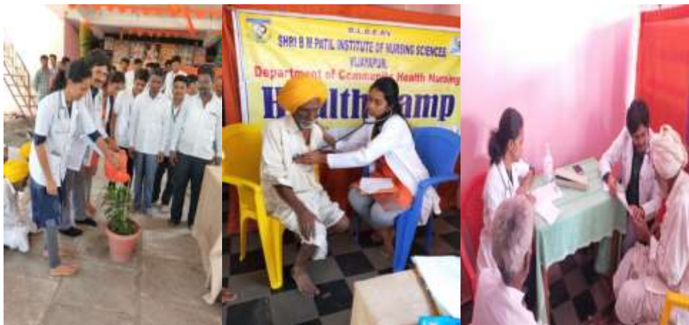
General Health Check Up Camp At Nidoni in collaboration with Nursing college, on 30/10/2018