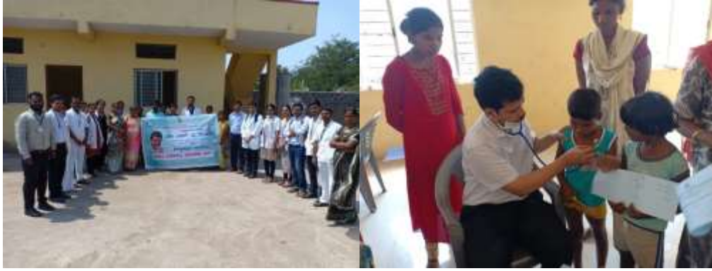
General Health Check Up Camp at Ranibagicha 7 th October 2018