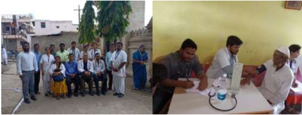
General Health Check Up Camp At Takkalki, Tq:B.Bagewadi. On 6/11/2018