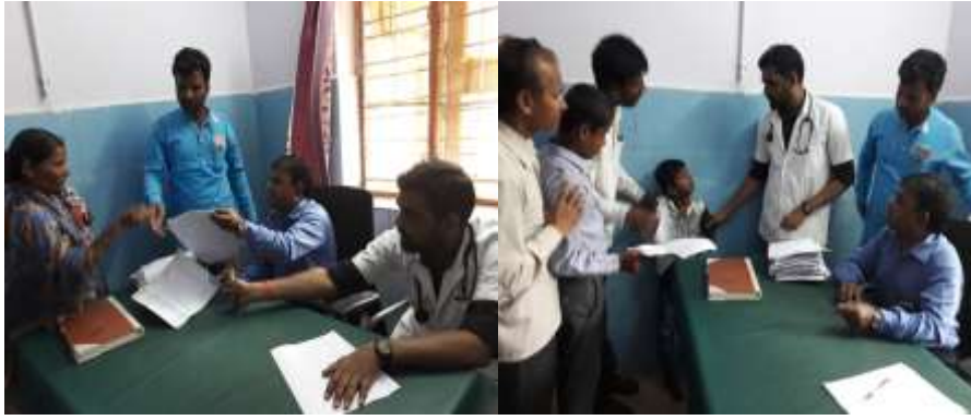
Health Check-up camp at Taluka Hospital Indi on 10th July 2018 by District Disability Rehabilitation Centre