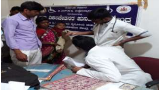
Health Check-up camp was organized at HPS School Arjunagi, Vijayapura on 15th April 2019 by District Disability Rehabilitation Centre