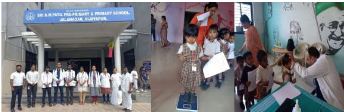
Students Health Checkup Camp at BLDEA's, Shri B M Patil Pre-Primary & Primary School Jalanagar, Vijayapura, On 6/2/2019