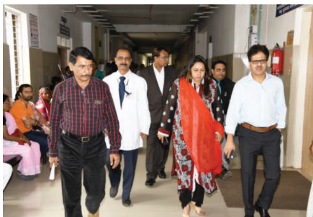
UGC Expert Committee at PICU. The Committee visited various Departments and facilities of Hospital