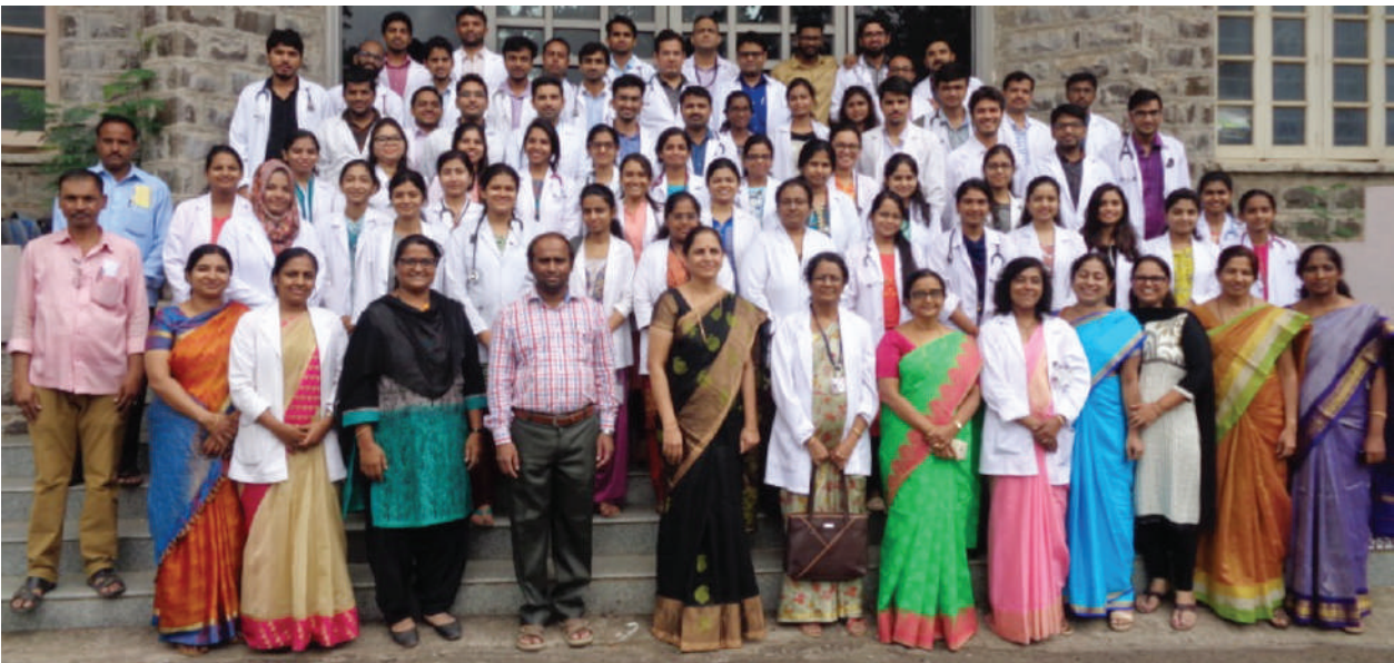
Faculty Members with 1st Year PG Students