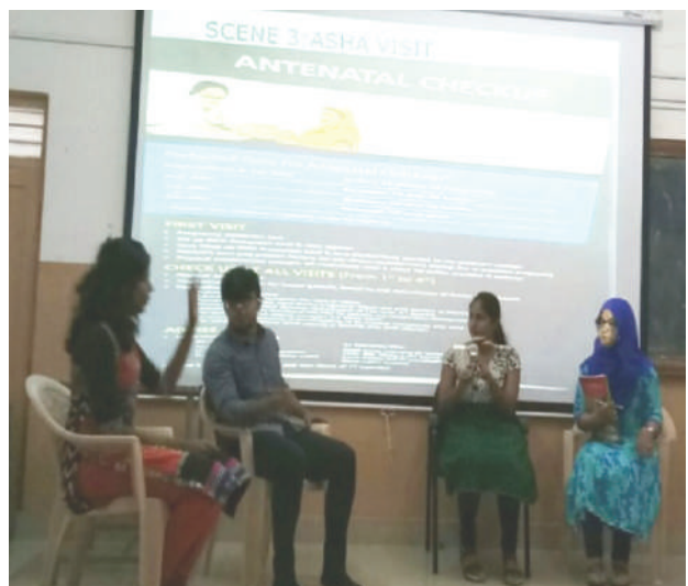
Role-Playing by 6th Term MBBS Students