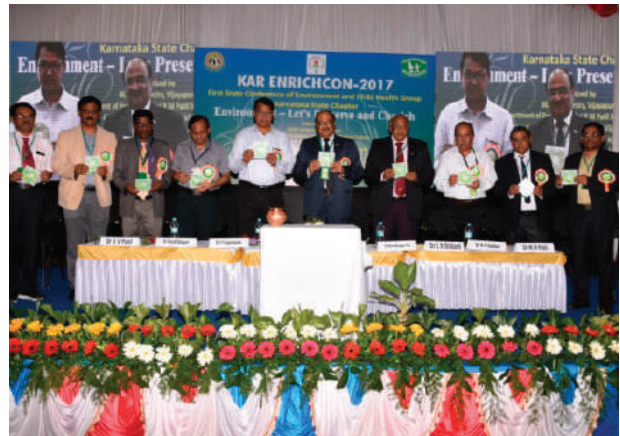
Release of conference souvenir by the dignitaries