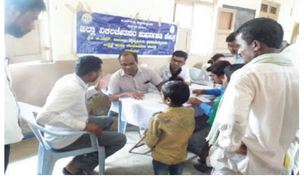
Assessment Camp conducted at Marathi Vidyalaya, Vijayapura from 10 th to 12 th July, 2017.