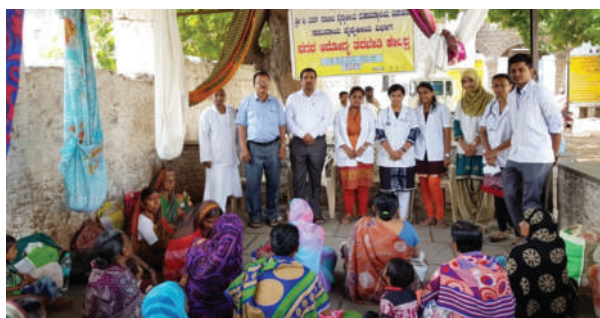
On the occasion of "World Breast Feeding Week" Health Education was organized on August 7, 2017 at UHTC Chandabowdi, Vijayapura.