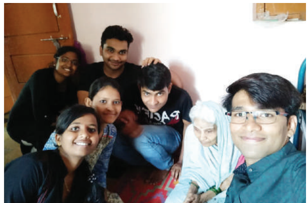
Visit to Old Age Home on September 28, 2017, Bed sheets and Medicines distributed by 2nd Year MBBS Students.