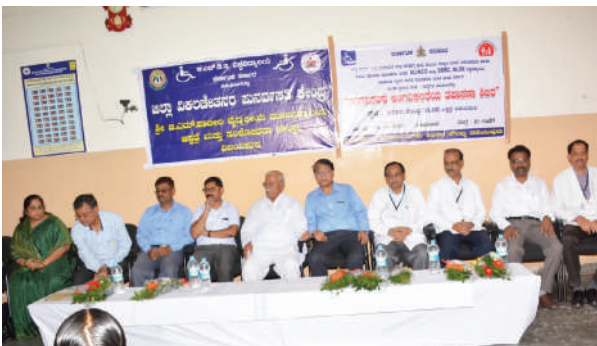
Dignitaries on the dais