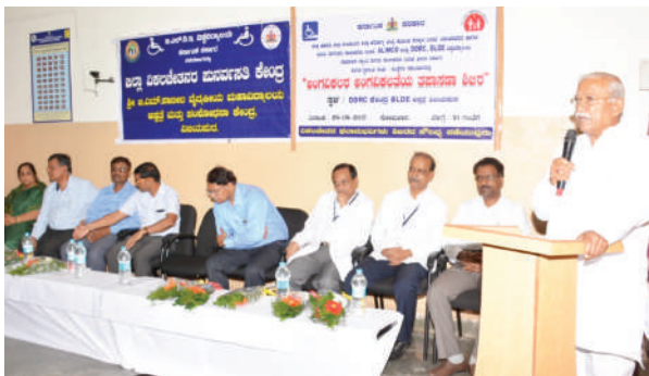
Address by Shri Ramesh Jigajinagi Hon'ble Minister of State for Drinking Water & Sanitation, Govt. Of India.

The District Disability Rehabilitation Centre (DDRC) organized Assessment Camps for Differently-abled & Senior Citizens of Vijayapura Taluka, sponsored by BLDE University, Department of Empowerment for Differently Abled & Senior Citizens, District Administration, District Health & Family Welfare Department and ALIMCO, Bangalore. Shri Ramesh Jigajinagi Hon'ble Minister of State for Drinking Water & Sanitation, Govt. Of India, inaugurated DDRC Assessment Camp on August 23, 2017.