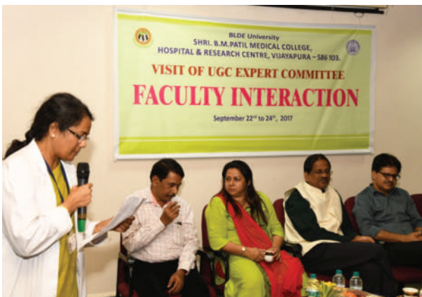
The committee Interaction with Students, Staff and Faculty