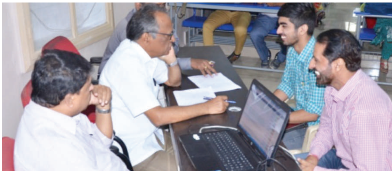
Counseling and Admission Process