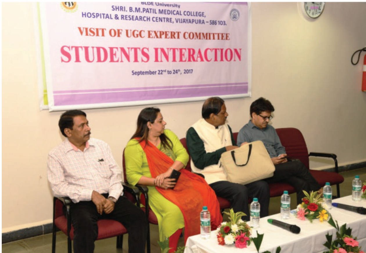
Interaction with Students