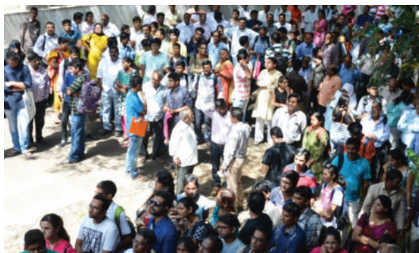
Candidates attending Mop-Up Round Counseling

The University conducted Unreserved Category Mop-Up Round Counseling and Admission