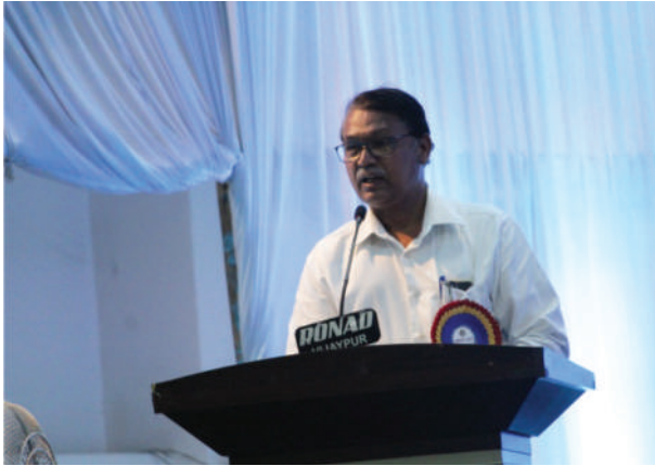
Hon'ble Vice-Chancellor addressing