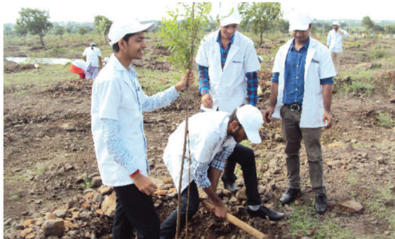
NSS Volunteers of BLDE University participated in Plantation Drive