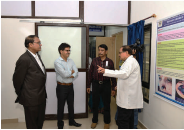
Committee in Center of Excellence, Department of Dermatology and Museum of Forensic Medicine Department