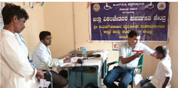
DDRC Camp was conducted by Department of Ophthalmology, at Sindagi on August 1, 2017.