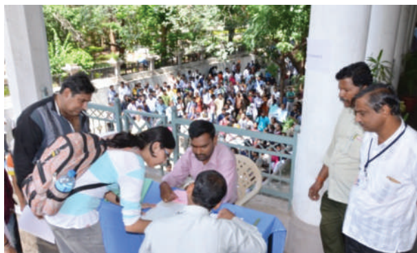
Candidates Reporting in progress as per All India UG NEET Ranking

as per directions of DGHS on September 02, 2017 for 30 vacant seats and on September 06, 2017 for 22 NRI vacancies (converted into UR-Category), after surrender of seats to the University by the Central Counseling Authorities (DGHS/MCC). The MBBS admission process completed for the academic year 2017-18.