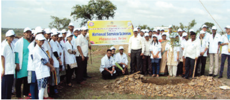
Plantation Drive at Prerana School Campus