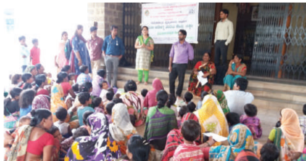
On the Occasion of "World Breast Feeding Week" Health Education was organized on August 4, 2017 at Mallayya Temple, Ukkali.