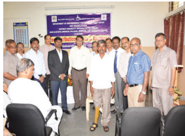
Beneficiaries of the free distribution of Aids & Appliances