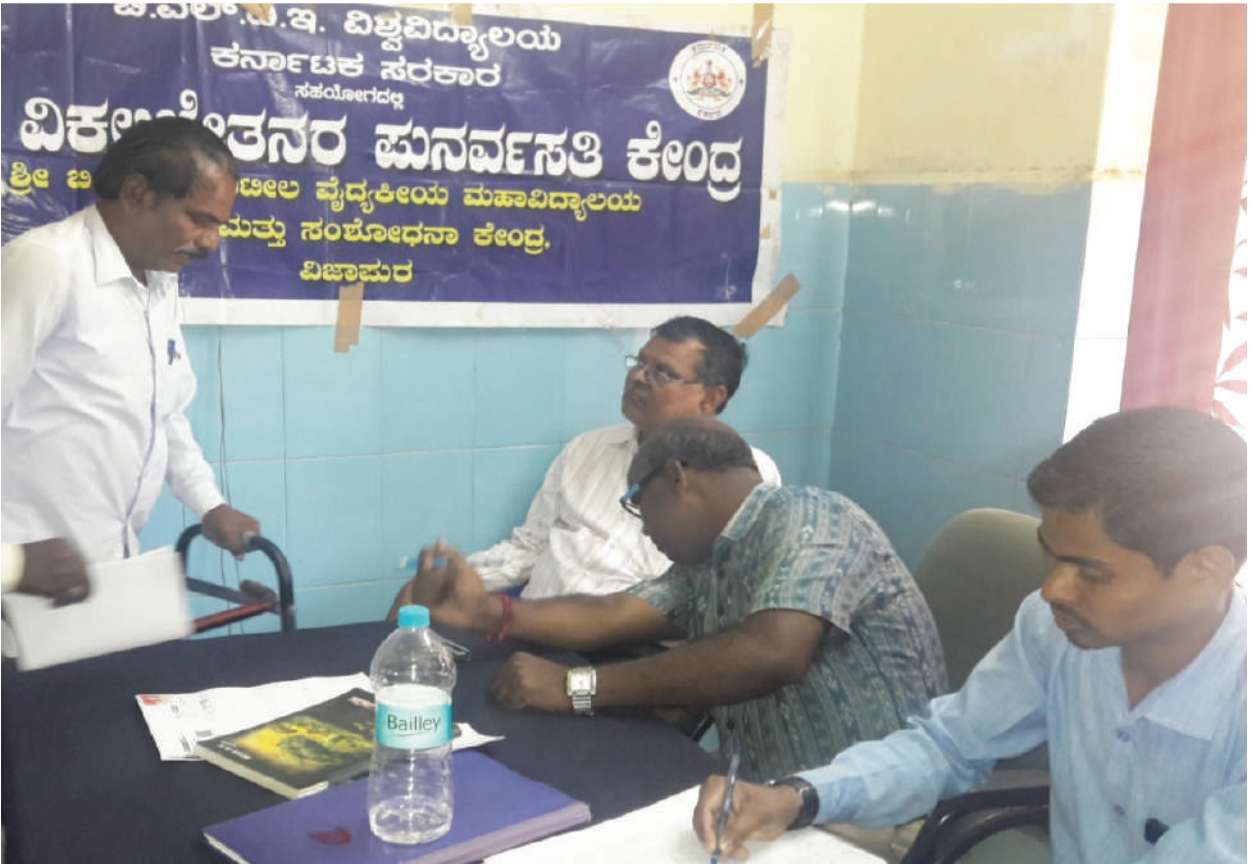
Assessment Camp conducted at Taluka Hospital, Sindagi on September 1, 2017.