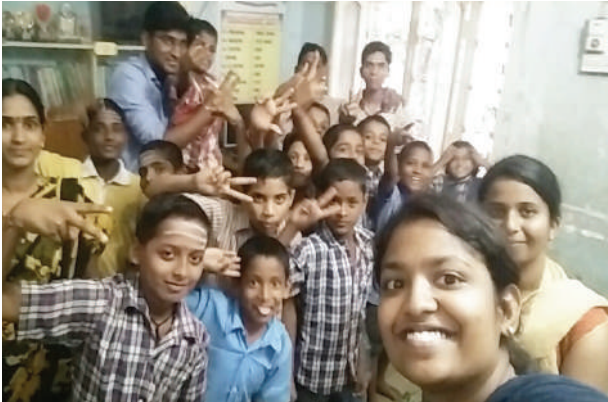
Visit to Orphanage on August 16, 2017, Clothes and Sweets distributed by 2nd Year MBBS Students