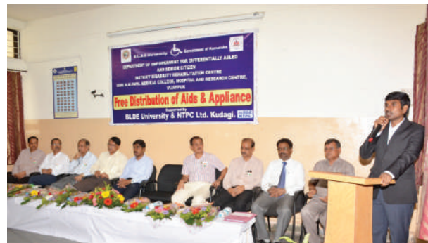
Shri Shivakumar K. B., Deputy Commissioner, Vijayapura addressing