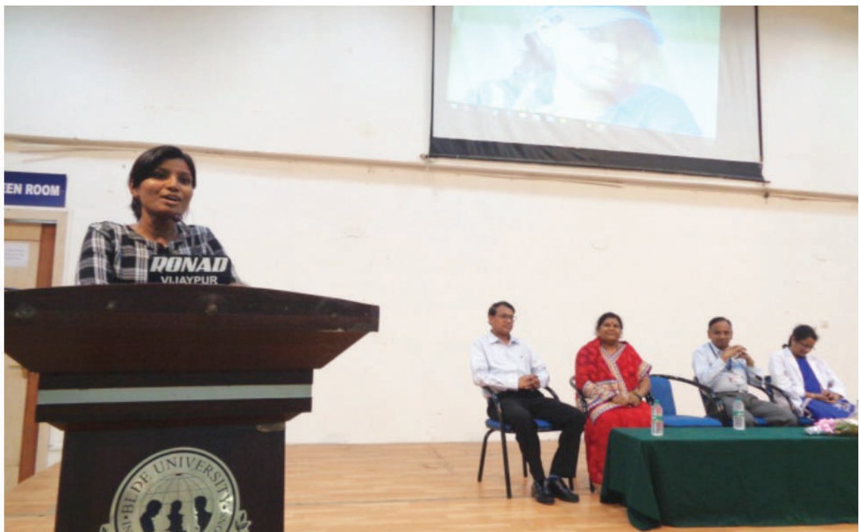
Miss. Rajeshwari S. Gayakwad shared her experience and efforts of achievements.