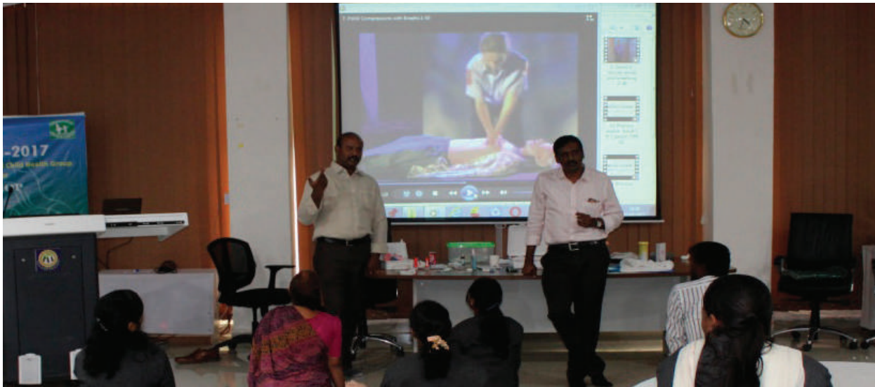
Hands on training for delegates: BLS practice with video and competency testing