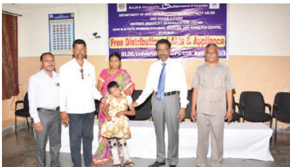
Assessment Camp conducted at DDRC Centre