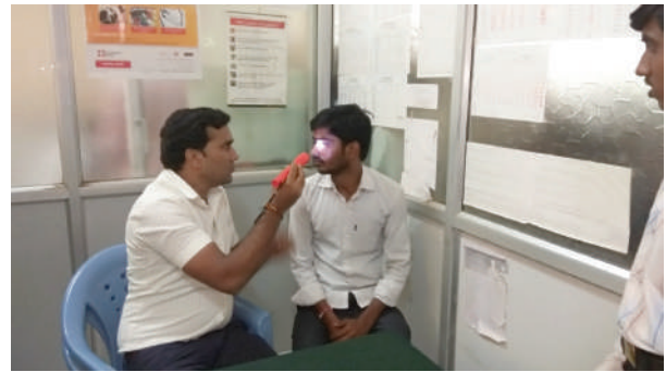
DDRC Camp was conducted by Department of Ophthalmology, at Indi on August 8, 2017.