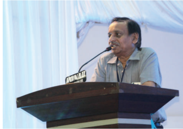
Dean, FoM & Principal addressing