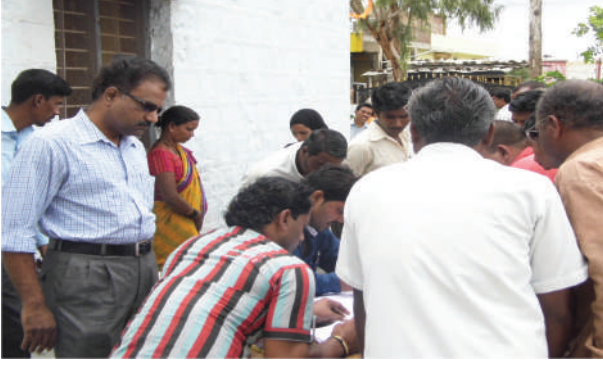
Assessment Camp conducted at Kolhar on July 01, 2017