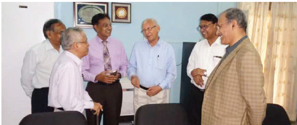
Interaction with dignitaries