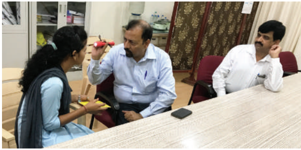
Free Eye Check-up Camp was conducted by Department of Ophthalmology, at SB Arts and KCP Science, College, Vijayapura on July 29, 2017.