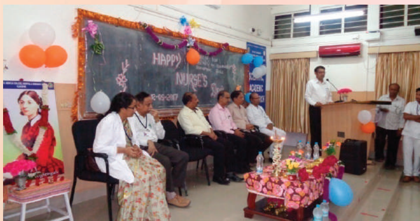
On the occasion of Birth Anniversary of Florence Nightingale ‘Nurses Day’ celebrated on May 12, 2017