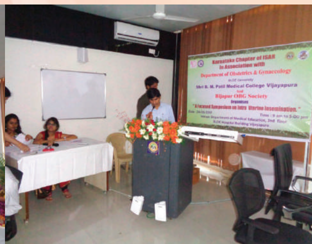
Invited guests delivering lecture on respective topics