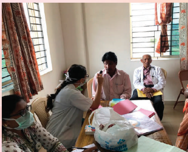
Free Eye Check-up Camp was conducted by Shri B. M. Patil Medical College, Hospital & Research Centre, held at Saint Joseph Community & Welfare Centre, Vijayapura on June 18, 2017.