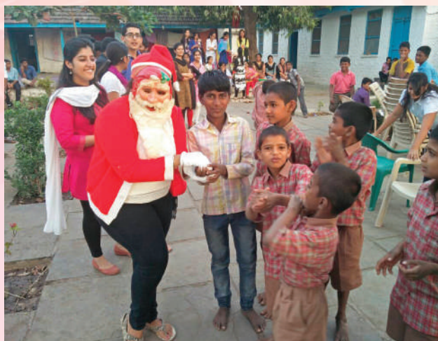
Visit to Orphanage home on April 16, 2017