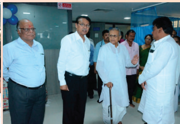
Honb'le President, General Secretary, Vice-Chancellor, Chief Advisor visited newly renovated CCU facility