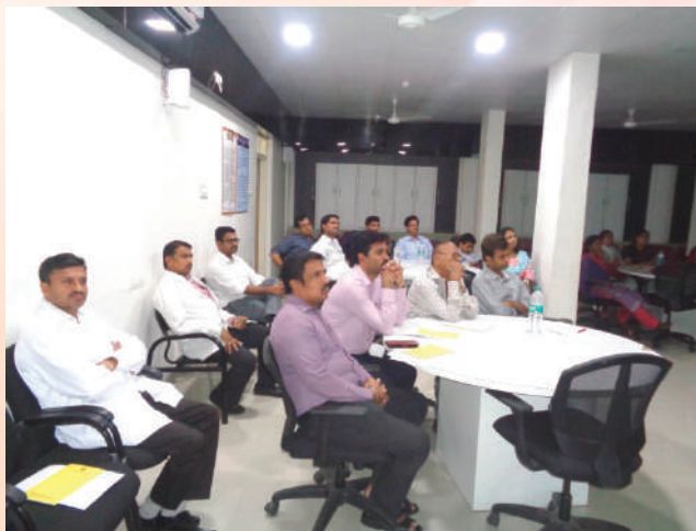
Faculty Members at Workshop