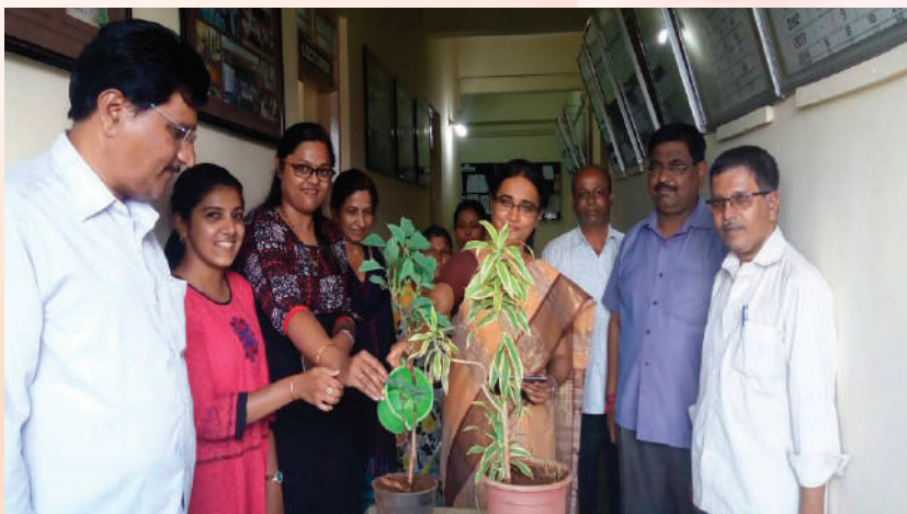
‘World Environment Day’ was observed on June 5, 2017