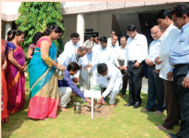
Hon'ble President planting tree