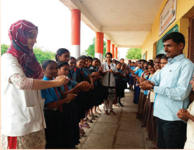
Awareness programme on “Intensified Diarrhoea Control Fortnight” organized by RHTC Ukkali at Government Kannada Girls Higher Primary School, Ukkali, on June 22, 2017.