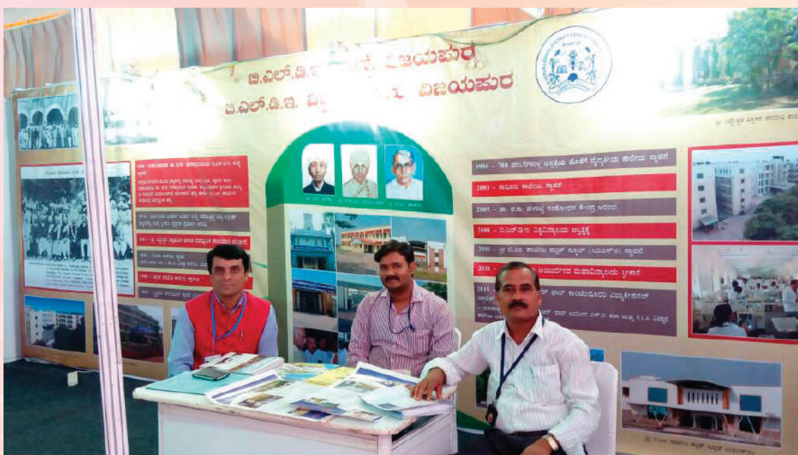
Our executives are at the TV9 Education Expo, Bengaluru