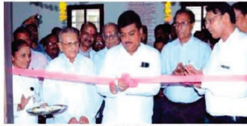
ವಿಜಯಪುರದ ಬಿಎಲ್.ಡಿ.ಆ. ಆಸ್ಪತ್ರೆಯಲ್ಲಿ ಆತ್ಮಾಭಿಮಾನಿ ಚರ್ಮರೋಗ ಸಂಶೋಧನಾ ಕೇಂದ್ರವನ್ನು ಸಚಿವ ಎಂ.ಪಿ.ಹಾಟಲ ಉದ್ಘಾಟಿಸಿದರು.