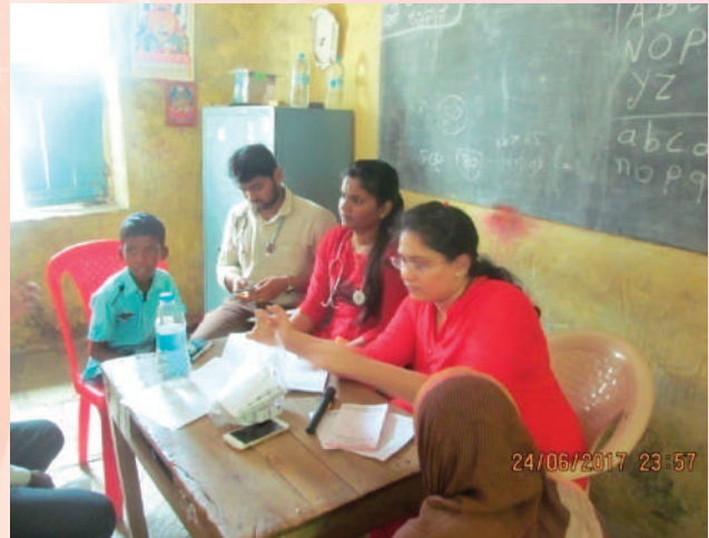
Health Check-up Camp conducted by Shri B. M. Patil Medical College, Hospital & Research Centre, held at Chadachan on June 25, 2017.