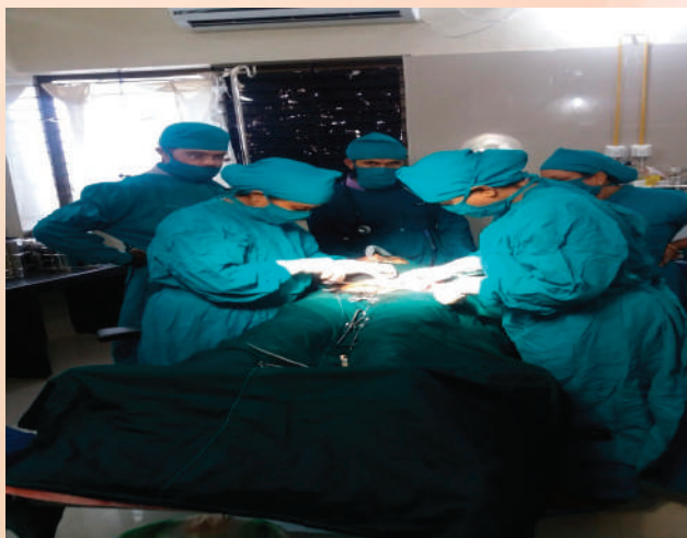
Tubectomy Camp conducted by Department of Community Medicine, at Rural Health Training Centre, Ukkali, on June 6, 2017.