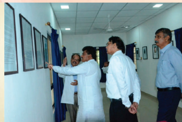
Centre of Excellence of Dermatology inaugurated and visited by Hon'ble President