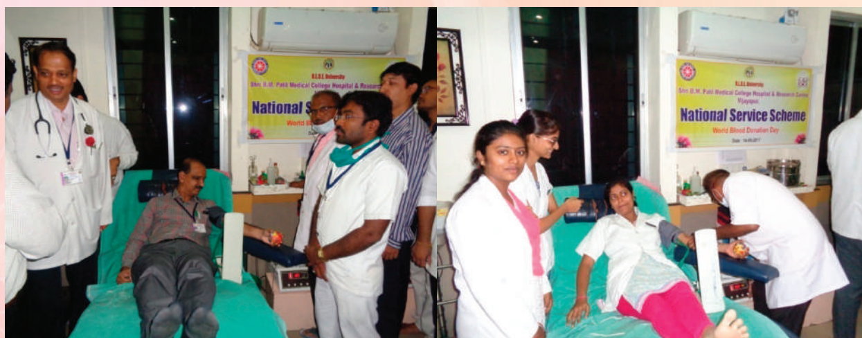
Medical Superintendent donating blood