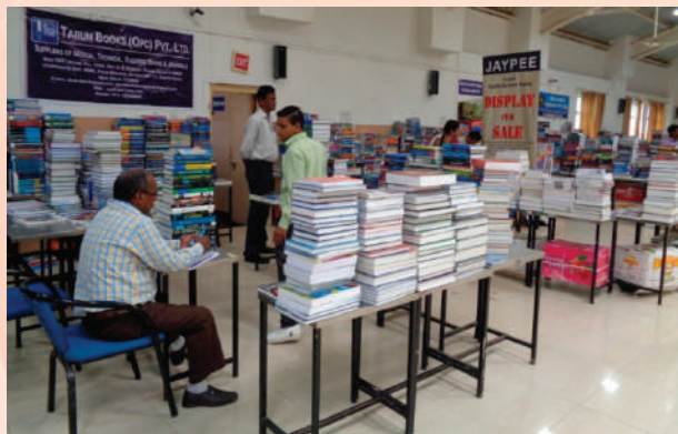
Books Exhibition organized at Auditorium, Central Library, Smt. Bangaramma Sajjan Campus, from 28 th to 30 th June, 2017.