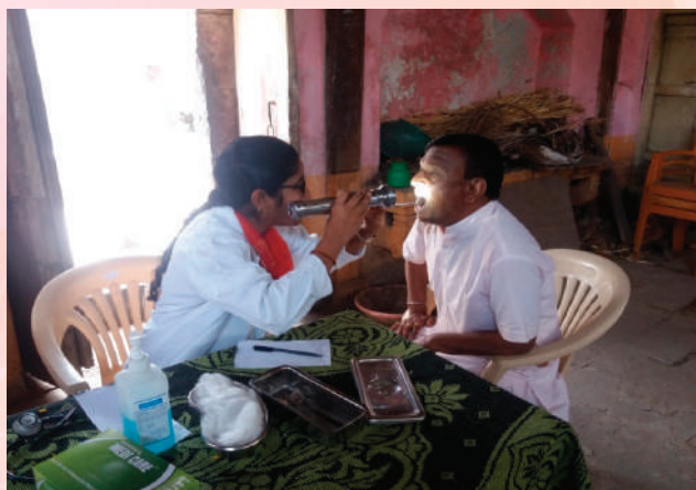
Free Oral Check-up Camp was conducted by Department of Dentistry, at Virakth Math, Masabinal Village, on May 31, 2017.