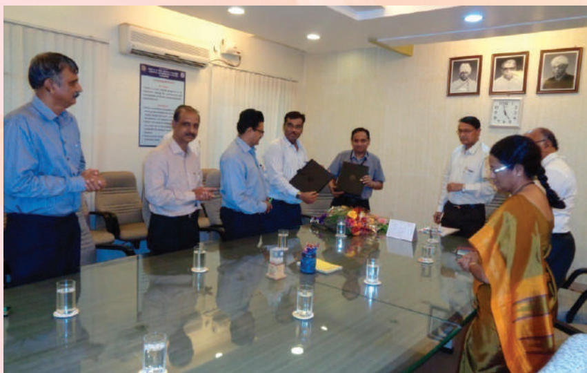
Exchanging MoU with the Surgeon, District Hospital, Vijayapura