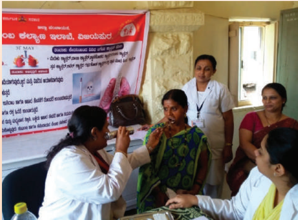
Free Oral Health Check-up Camp for tobacco users was conducted by the Department of Dentistry in collaboration with Health and Family Welfare Department, held at Chandabawadi, on June 2, 2017.