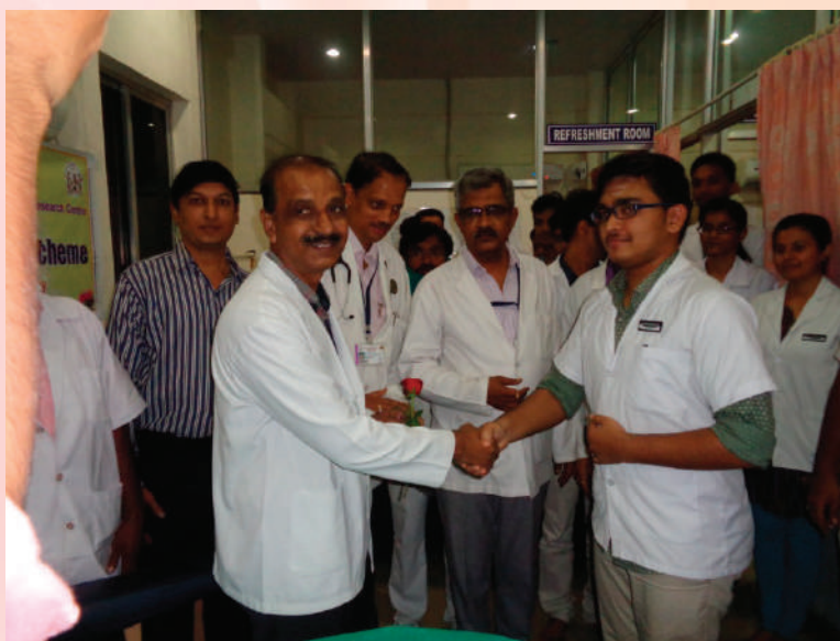
Medical Superintendent felicitating by PG Student