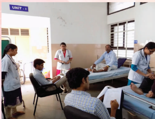
Department of General Surgery conducted OSCE Examination for 8th Term Students held on April 22 and June 2, 2017 at Surgery Wards.