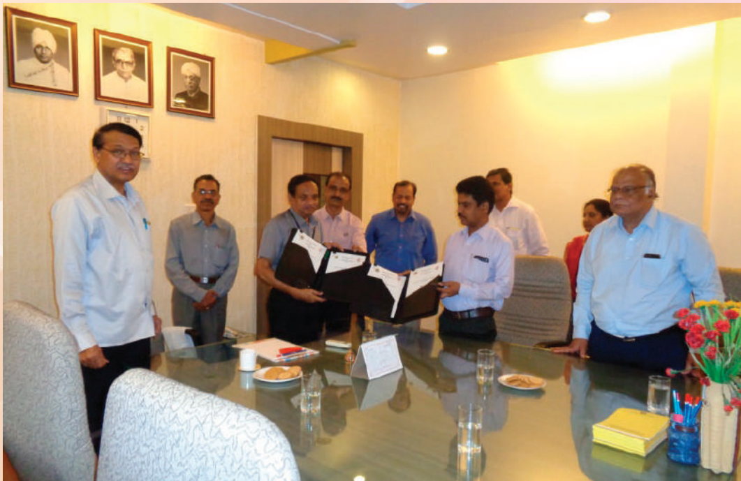
Exchanging MoU with the D.H.O, District Hospital, Vijayapura