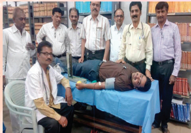
Blood Donation Camp conducted by Department of Pathology, held at BLDE Law College, Jamakhandi, on April 26, 2017.