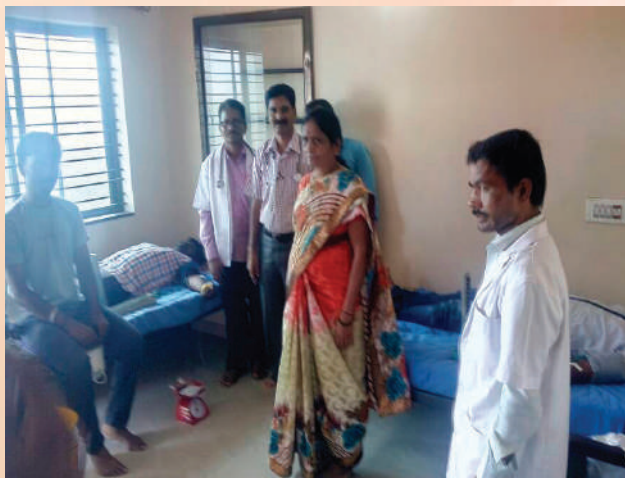
Blood Donation Camp conducted by the Department of Pathology in association with Gamesa Renewable Energy, on June 18, 2017.