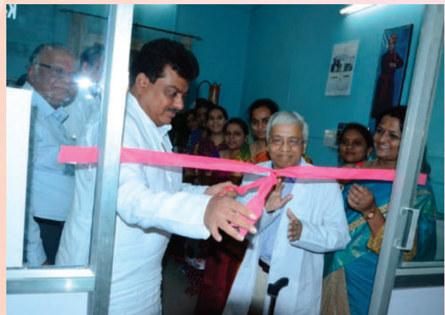
Molecular Biology Unit of Laboratory of Vascular Physiology & Medicine inaugurated by Hon'ble President.