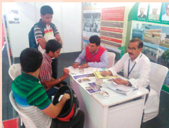
Students gathering information by our executives.