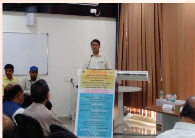
Hon'ble Vice-Chancellor delivering inaugural address