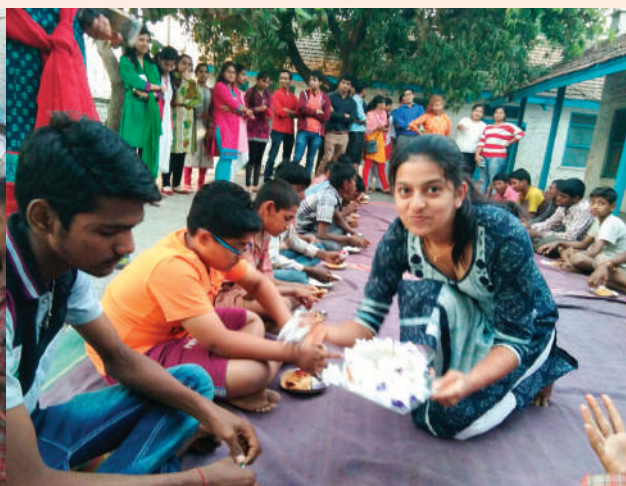
Visit to Blind School, donation of Braille pads. Braille slates and knob stylus etc.