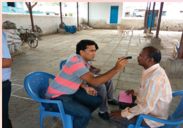
Free Eye Check-up Camp was conducted by Shri B. M. Patil Medical College, Hospital & Research Centre, held at Shikhar Khana, Vijayapura on June 11, 2017.