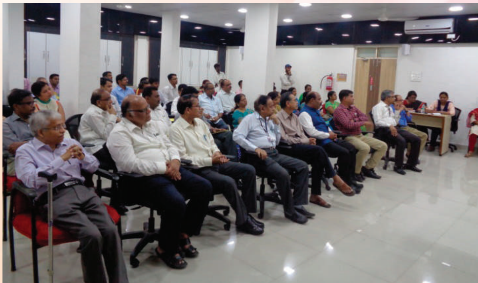
Delegates and dignitaries in attendance at the programme