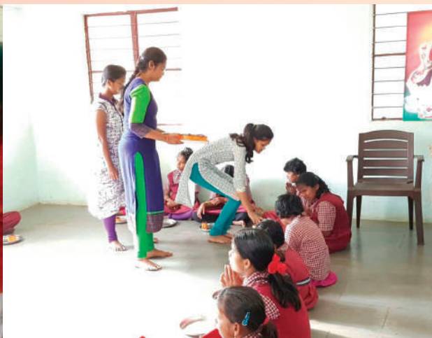
Visit to Jalanagar Orphanage on May 28, 2017 donation of clothes and bedsheets grains etc