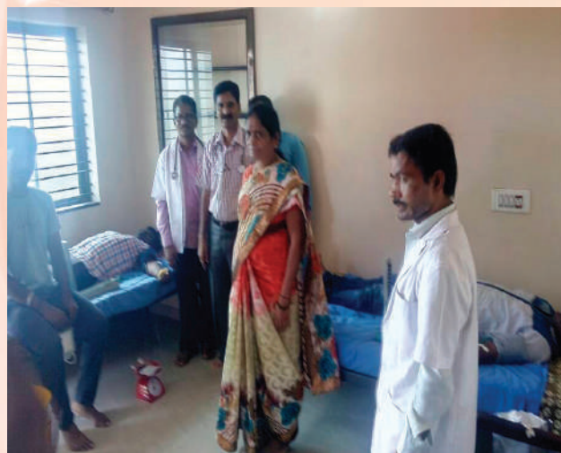
Blood Donation Camp was conducted by Siemens Gamesa Renewable Energy Pvt. Ltd, Vijayapura branch on June 18, 2017.