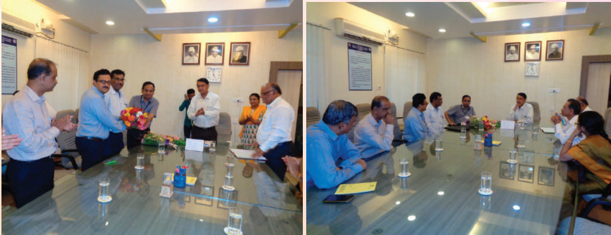
Exchanging greetings with the Surgeon, District Hospital, Vijayapura