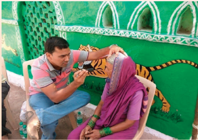
Free Eye Check-up Camp was conducted by Shri B. M. Patil Medical College, Hospital & Research Centre, held at Pailawan and Julle Galli, Vijayapura on April 23, 2017.