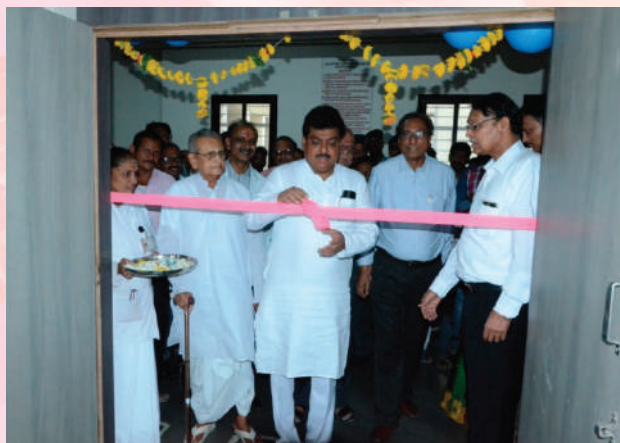
Inauguration of newly renovated CCU by Hon'ble Medical Superintendent welcoming Honb'le President