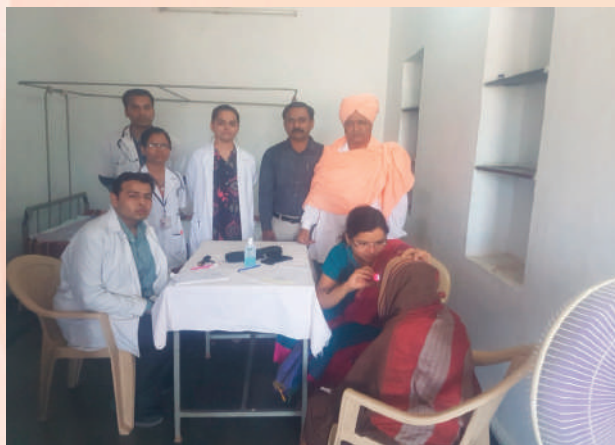
Mega Surgical Eye Camp was conducted by Shri B. M. Patil Medical College, Hospital & Research Centre, held at Sindagi on May 23, 2017.