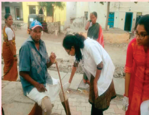
Visit to Leprosy Colony on April 07, 2017 donation of regular groceries, ointments, oil,