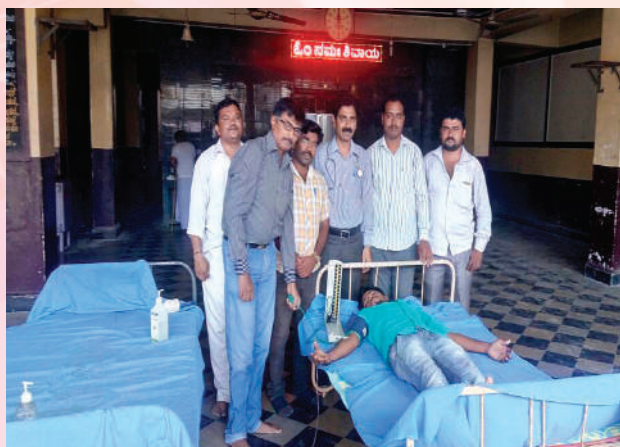
Blood Donation Camp was conducted by the Yuvi Fans Group, Jorapur Peth, Vijayapura on May 14, 2017.