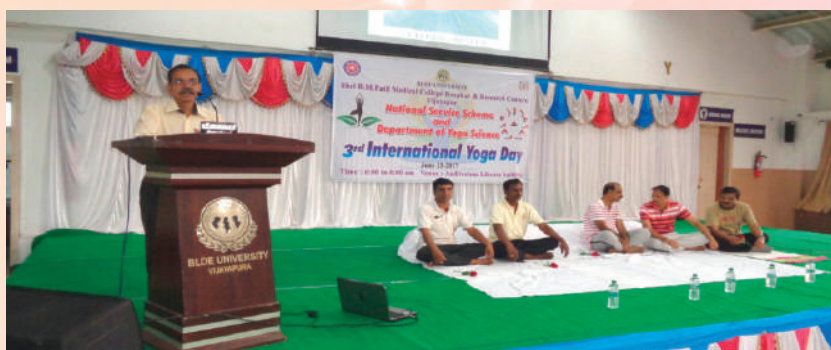
‘International Yoga Day’ was arranged by Dept. of NSS, from June 21, 2016,