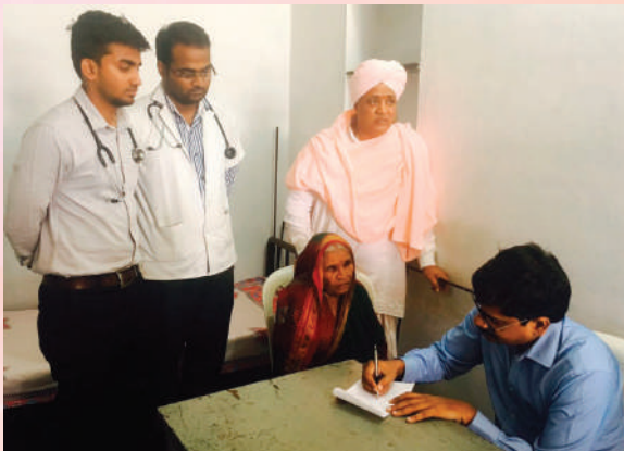
Mega Surgical Camp conducted by Department of Ophthalmology, at Sindagi on November 21, 2016.