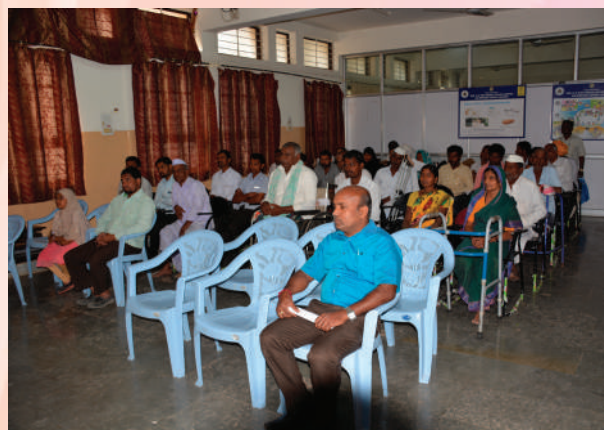
Beneficiaries of the free distribution the dignitaries. of Aids & Appliances.