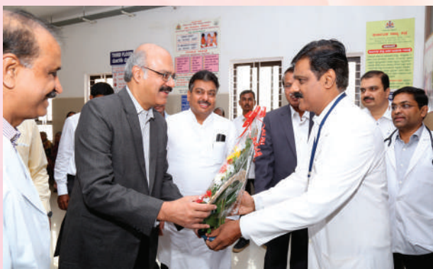
Professor & HoD, Pediatric welcoming Chief Guest.