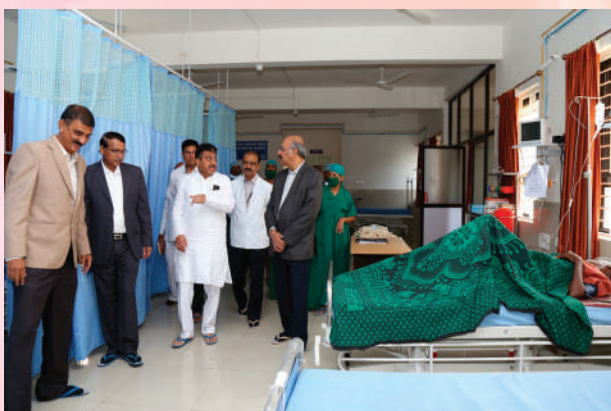
Chief Guest visit at ICCU