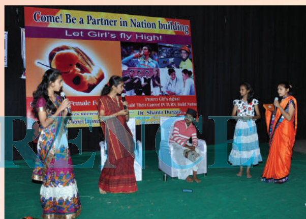
Children performing a Drama on ‘Beti Bachao, Beti Padhao’