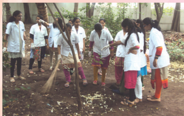
Students participated in Jatha and cleaning hospital premises gardens