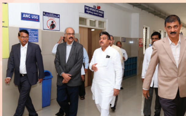
Chief Guest visit at Hospital premises