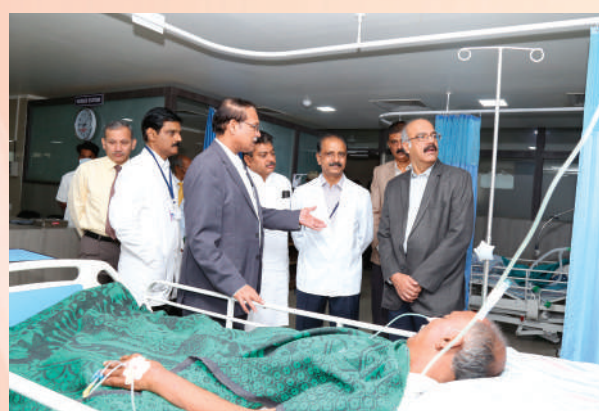
Chief Guest visit at CCU