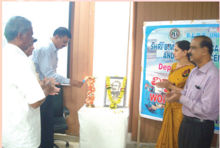
‘World Anesthesia Day’ celebrated on October 16, 2016 at BLDE University.