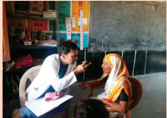
Free Eye Check-up Camp conducted by Department of Ophthalmology, at Ukumanal on October 16, 2016.