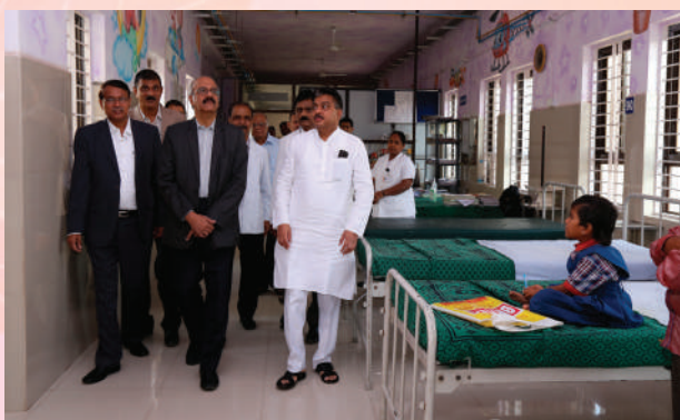
Chief Guest visit at Pediatric Ward