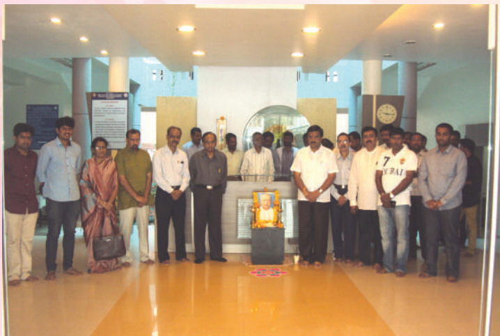
On the occasion of Sardar Vallabhbhai Patel's birth anniversary - "National Unity Day" is celebrated on October 31, 2016.