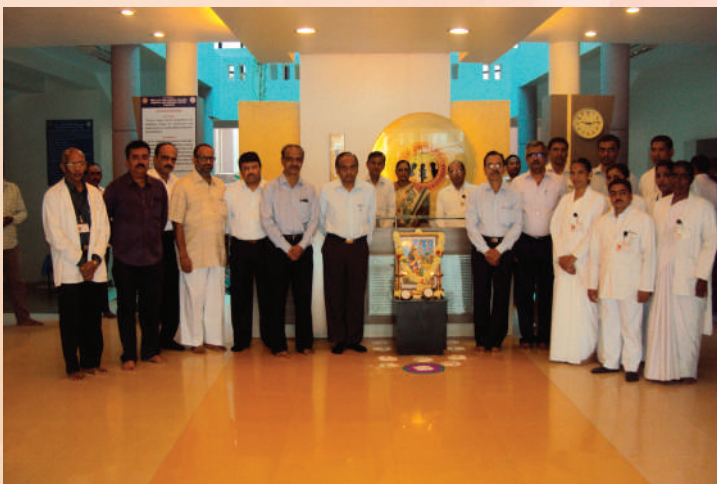
‘Kanakadas Jayanthi’ celebrated on November 6, 2016 at BLDE University.