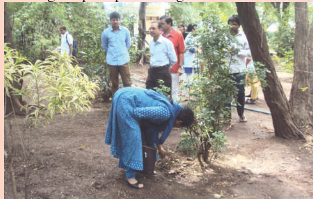
Faculty members participated in Swachha Bharata Abhiyana