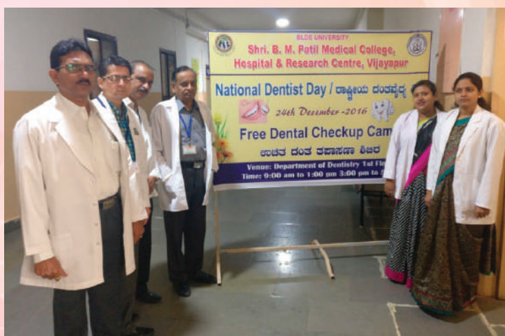
"National Dentist Day" celebrated on December 24, 2016 in the Hospital premises.