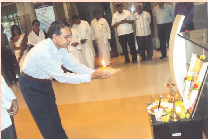
"Kannada Rajyotsava" celebrated on November 1, 2016 in the BLDE University