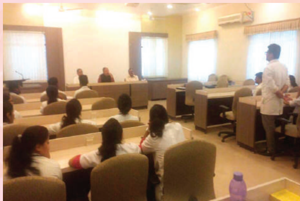
Interaction with students