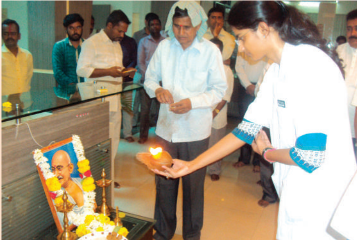
‘Mahatma Gandhi Jayanthi’ celebrated on October 2, 2016 at BLDE University.