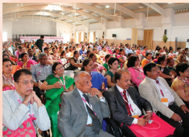
Dignitaries & audience