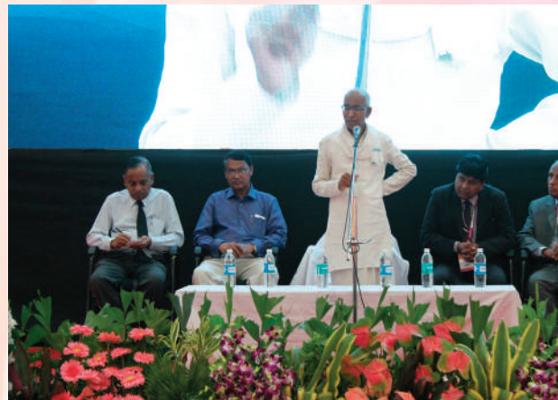
Pujya Shri Shri Siddeshwar Swamiji gave Aashirvachana on 2 nd Day of KSOGA-2016 Conference.