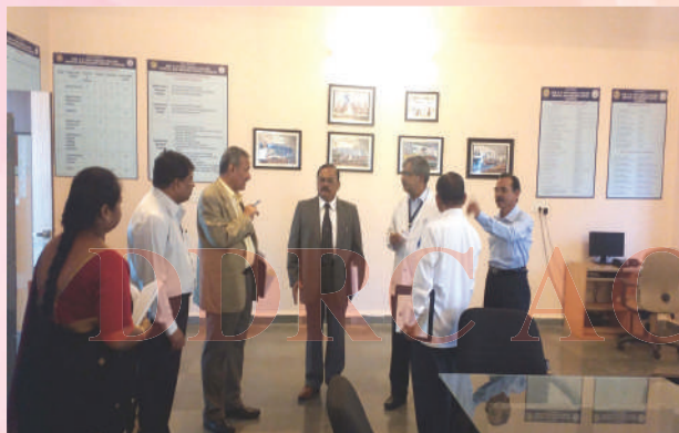
AAA Committee Members visit at IQAC