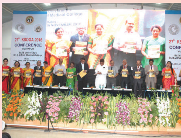
Release of Conference Souvenir