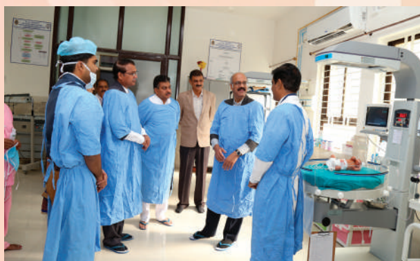
Chief Guest visit at NICU Ward