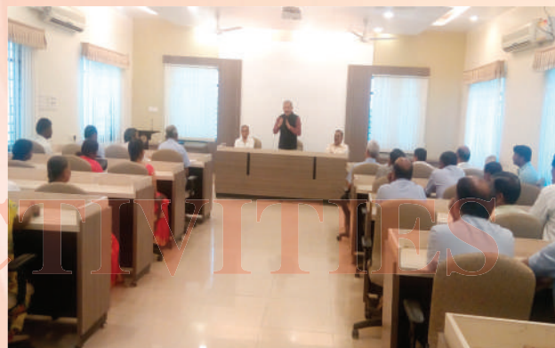
Interaction with non teaching staff.