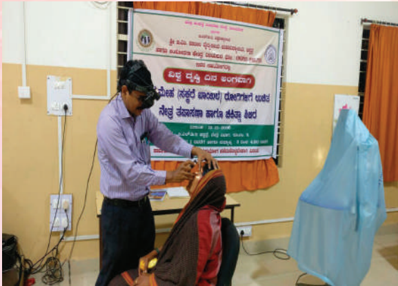
Diabetic Retinopathy Screening Camp conducted by Department of Ophthalmology, at BLDEU's Shri B. M. Patil Medical College, Hospital & Research Centre, Vijayapura on October 13, 2016.