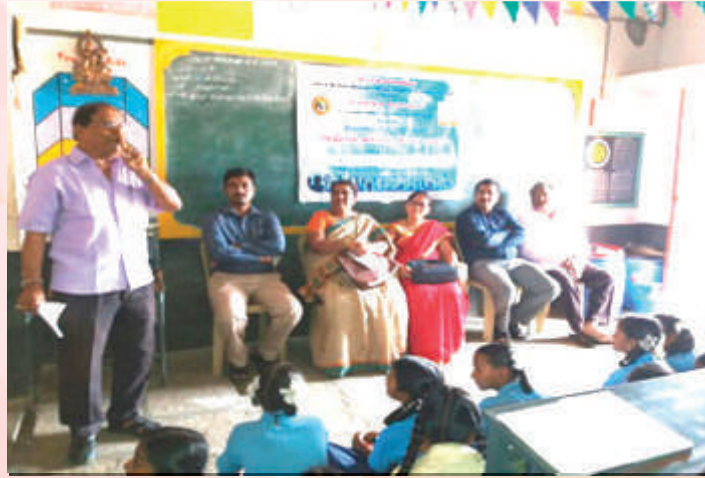
‘World Population Day’ celebrated on July 21, 2016 at Govt. Kannada Primary Girls School, Ukkali.