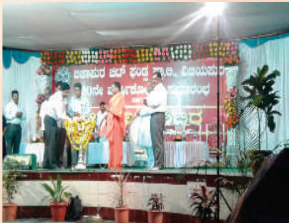
Eye Donation Camp conducted by Vijayapura Chit Funds Pvt. Ltd., at Vijayapura on September 17, 2016.