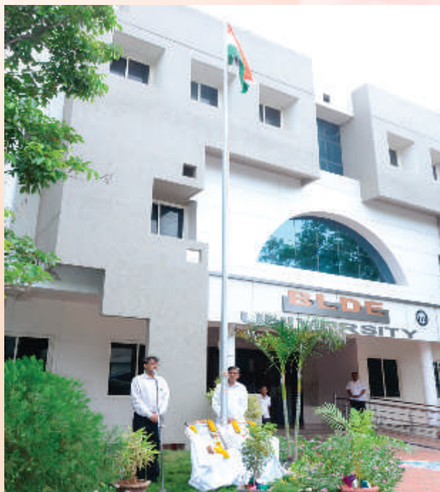
‘70 th Independence Day’ celebrated on August 15, 2016 at the BLDE University