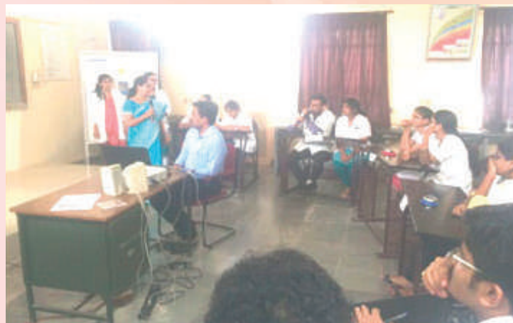
‘World Rabies Day’ celebrated and conducted Quiz Competition on September 28, 2016 at Department of Community Medicine, Practical Hall.