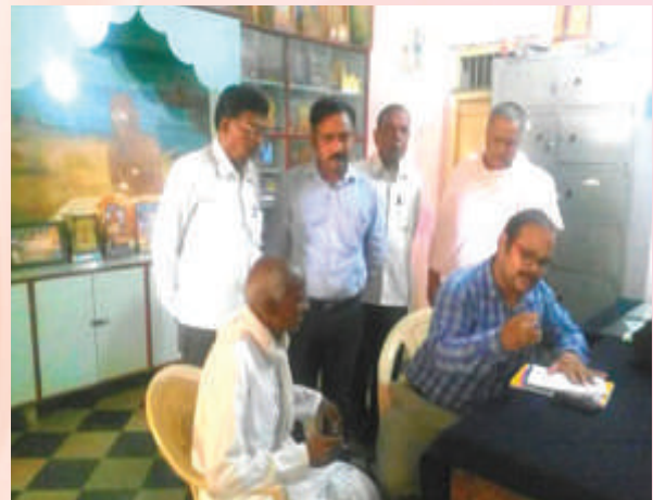
Mega Surgical Eye Camp conducted by Dept. of Ophthalmology, at Sindagi on August 23, 2016.