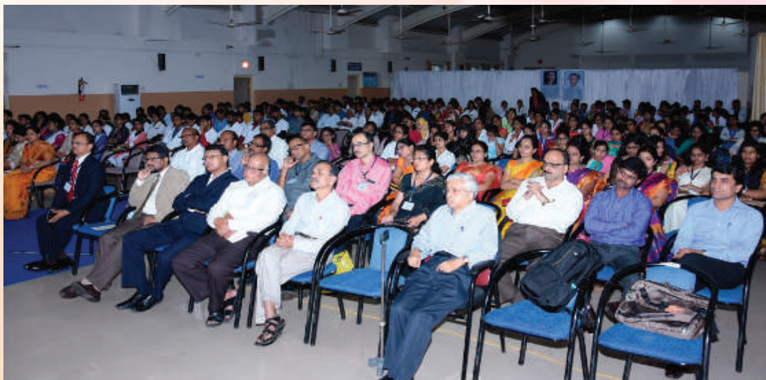
Dignitaries with Audience at ASSOPICON-2016

Department of Physiology, BLDE University, Shri B. M. Patil Medical College, Hospital and Research Centre, Vijayapura organized 3 rd Annual Conference of Association of Physiologists of India during 14 th -17 th September-2016 in Central Library Auditorium with theme “Physiology Decodes Novelty of Vascular Sciences” 14 th Sept-2016 (Wednesday), one full day was totally dedicated to Undergraduate students of health sciences as “Student ASSOPICON 2016, attended by more than 300 UG Students from all over the country of various disciplines like medicine, Dentistry, Pharmacy, AYUSH etc. This was the first time in the country, a National Medical Conference had dedicated entire one day for UG students. The students participated in the meeting as delegates, presented their scientific research or non-research papers (100 free papers were presented), Joined in panel discussions with international medical professor and participated in research methodology workshop. Sessions of free paper presentations were chaired by Post Graduate students. The students were given awards for best paper and poster presentations.