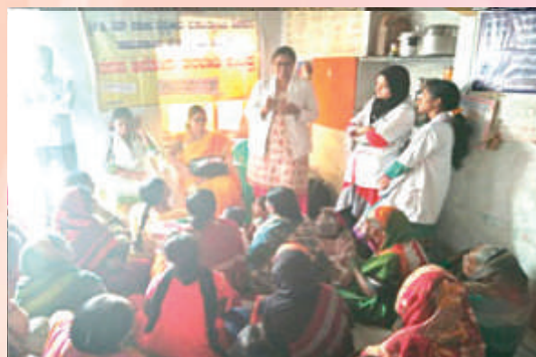
‘National Nutritional Week’ organized by R.H.T.C. Ukkali, on September 2 to 7, 2016 at Anganawadi Centers.