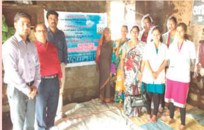
‘World Breastfeeding Week’ celebrated on August 3, 2016 at Rural Health Training Cetnre, Ukkali.