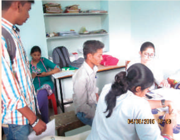
Free Eye Check up Camp conducted by Department of Ophthalmology, at BLDEA's B.H.S. Arts & T.G.P. Science College, Jamakhandi on August 4 to 5, 2016.