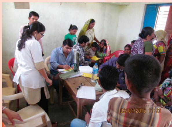
Health Check up Camp conducted by Dept. of Community Medicine at Hanchinal Tanda, on January 3, 2015.