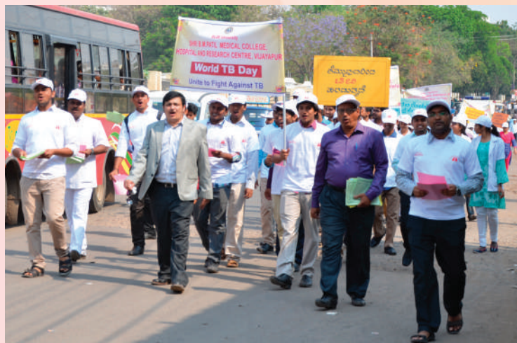
“World TB Day” observed on March 29, 2016. On this occasion Jatha was arranged.