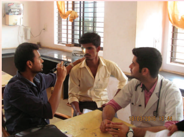
Eye Checkup Camp conducted by Dept. of Ophthalmology at Jamakhandi on March 17-18, 2016.