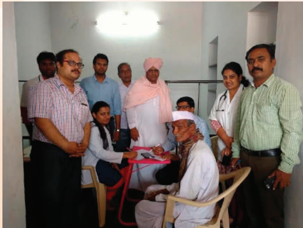
Mega Surgical Eye Camp conducted by Dept. of Ophthalmology at Sindagi on February 9, 2016.