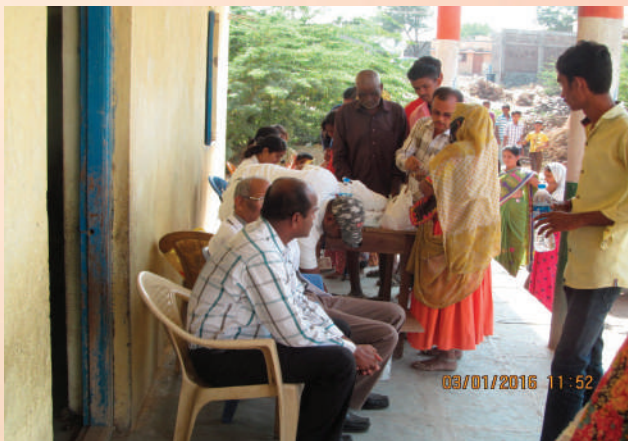
Health Check up Camp conducted by Dept. of Community Medicine at Hanchinal Tanda, on January 3, 2015.