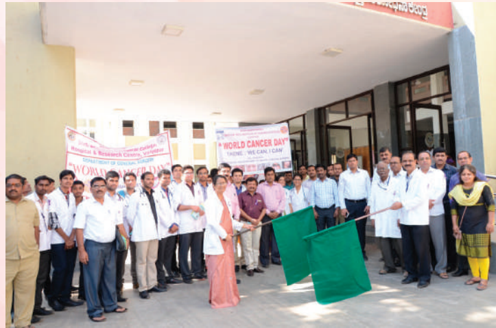
“World Cancer Day” was observed on February 2, 2016, by department of Surgery. On this occasion Jatha was flagged by Medical Superintendent.