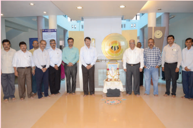
"Kanakadasa Jayanti" celebrated on November 8, 2015 in the BLDE University.