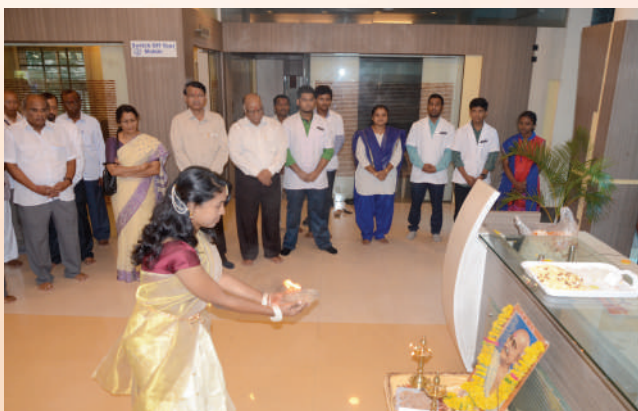
“Mahatma Gandhi Jayanti” celebrated on October 2, 2015 in the BLDE University.