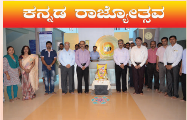
"Kannada Rajyotsava" celebrated on November 1, 2015 in the BLDE University