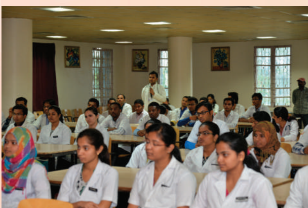
The NAAC Peer Team interacted with the students on October 29, 2015 in Library Building