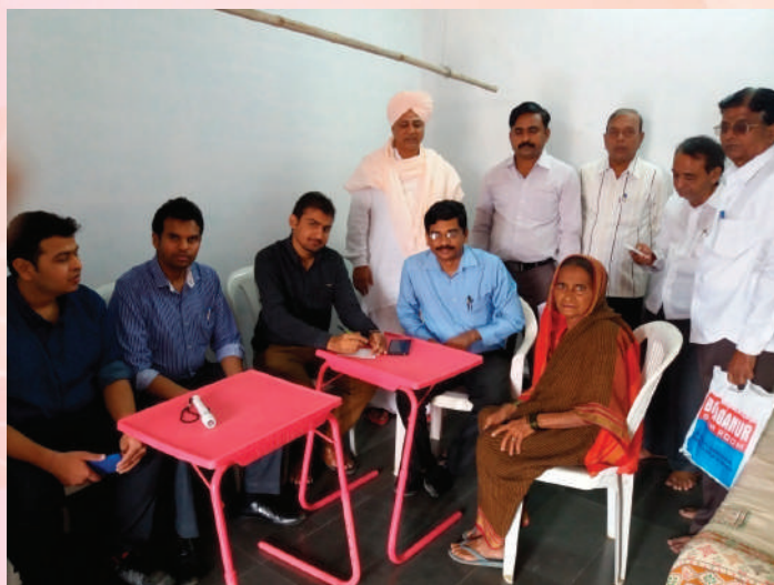
Mega Surgical Eye Camp conducted by Dept. of Ophthalmology at Sindagi on November 23, 2015.