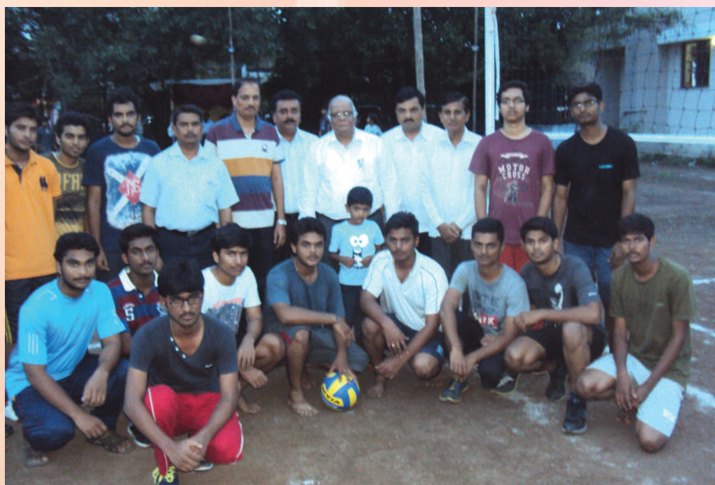
Winners of Volley Ball Team in Inter-phase Tournament on November 10, 2015.