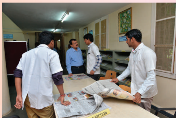
NAAC Peer Team visit to Library