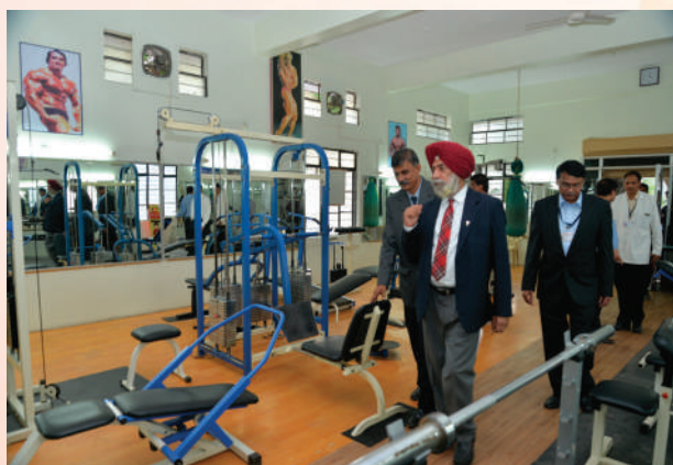
NAAC Peer Team visited various facilities on the campus