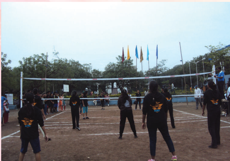
Inter-phase Tournament, Volley Ball for Women arranged on October 10, 2015.