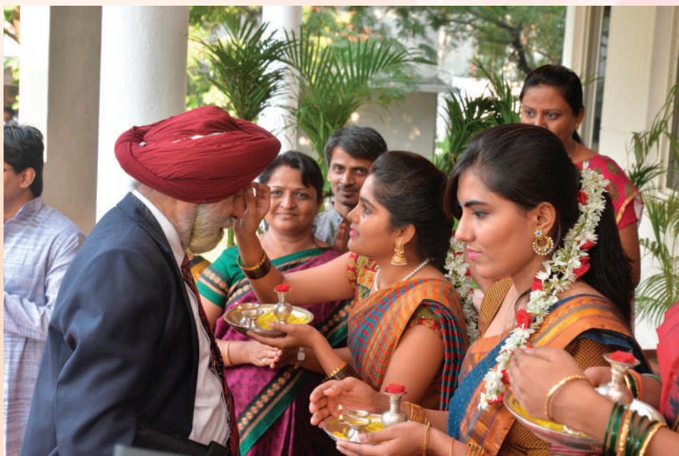
Welcome to NAAC Peer Team, by BLDE University Students