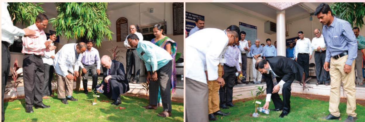
Plantation by Chief Guests on the occasion of Inauguration of Laboratory of Vascular Physiology and Medicine