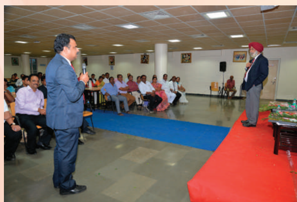
Alumni and Parents interaction with NAAC Peer Team