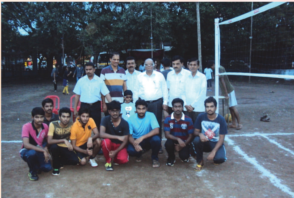
Inter-phase Tournament, Volley Ball for Men arranged on October 9, 2015.