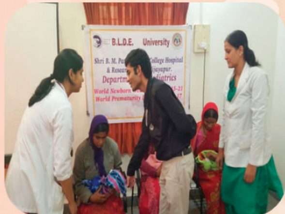
"National New Born Week" celebrated on November 15 to 21, 2015 in the Department of Pediatrics.