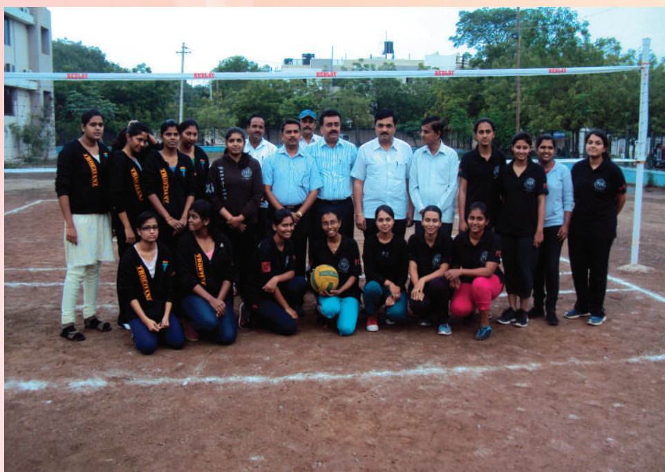
Winners of Throw Ball Team in Inter-phase Tournament on November 15, 2015.