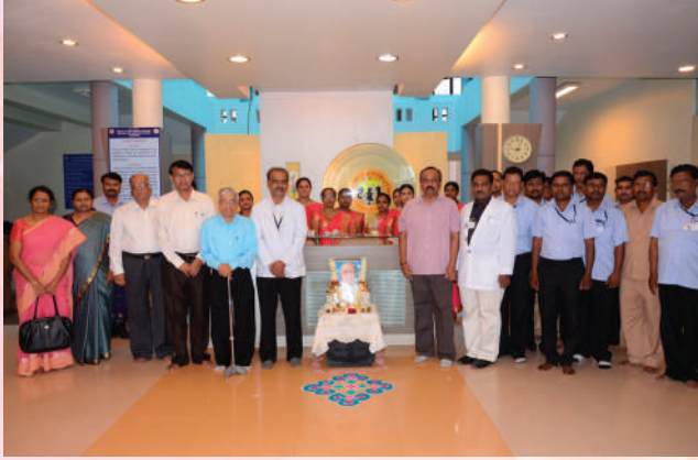
On the occasion of Sardar Vallabhbhai Patel's birth anniversary "National Unity Day" is celebrated on October 31, 2015.