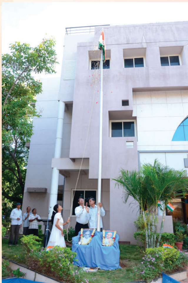
“Independence Day” celebrated on August 15, 2015. Miss Sivapuram Kavya, UG Student of 2012 Batch Hoisted the National Flag.