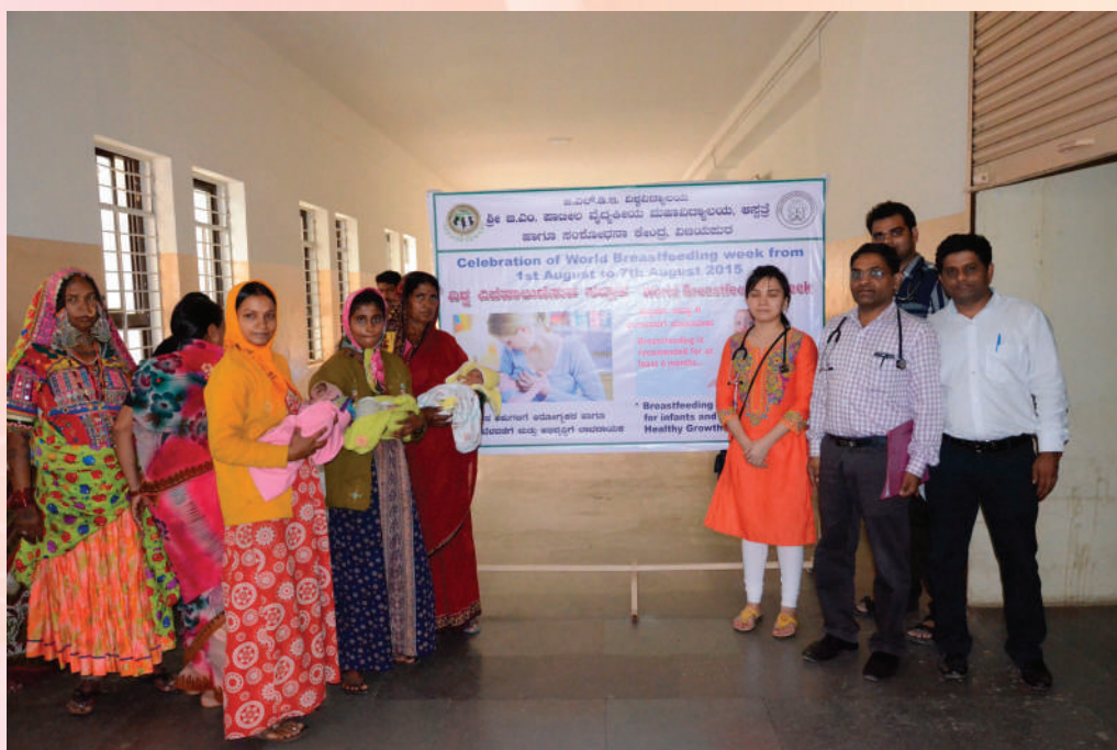
“World Breastfeeding Week” observed from August 1 to 7, 2015 in the Pediatrics Department.