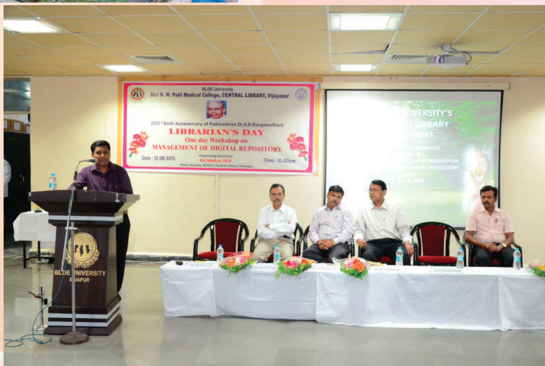
“National Library Day” Celebrated on August 12, 2015. On the Occasion of Padmashree Dr.S.R.Ranganathan’s Birth Anniversary