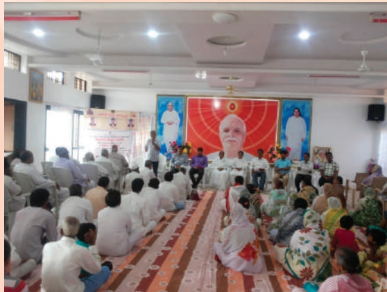
Eye Donation Awareness Programme conducted by Dept. of Ophthalmology at Jamakhandi on August 27, 2015.