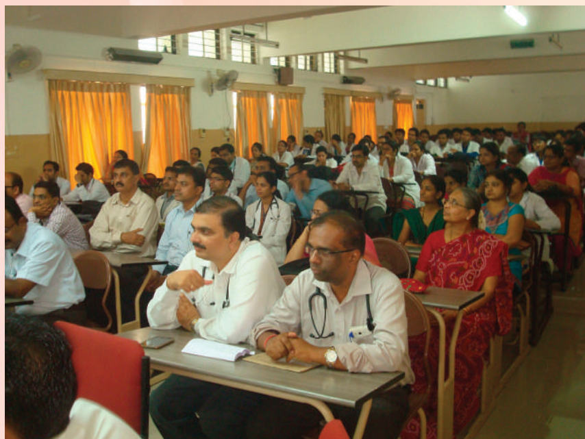
“Clinico Pathological Discussion” organized by SARS on August 6, 2015.