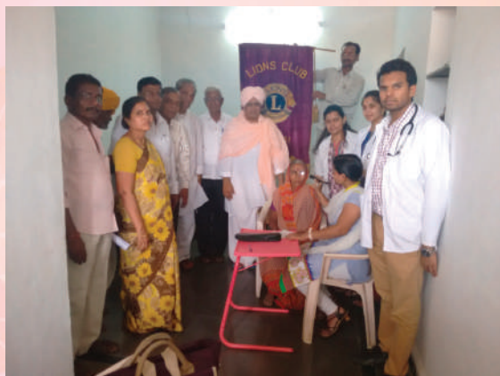
Mega Surgical Eye Camp conducted by Dept. of Ophthalmology at Sindagi on August 3, 2015.