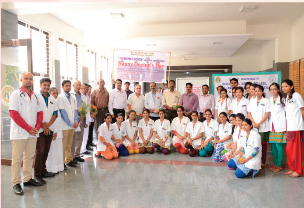
“National Doctors Day” celebrated on July 1, 2015 in the BLDE University’s Hospital Building.