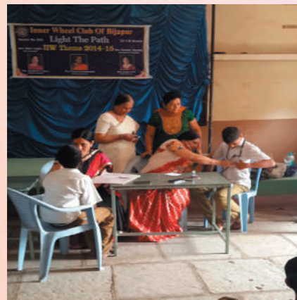
“Students Health Check up Camp” arranged by Inner Wheel Club, Conducted at Marathi Vidyalay, Vijaypur on December 19, 2014