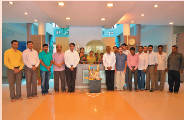
“Kanakadas Jayanti” Celebrated on November 8, 2014 in the University Building.