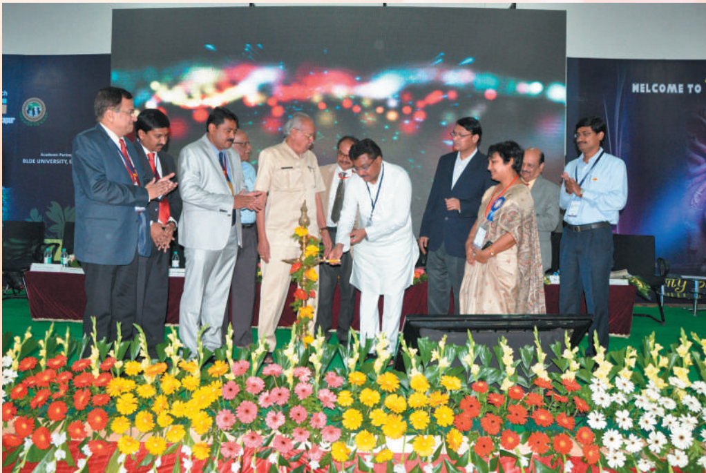
Hon'ble President, Shri. M.B. Patil, Inaugurating 5 th Annual Conference of IADVL Karnataka Branch CUTICON KN 2014 held on 1 st and 2 nd November 2014.