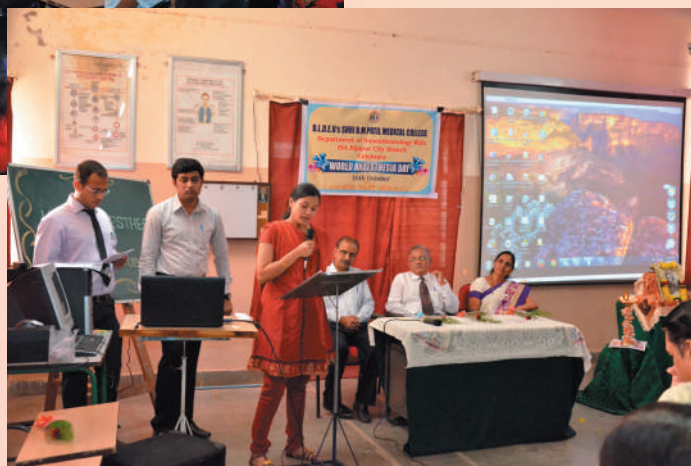
“World Anesthesia Day” Celebrated on October 16, 2014 by Department of Anaesthesiology.