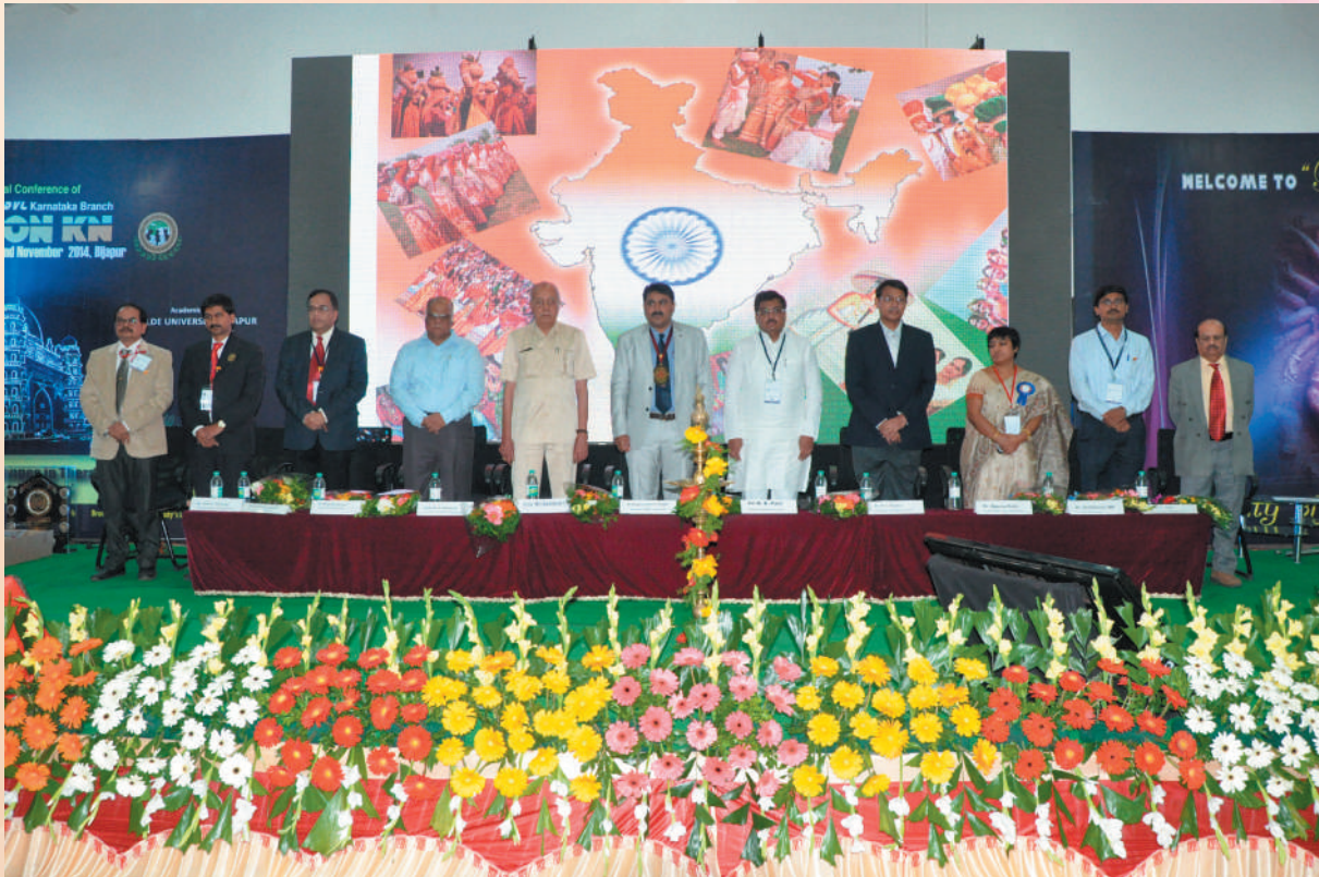
The 5 th Annual Conference of IADVL Karnataka Branch CUTICON KN 2014 was hosted by the Department of Dermatology from November 1 and 2, 2014.