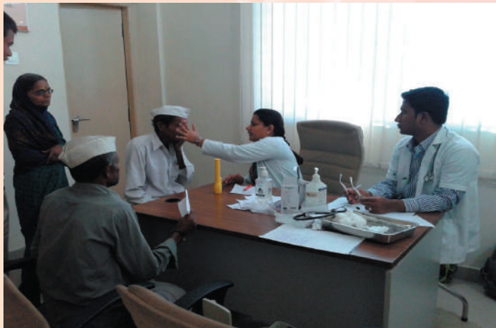
“Free Eye Check-Up Camp” Conducted at Rural Health Centre, Ukkali, on December 3, 2014.