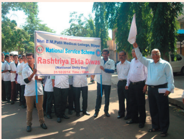
“Rashtriya Ekata Divas” (National Unity Day) to mark the Birth Anniversary of Sardar Vallabh Bhai Patel Celebrated on October 31, 2014.