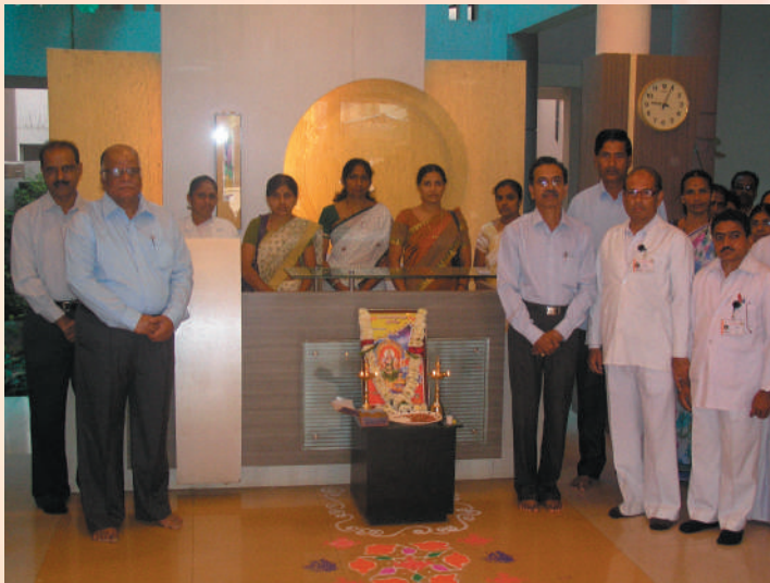
“Kannada Rajyotsava” Celebrated on November 1, 2014 in the University Building.