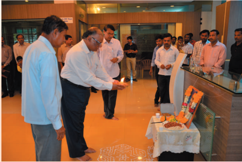
“Mahatma Gandhi Jayanti” Celebrated on October 2, 2014 in the University Building.