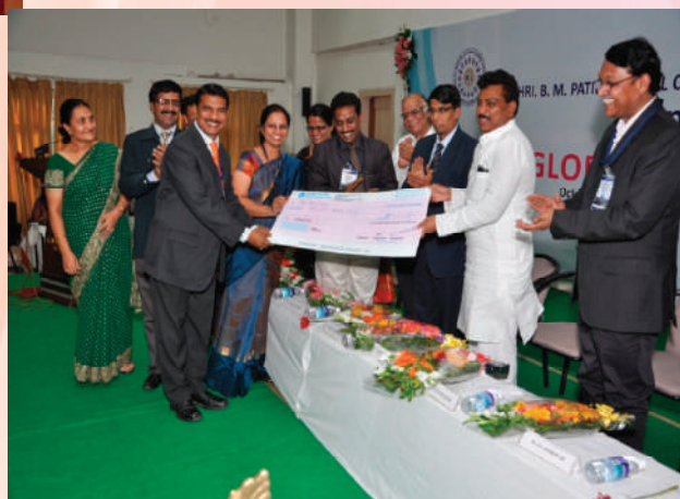
Our President receiving the cheque

The Second Global Alumni Meet was organized on 5/10/13 at Auditorium.