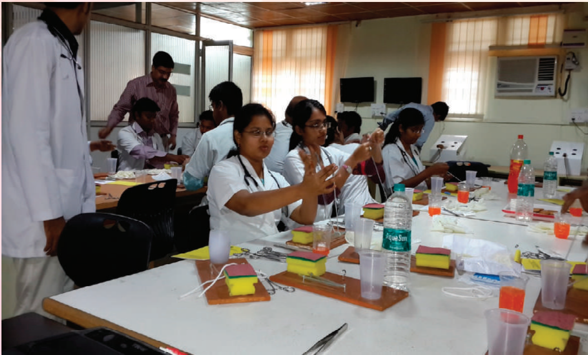
Workshop cum Demonstration on “Basic Surgical Skills” for interns of Department of Surgery, OBG & Orthopaedics on November 26, 2013. at Clinical Skills Laboratory of the University.