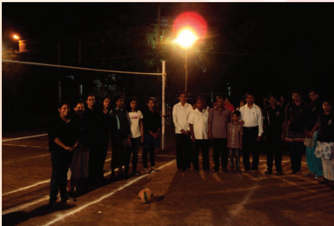
Winners of Collegiate Women Volley Ball Match October 13, 2013