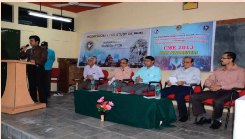
Department of Anaesthesia organized CME on "Pain Awareness" on November 23, 2013 in association with Indian Society for Study of Pain (ISSP).