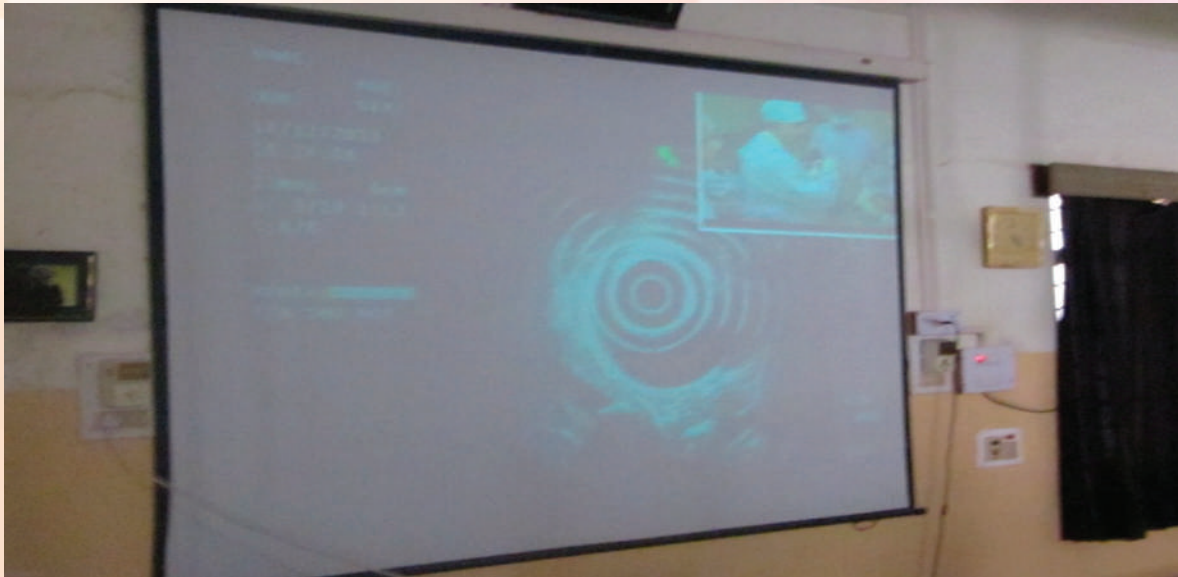
Live Demonstration on “Advanced Therapeutic Endoscopy” in collaboration with Cipla Ltd on December 14, 2013 by Department of Surgery.