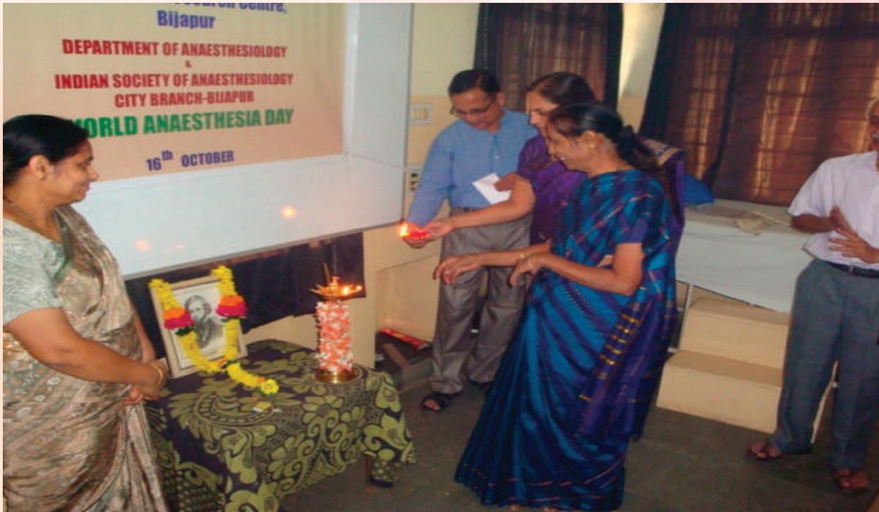
Department of Anaesthesia celebrated "World Anaesthesia Day" on October 16, 2013.