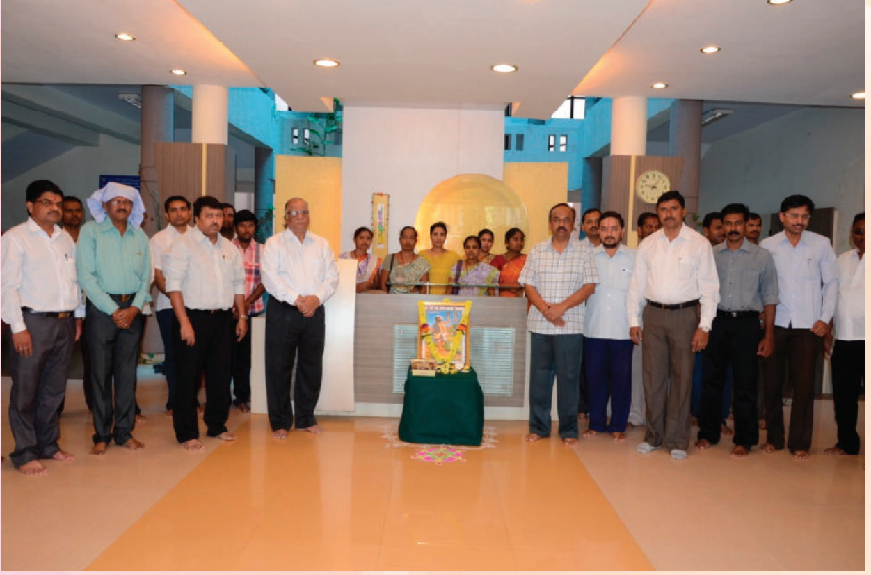
Celebrated Kanakadas Jayanti on November 20, 2013.