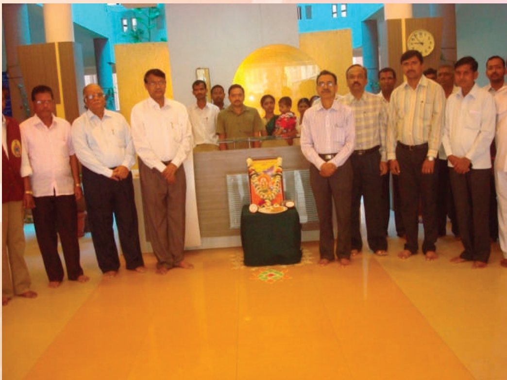
Celebrated Karnataka Rajyotsava on November 1, 2013.