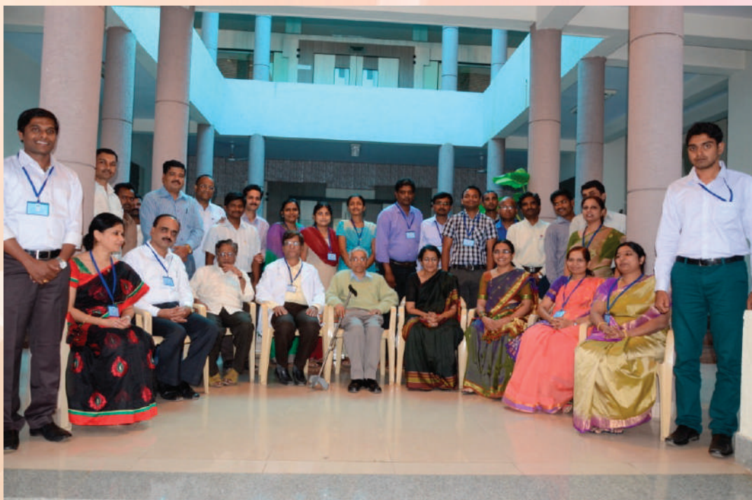
Department of Medical Education organized Orientation Programme for Ph.D. Scholars from December 26-28, 2013.