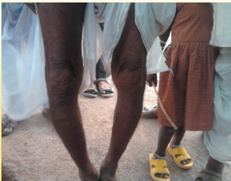
Effect of Fluoride on Joints