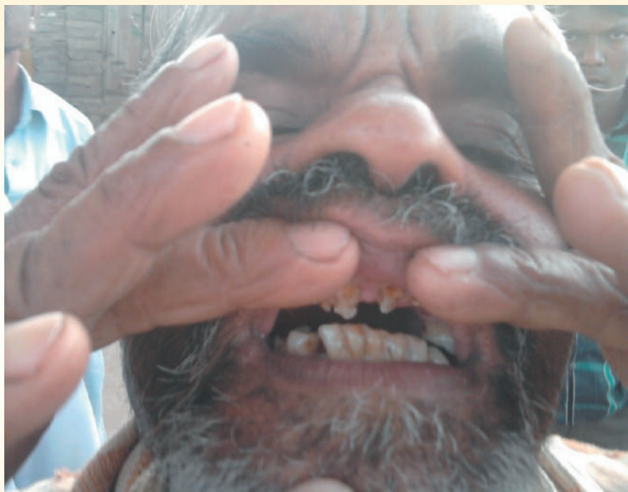
Effect of Fluoride on Teeth