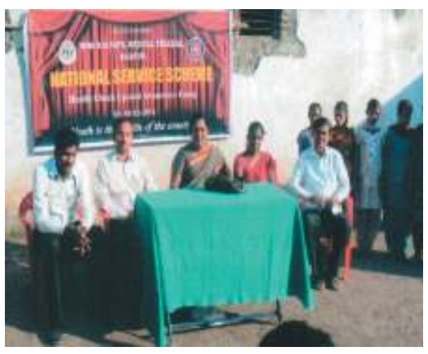
NSS Camp at Government School At Bijapur on December 18, 2012.