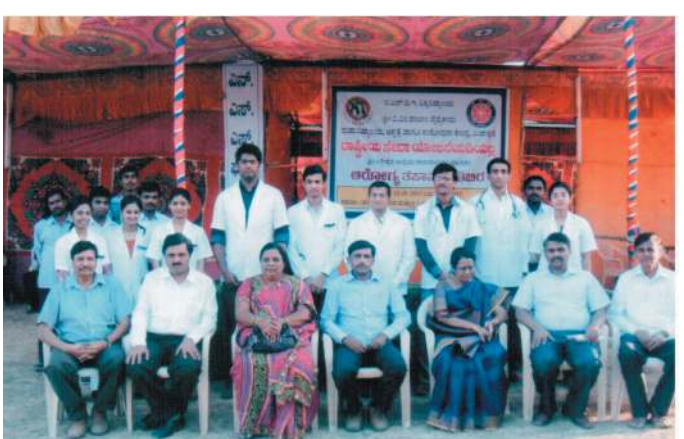
NSS Camp in Siddeshwar Jatra on January 12 to 18, 2013