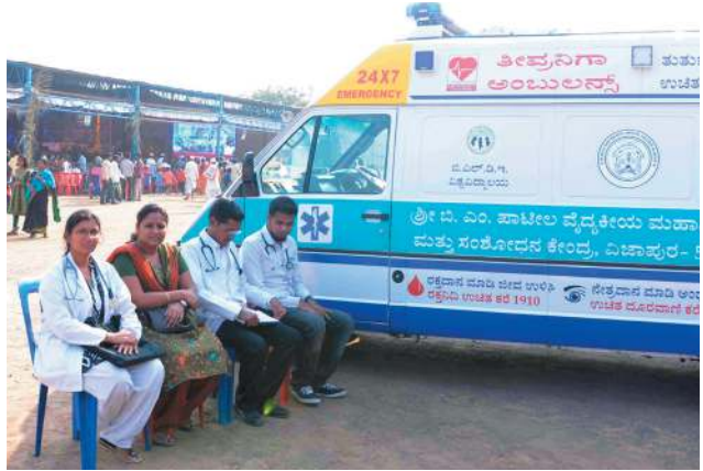
NSS Camp At 79th Kannada Sahitya Sammelan in Bijapur on February 9 to 11 2013