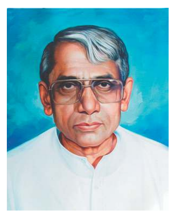
DOCTOR OF LETTERS