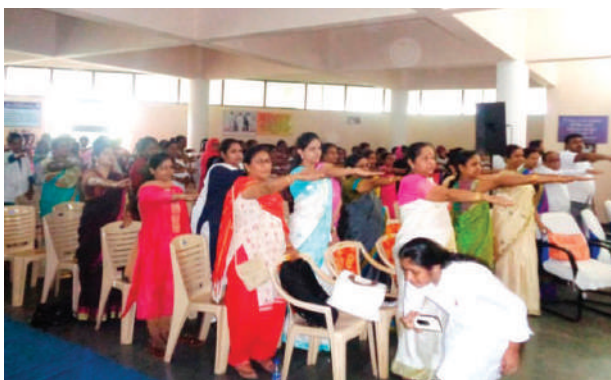
Asha Workers, Anganawadi Activists, Staff Nurses and Brahma Kumari members taking oath.