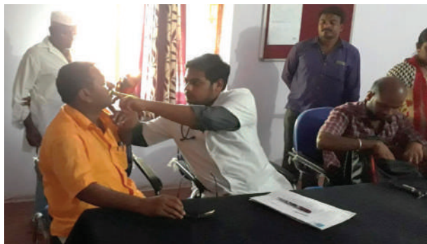
Assessment Camp conducted at the Government Hospital, Sindagi on April 03, 2018.