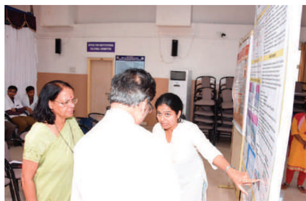
Poster presentation by UG, PG, Ph.D. Students