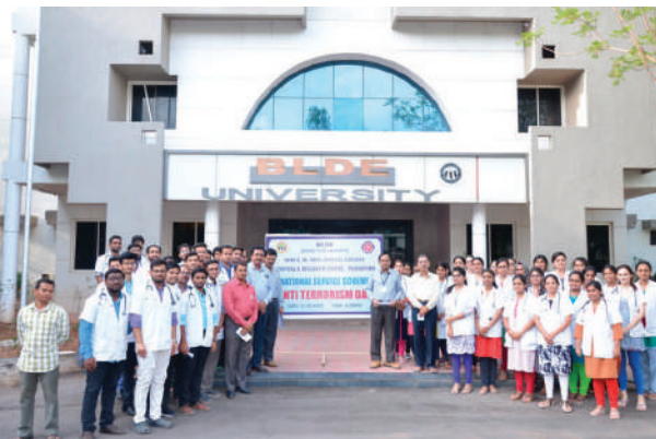
UG & PG Students, Faculty Members took Anti Terrorism Pledge.