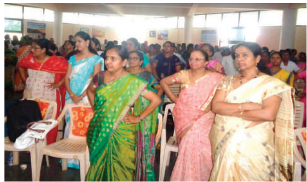
Asha Workers, Anganawadi Activists, Staff Nurses and Brahma Kumari members practicing Yoga.