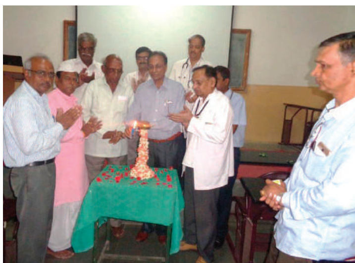
'World Hypertension Day' observed on May 17, 2018 at Lecture Hall-2, Ground Floor, Hospital Building.