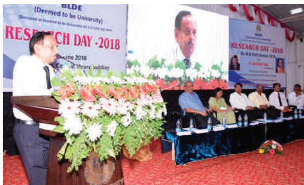
Dean, FoM & Principal delivering welcome address.