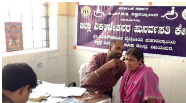
Assessment Camp conducted at the Government Hospital, Sindagi on June 12, 2018.