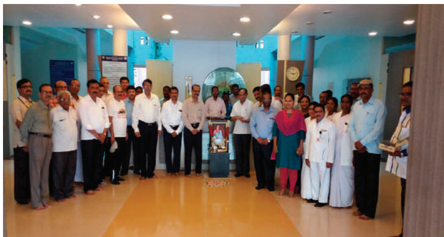
'Basava Jayanthi' celebrated on May 10, 2018 at the BLDE (Deemed to be University)