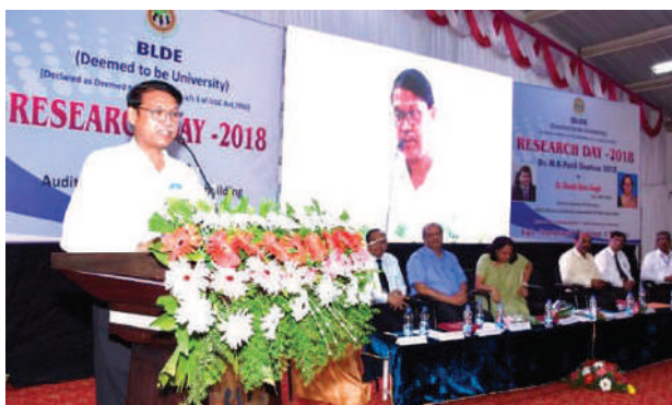
Hon'ble Vice-Chancellor addressing the gathering