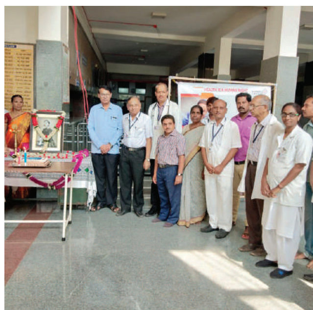
On the occasion of Birth Anniversary of Florence Nightingale 'International Nurses Day' celebrated on May 12, 2018