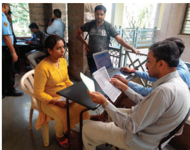
Candidates Reporting for Institutional Mop-Up Round Counseling