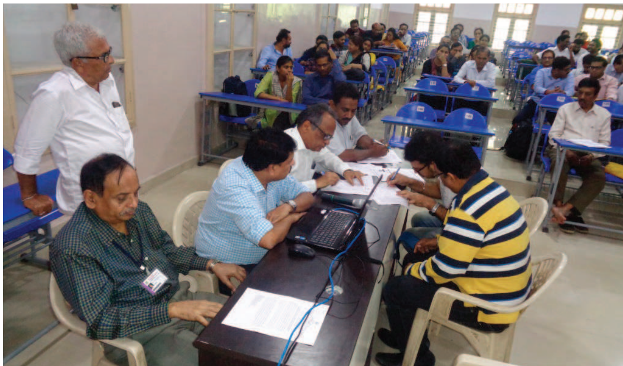
Aspirants of PG Admission attending the Institutional Mop-Up Round Counseling.

BLDE (Deemed to be University) conducted Institutional Mop-Up round counseling on May 28 and 29, 2018, total 71 PG Seats have been filled, out of 95 seats.