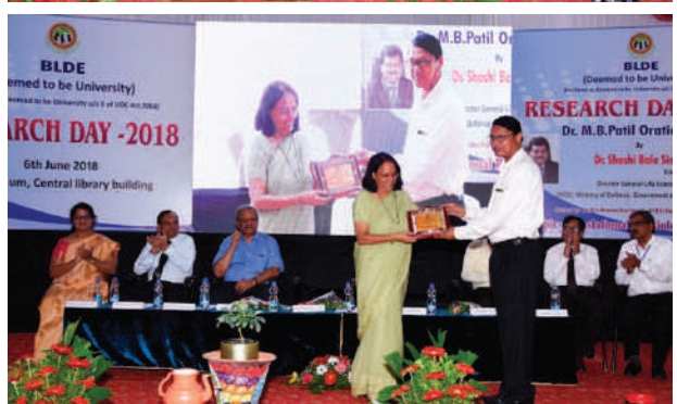
Hon'ble Vice-Chancellor presenting the memento to invited dignitaries