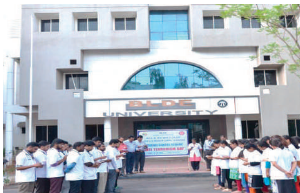
UG & PG Students, Faculty Members taking Anti Terrorism Pledge.