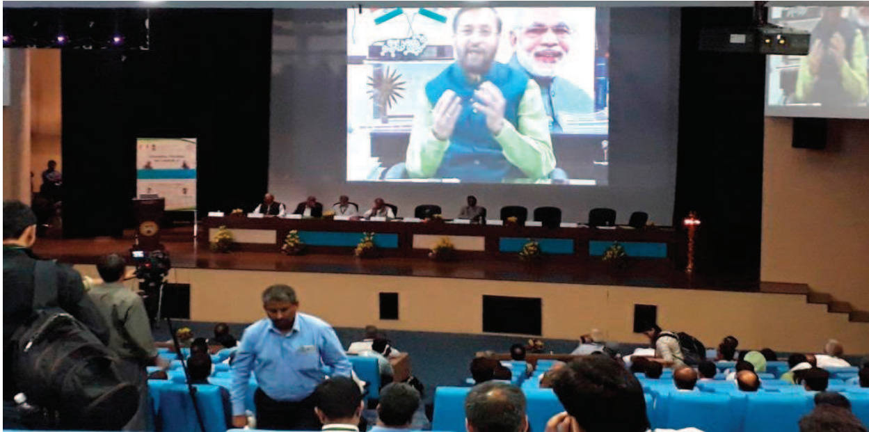
Shri Prakash Javadekar, Hon'ble Minister of Human Resource Development addressing the Delegates at Launch of 'Unnat Bharat Abhiyan 2.0' on April 25, 2018 held at New Delhi.