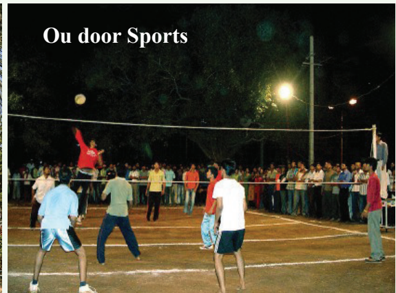
Ou door Sports