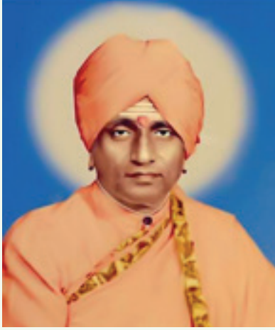
H.H. Shri Banthanal Swamiji