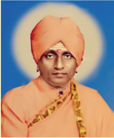
H.H. Shri Banthanal Swamiji