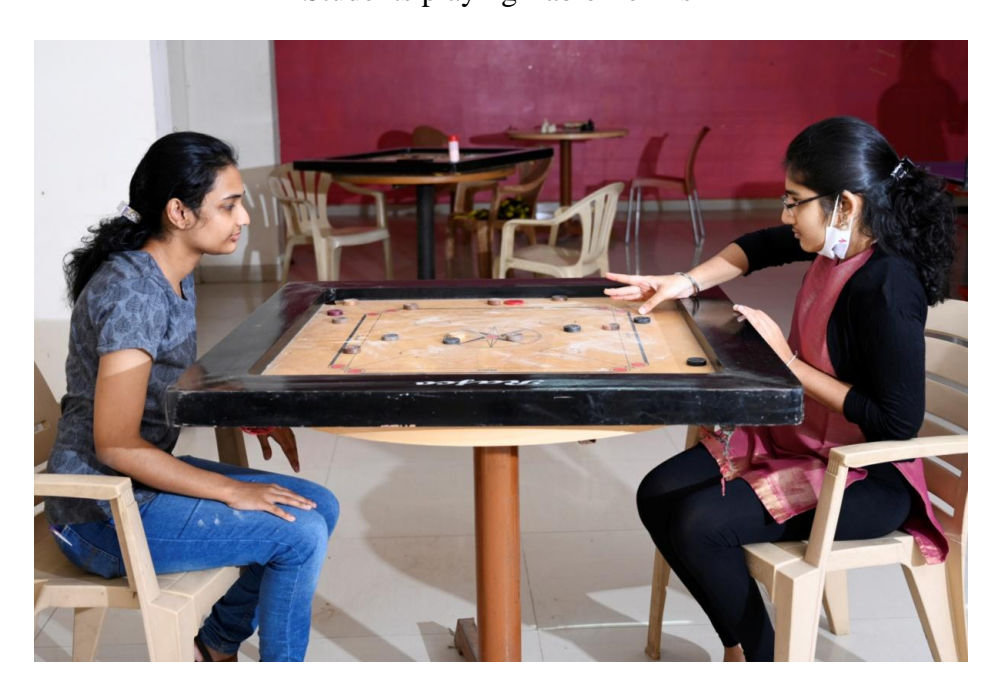
Students playing Carrom