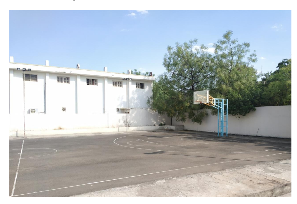
Basket Ball Court at Ladies Hostel