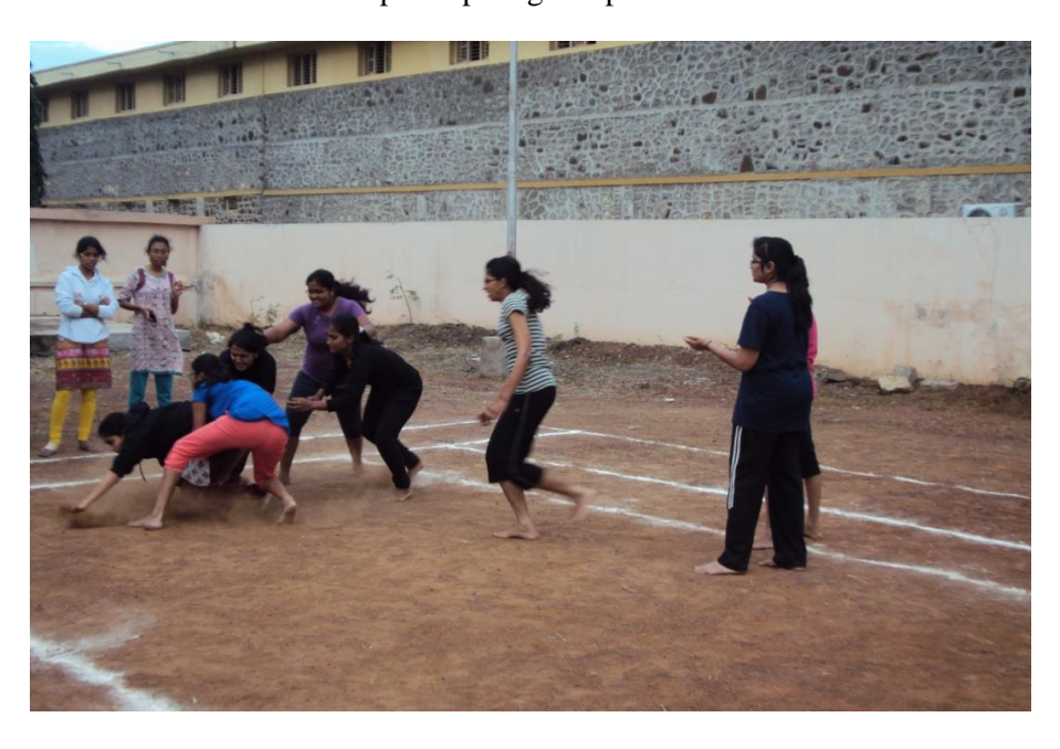
Students playing Kabaddi