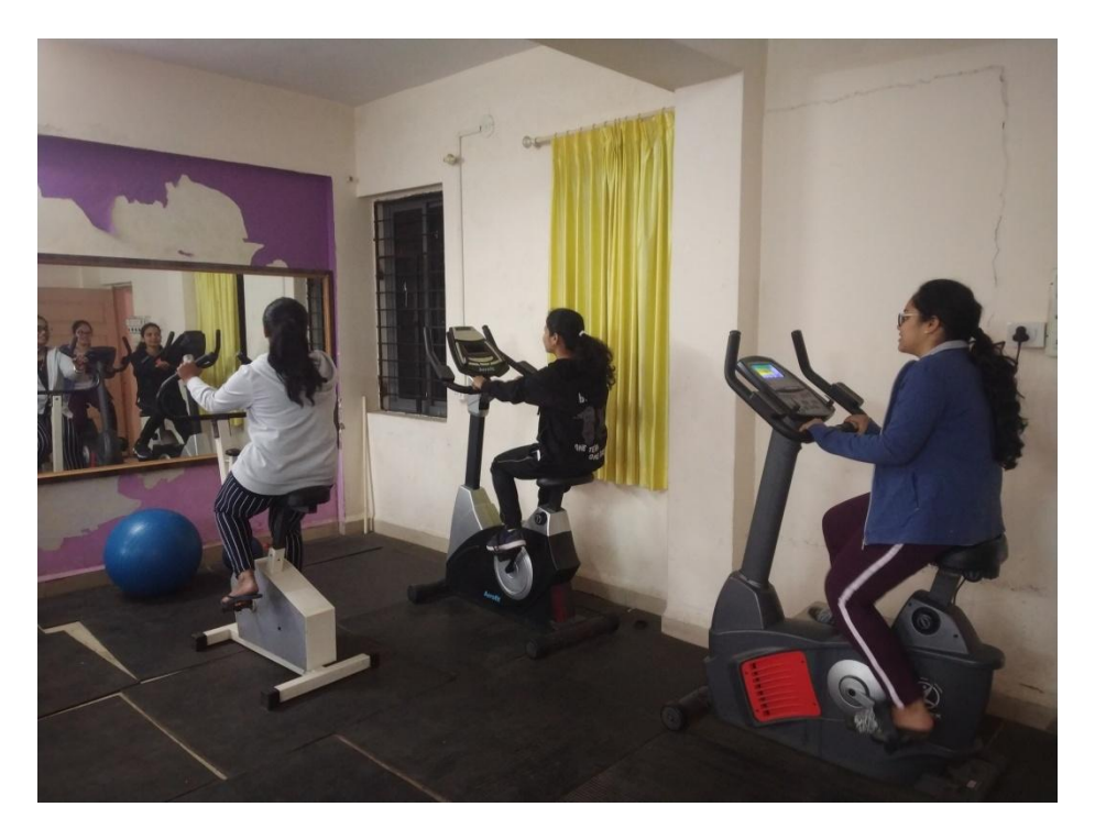
Students at the Gym at Ladies Hostel