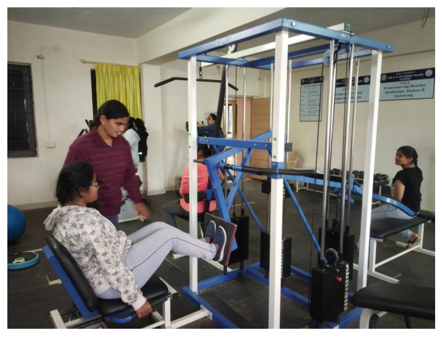
Students at the Gym with trainer in Ladies Hostel