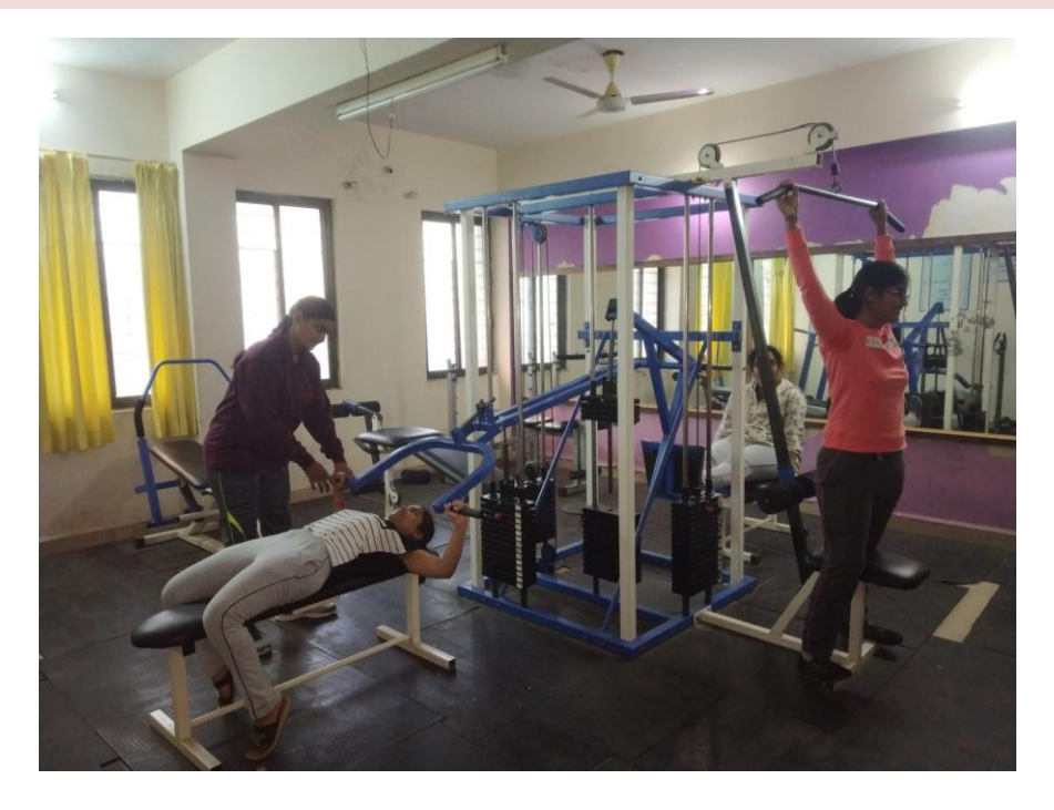
Students at the Gym with trainer in Ladies Hostel