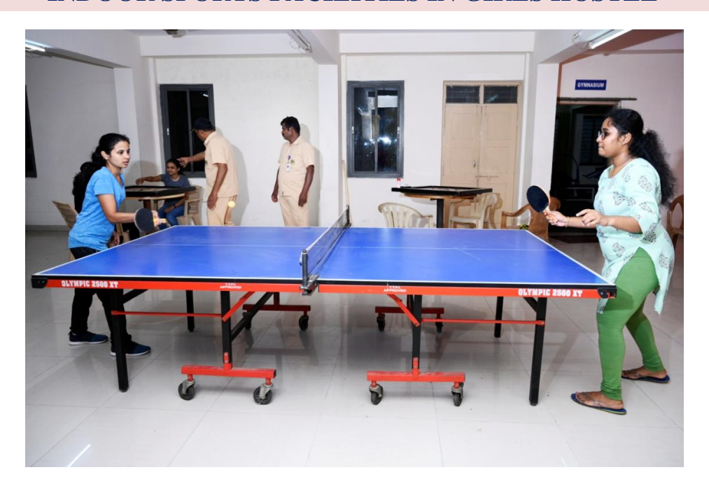
Students playing Table Tennis