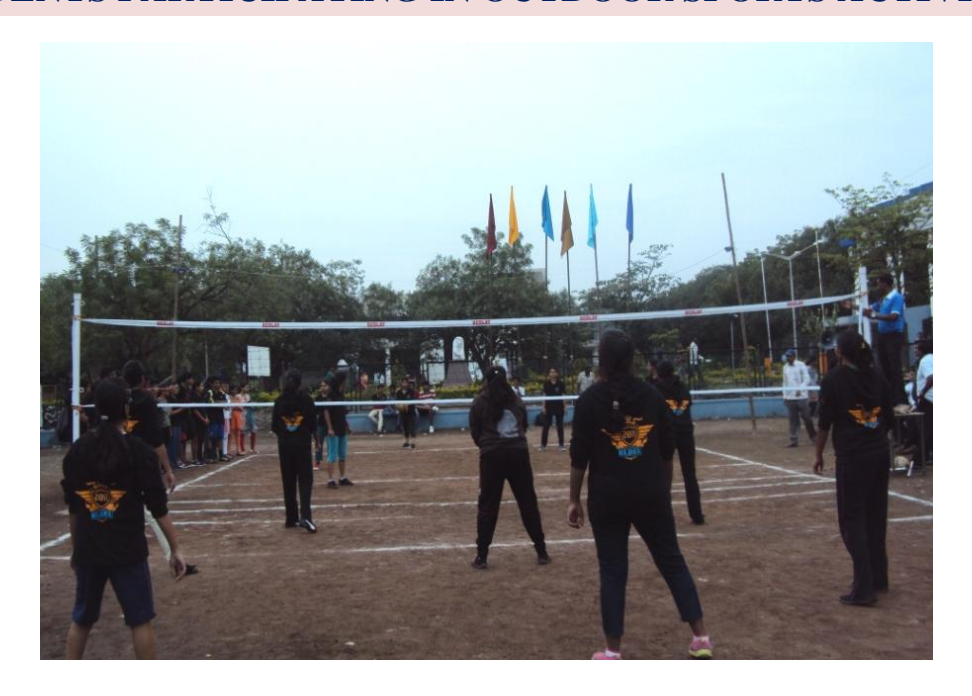
Students participating in sports activities