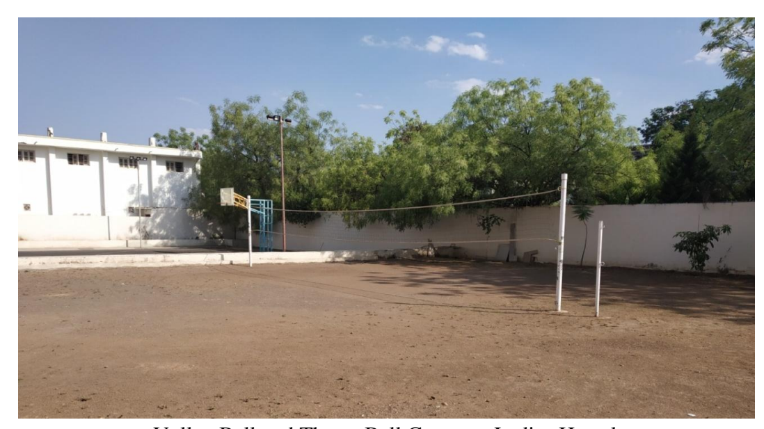
Volley Ball and Throw Ball Courts at Ladies Hostel