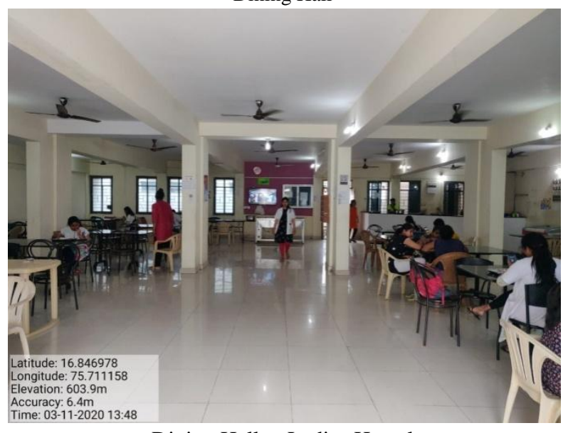
Dining Hall at Ladies Hostel