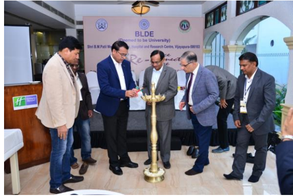
Hon'ble Vice-Chancellor inaugurating Alumni Meet