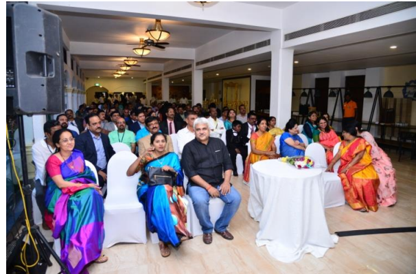
Hon'ble Vice-Chancellor addressing the gathering