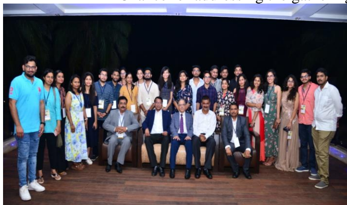
Hon'ble Vice-Chancellor and Faculty Members with Alumni