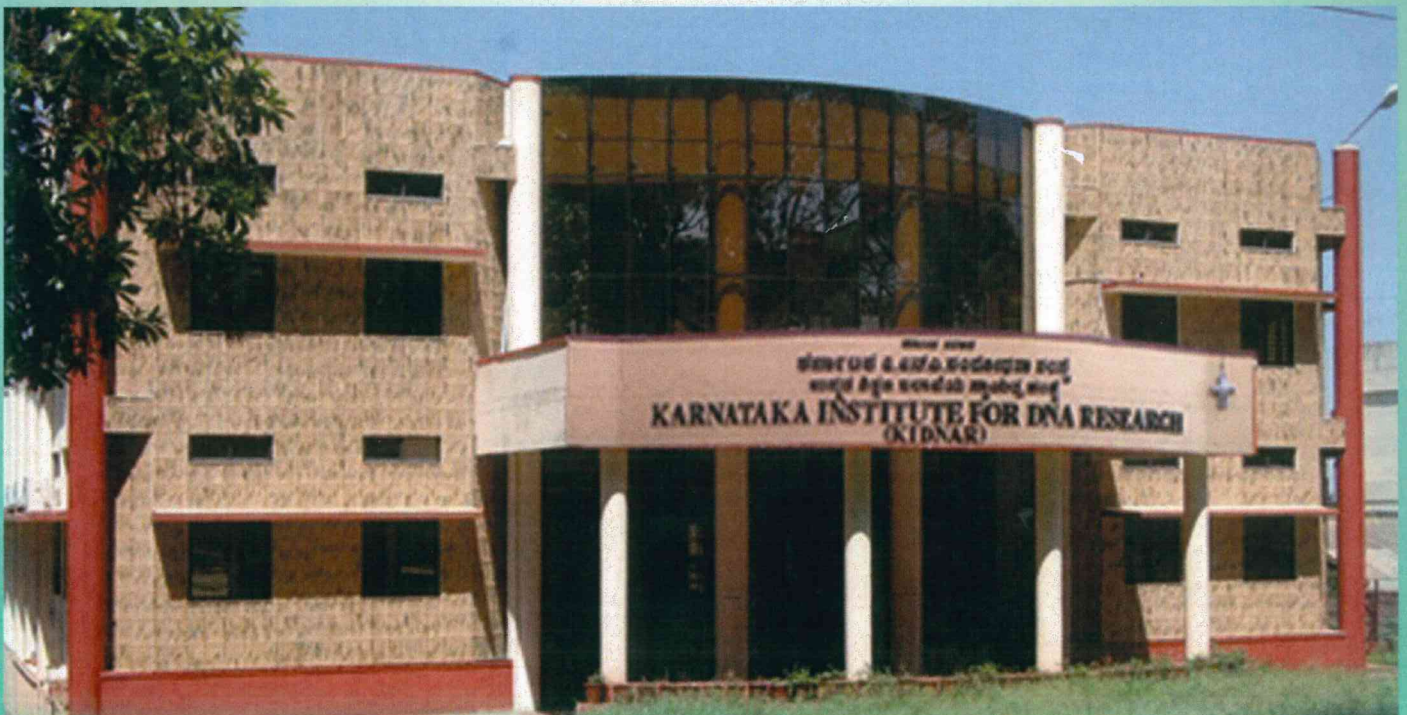
KARNATAKA INSTITUTE FOR DNA RESEARCH, DHARWAD