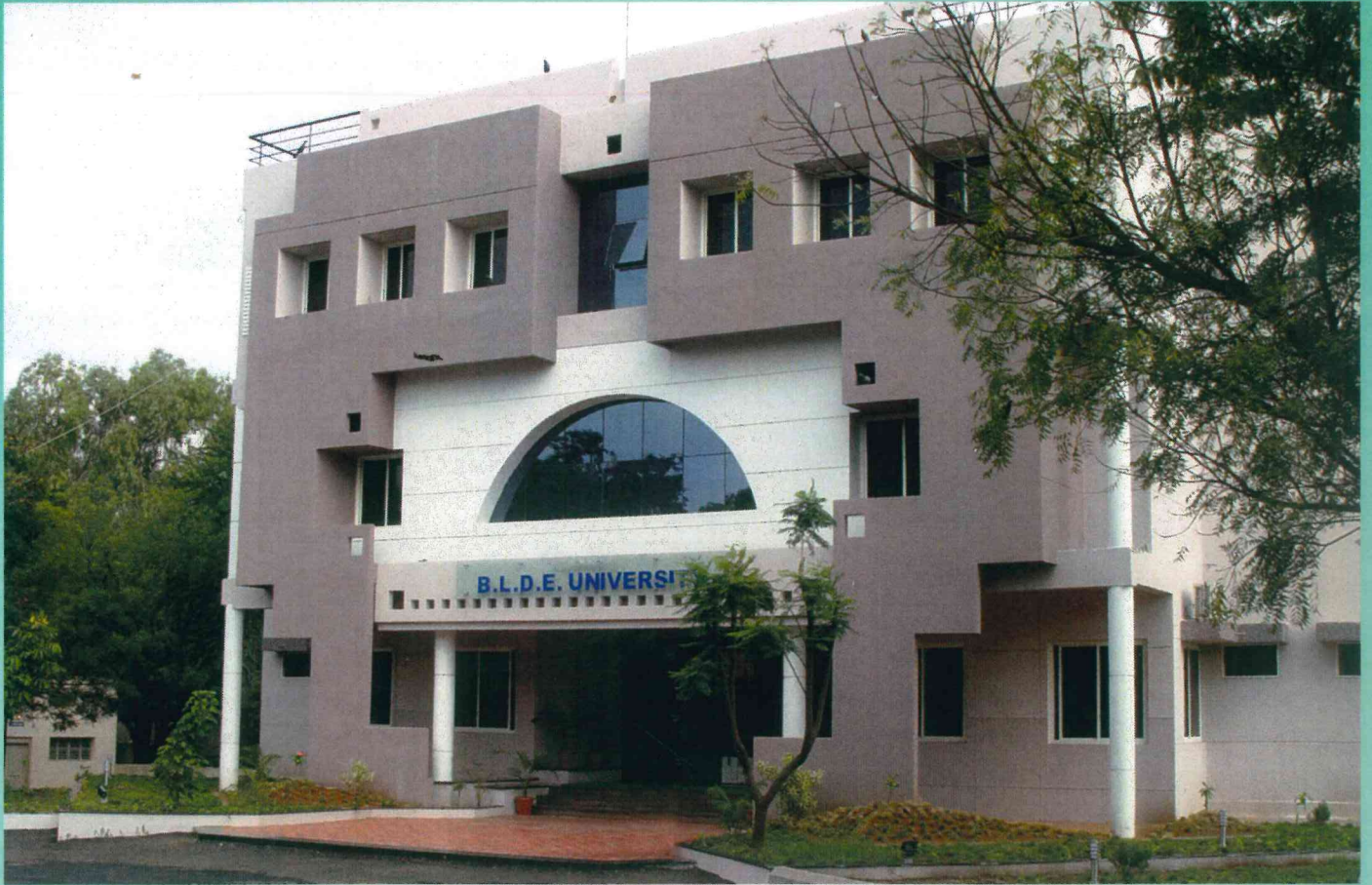
BLDE UNIVERSITY, VIJAYAPURA