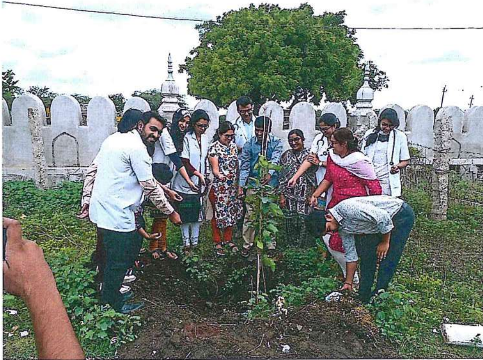
Plantation of saplings on the occasion of world environment day at Ukkali

On this occasion saplings were planted at RHTC, Ukkali. Teaching and Non-teaching faculty, students actively participated in the event.