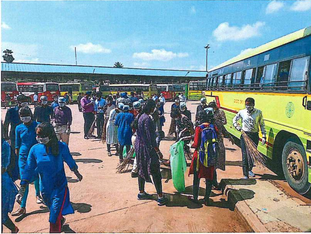
Swachta Abhiyan at Central Bus Stand, Vijayapura

On the occasion of Gandhi Jayanti, “Swachh Bharat Abhiyan” at Vijayapura on 2 nd Oct 2019 at Bus Stand and ‘Mulk Maidan Toap’ was organized by BLDE (DU). Hon’ble Vice-Chancellor, Dean, Faculty of Medicine, Medical Superintendent, Teaching and Non-Teaching Staff and Students participated in the programme.