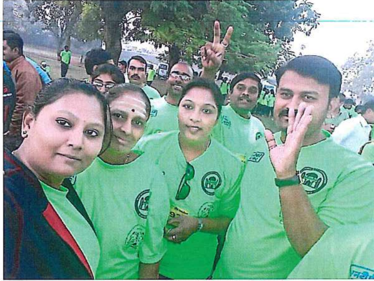
Participation of faculty at Vrukshathon

SHRI B. M. PATIL MEDICAL COLLEGE, HOSPITAL & RESEARCH CENTRE, VIJAYAPURA