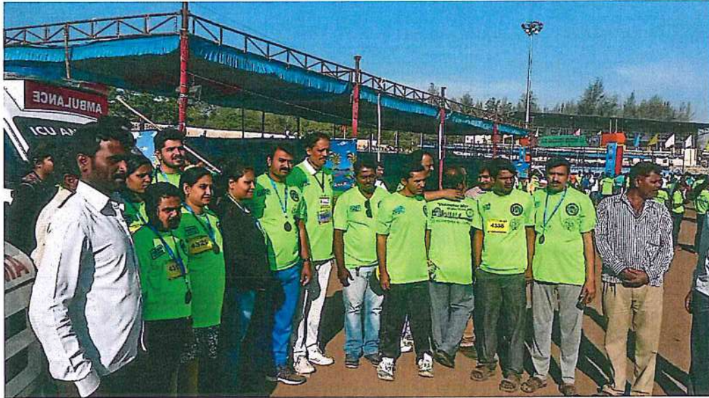
Participation of faculty at Vrukshathon

Vrukshathon for the year 2020 could not be organized due to covid pandemic.