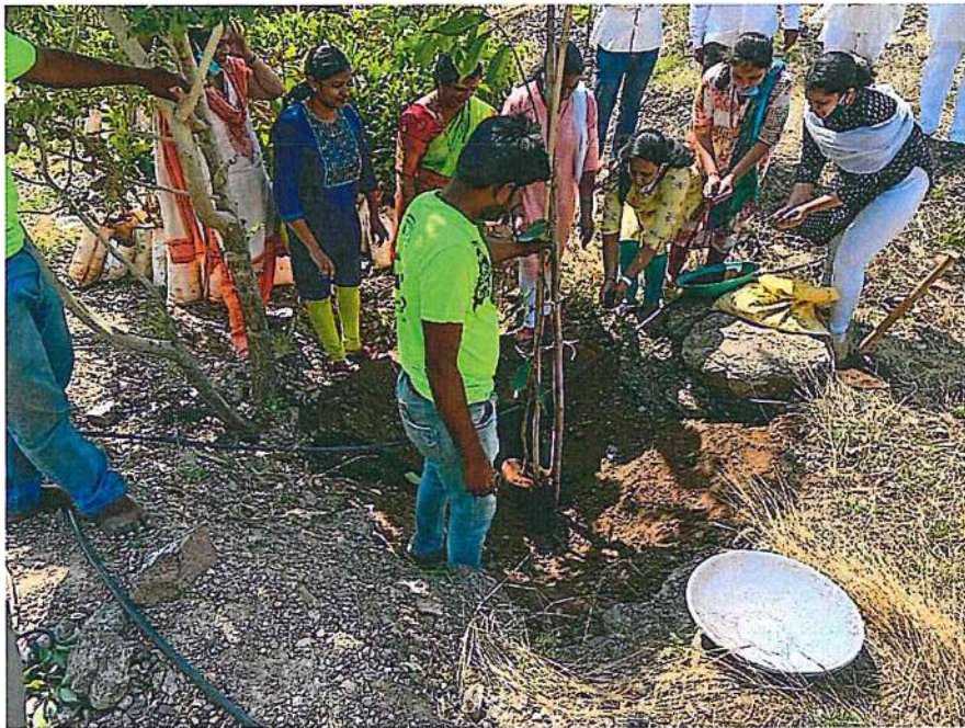
Plantation of Saplings, Karadoddi, Vijayapura