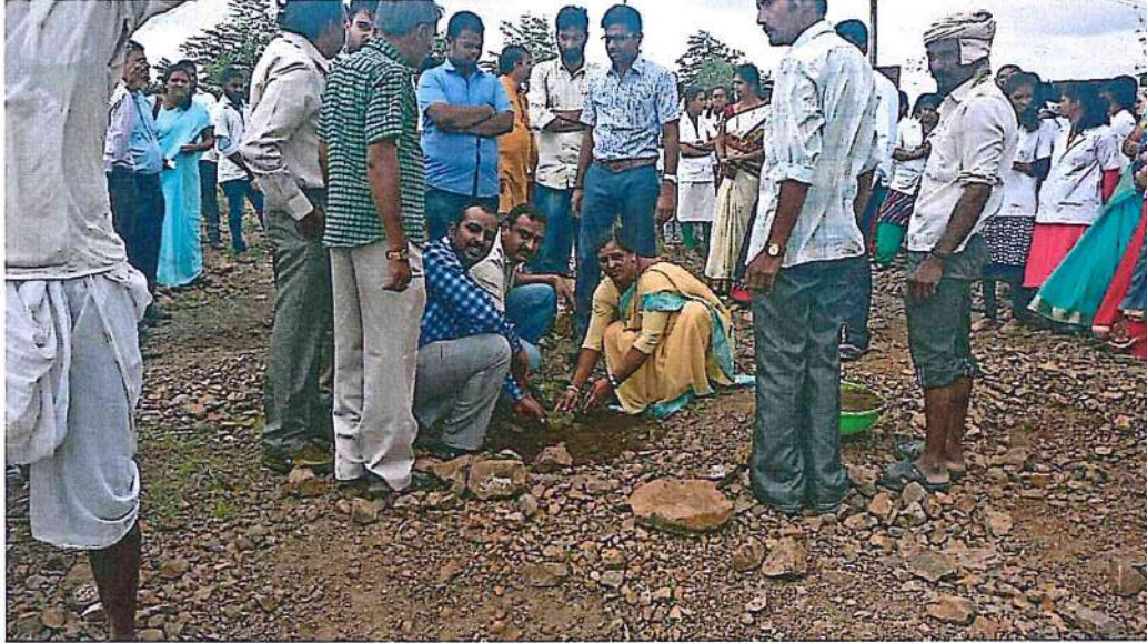
Plantation of Saplings by faculty and students, Ring Road Area, Vijayapura