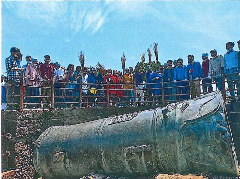
Swachta Abhiyan at Mulk Maidan Toap, Vijayapura

SHRI B. M. PATIL MEDICAL COLLEGE, HOSPITAL & RESEARCH CENTRE, VIJAYAPURA