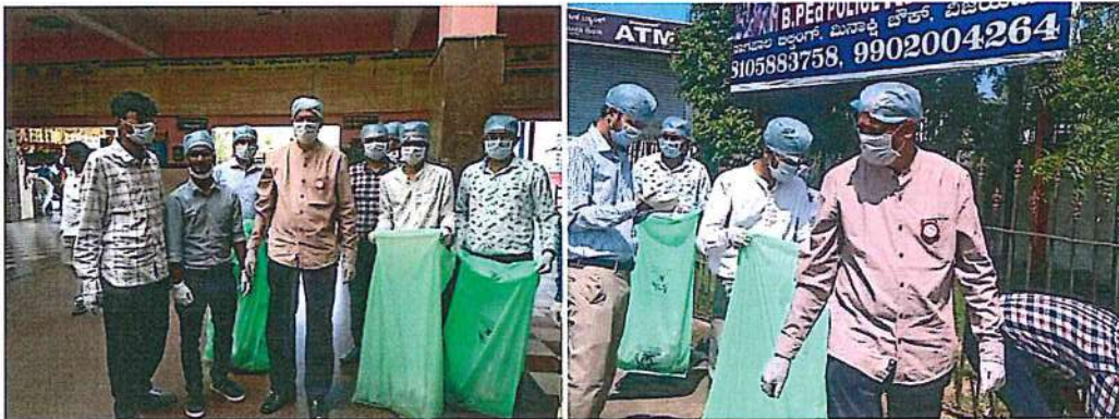
Swachta Abhiyan at Central Bus Stand, Vijayapura