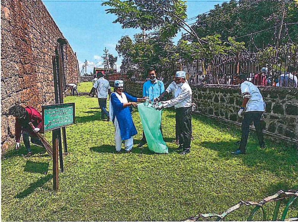
Swachta Abhiyan at Mulk Maidan toap, Vijayapura

SHRI B. M. PATIL MEDICAL COLLEGE, HOSPITAL & RESEARCH CENTRE, VIJAYAPURA