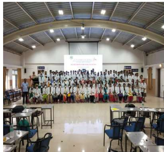
Group photo for 2020 batch