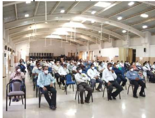
Teachers day Audience