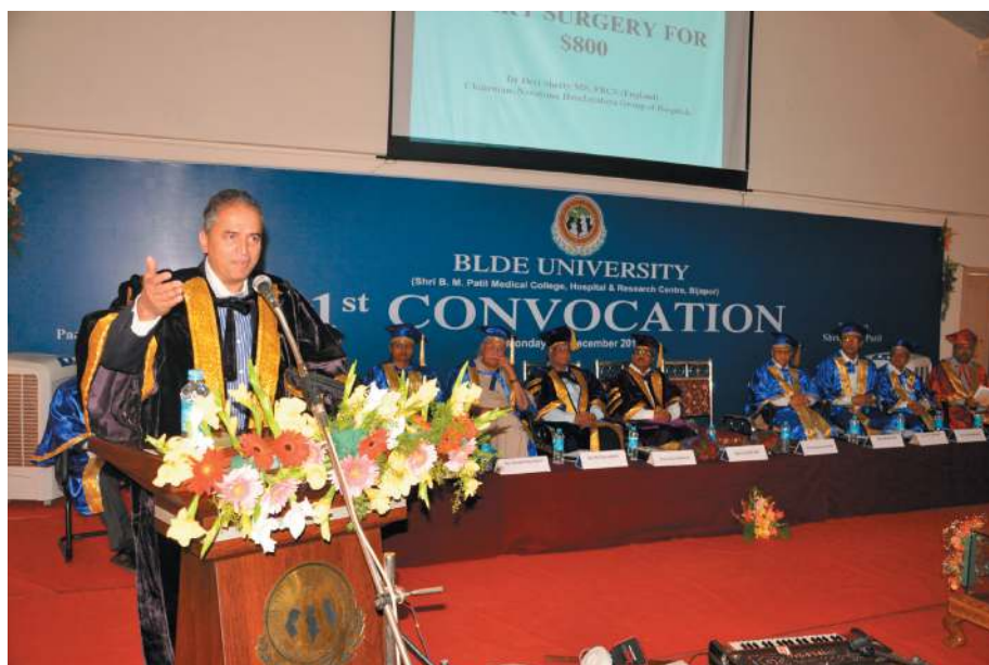
The Convocation address by Padmabhushan Dr. Deviprasad Shetty, Narayana Hrudayalaya, Bangalore.

Dr. Deviprasad Shetty, a renowned Cardiothoracic Surgeon, Director Narayana Hrudayalaya was the Chief Guest. In his convocation address, he emphasized the need of cutting the cost by using low cost technologies which will make health care services affordable to poor patients.