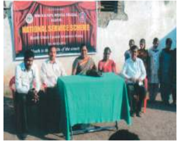
NSS Camp at Government School At Bijapur on December 18, 2012.