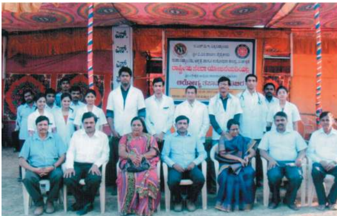
NSS Camp in Siddeshwar Jatra on January 12 to 18, 2013