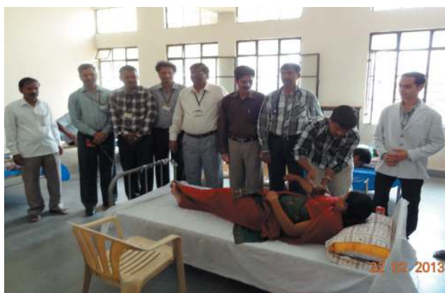
86 Engineering College Students donated blood on February 22, 2013.