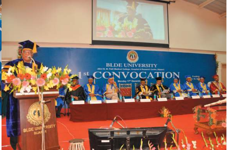
Glimpses of Convocation 17th December 2012