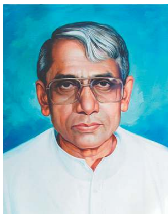
DOCTOR OF LETTERS