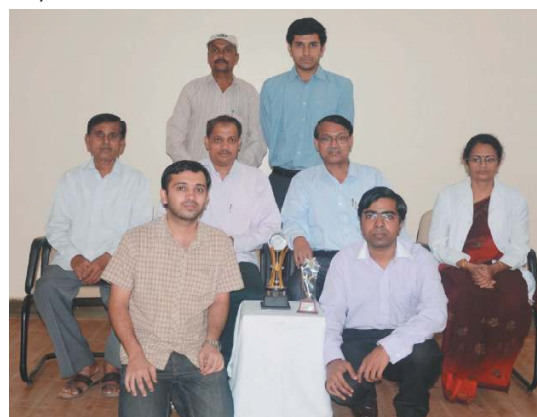
Table Tennis Winners in Inter deemed University at Shri Devaraj Urs University, Tamaka, Kolar.