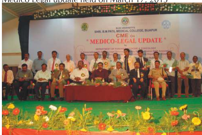
Department of Forensic Medicine CME on Medico Legal update held on March 17, 2013