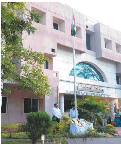
Vivekananda Jayanti Celebrated on January 12, 2013