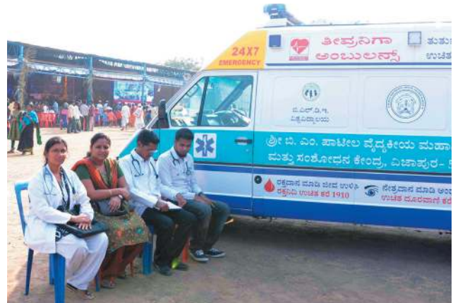
NSS Camp At 79th Kannada Sahitya Sammelan in Bijapur on February 9 to 11 2013