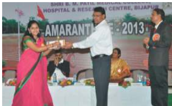
Various participants received prizes for their active participation during AMARANTHINE 2013 Annual sports day