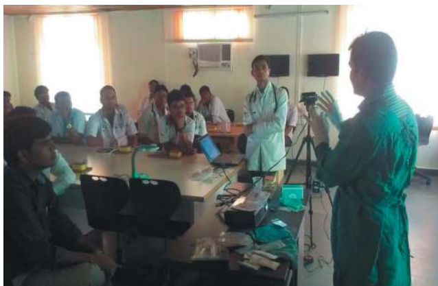
Clinical Skills Laboratory & Department of General Surgery. Basic Surgical Skills Workshop for Interns held on March 7, 2013