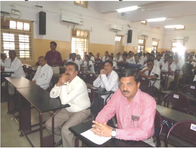
Faculty Members and students participated in the Matribhasha Divas event