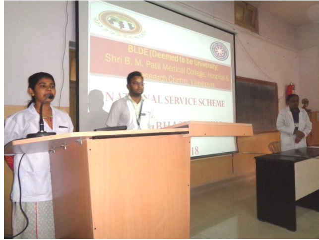
UG Students of Ist Year MBBS are talking about their mother tongue